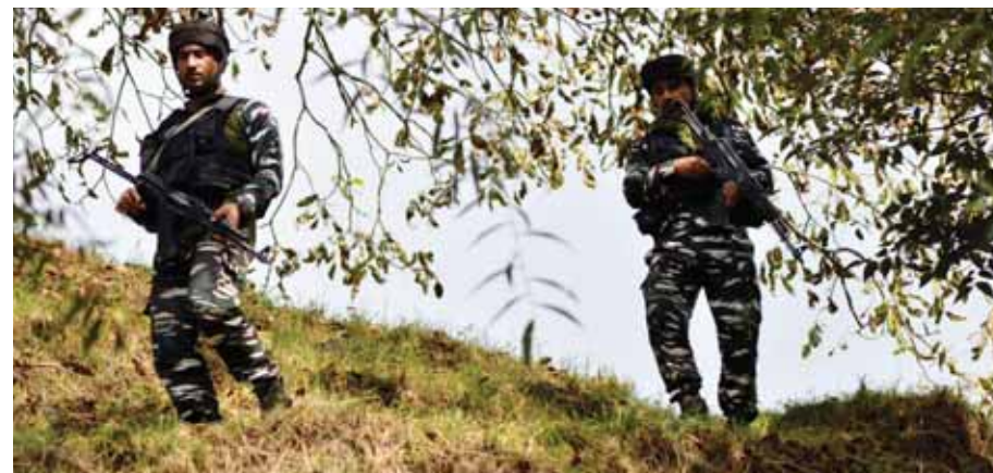
Security personnel on the fifth day of the ongoing encounter with terrorists, at Gadol Kokernag in Anantnag district, on Sunday

The manhunt to track down the group of terrorists, possibly hiding inside natural cave structures in the Garol forest area in Jammu & Kashmir's Anantnag district, entered its fifth day on Sunday even as intermittent firing continued and loud sounds of blasts pierced the relative calm at regular intervals. The commandos deployed on ground zero have been targeting natural cave-like structures to flush out the hiding terrorists to avoid any collateral damage. The civilian population has been shifted to nearby safer areas to prevent any loss of innocent lives in the exchange of fire. Unconfirmed reports claimed that the security forces had recovered a charred body from one of the hideouts blasted by the security forces but till late Sunday evening, the Army authorities had not issued any official statement confirming the same. Colonel Manpreet Singh, Commanding Officer, 19 Rashtriya Rifles, Major Ashish Dhonchak, and Deputy Superintendent of Jammu &