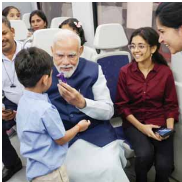
with artisans and craftsmen related to the footwear industry, in the national Capital.

During the ride, many passengers interacted with the Prime Minister and took selfies with him. He unveiled a plaque at the new station marking the nearly two-km extension of the Airport Line. The Prime Minister also interacted with some metro workers at the station. The Prime Minister then also met