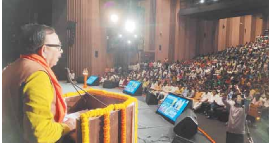
Union Minister MN Pandey addressing Vishwakarma Yojana programme in Varanasi on Sunday.

While discussing the Pradhan Mantri Vishwakarma Yojana, he said that in reality, while this scheme will be successful in connecting the peo-