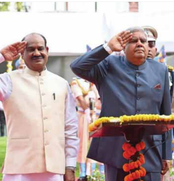
Rajya Sabha Chairman Jagdeep Dhankhar with Lok Sabha Speaker Om Birla during the flag hoisting ceremony at 'Gaja Dwar' of new Parliament building in New Delhi on Sunday

pitch the ball in the right areas. Siraj made his dance of destruction in the 4th over — 3.1, 3.3, 3.4 and 3.6 balls. Indian skipper Rohit Sharma hailed his team for an emphatic performance in the Asia Cup final against Sri Lanka, saying the effort will be "cherished for a very long time." "It was a great performance, especially to come and play like that in a final. Shows the mentality of the team. Very clinical. A performance like that will be cherished for a very long time," Rohit said at the post-match presentation ceremony.