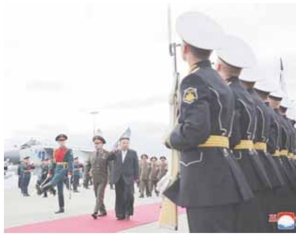
In this photo provided by the North Korean government, North Korea's leader Kim Jong Un, center, and Russian Defense Minister Sergei Shoigu, left, inspect honor guards on the arrival of a military airfield in Vladivostok, Russian Far East on Saturday.

Since entering Russia last Tuesday in his first overseas trip in more than four years, Kim had met President