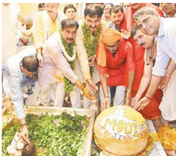
Laddu being offered at KVT on the occasion of PM Narendra Modi's 73rd birthday in Varanasi on Sunday.