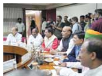
Union Ministers Rajnath Singh, Piyush Goyal, Congress leader Adhir Ranjan Chowdhury and other leaders at the all-party meeting in New Delhi on Sunday

by NCP leader Praful Patel. He said they were briefed that Parliament will shift to adjacent new building on the auspicious occasion of Ganesh Chaturthi on September 19. A separate meeting of the Floor leaders have been called by Leaders of House of Lok Sabha and Rajya Sabha on Monday before the Session begins in the existing Parliament. There was no new agenda other than the five Bills which were earlier put on the table by the Government. Leader of Congress in the Lok Sabha Adhir Ranjan Chowdhury, after the all-party meeting, said, "All Opposition parties demanded passage of the Women's Reservation Bill in this Parliament Session." The Special Session begins against the backdrop of the Narendra Modi Government's recent success at the just-concluded G20 summit, controversies sur-