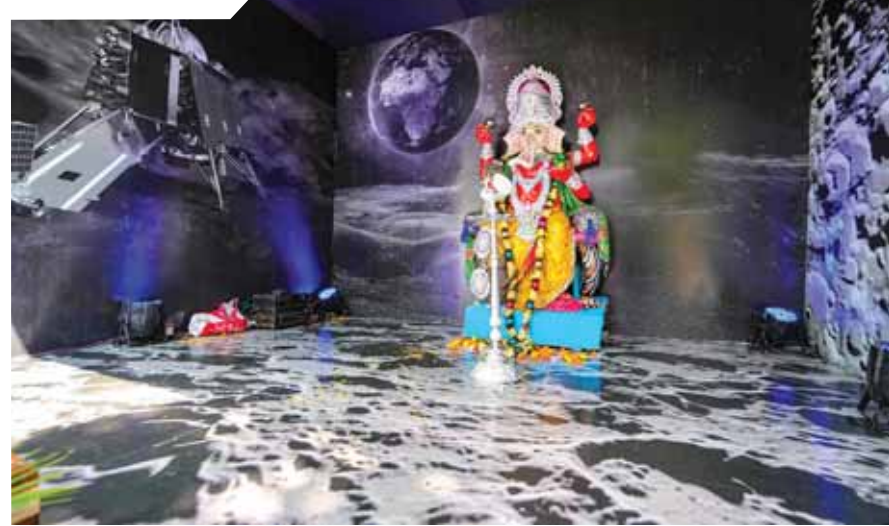
A pandal themed on Chandrayaan-3 is made for the Ganesh Chaturthi festival, in Kolkata