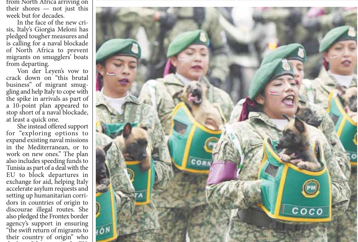
Members of the Mexican Armed Forces march during the annual Independence Day military parade in the capital's main square, the Zocalo, in Mexico City, Saturday.

Erdogan's statement on Saturday came more than a week after Turkey's foreign minister affirmed his country's resolve to join the EU and urged the bloc to take courageous steps to advance its bid.