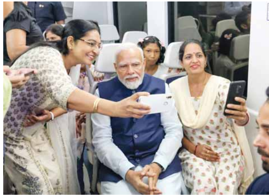
Prime Minister Narendra Modi travels via metro on his way to inaugurate India International Convention and Expo Centre (IICC) in New Delhi on Sunday

tion. During the ride, many passengers interacted with the Prime Minister and took selfies with him. The Prime Minister, who turned 73 on Sunday, interacted with the passengers inside the metro as they wished him. The passengers were seen clapping and singing "Happy birthday Modi". The Prime Minister gave chocolates to the children who greeted him. A video of Modi's metro ride shared on social media showed the Prime Minister exchanging smiles with commuters, playing with children, talking with a school student and passengers taking selfies with him. One of the passengers took this opportunity to wish Modi on the occasion of his 73rd birthday. The passenger wished him in Sanskrit language. "Janma-dinam-idham ayi priya sakhe | shantanotu te sarvada mudam || prarthayamahe bhava shatayushi | ishvaras-