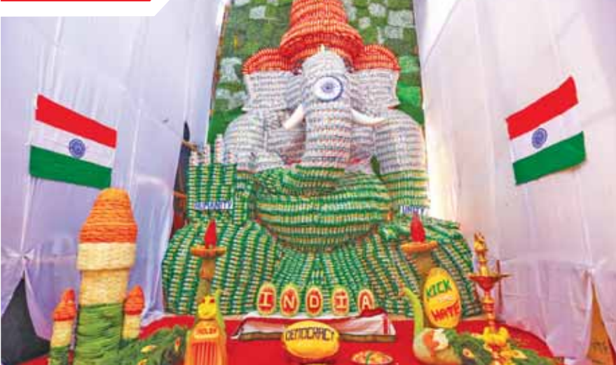
An eco-friendly Ganesha idol is made by using at least 5,000 biscuit packets for Ganesh Chaturthi festival, in Chennai