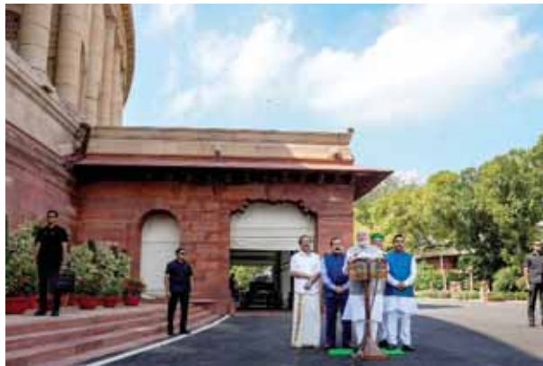
Prime Minister Narendra Modi addresses the media on the first day of the Special Session of Parliament in New Delhi. Union Ministers V Muraleedharan, Pralhad Joshi and Arjun Ram Meghwal are also seen

Modi is known to spring surprises at the last minute and is also adept in holding government business on sensitive