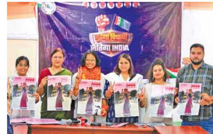
NSUI activists during the release of the first ever women's manifesto for Delhi University elections, in New Delhi, on Monday

He completed his graduation from the College of Vocational Studies and is currently pursuing a Masters degree in Buddhist Studies.