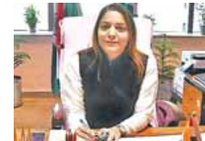
Minister Arvind Kejriwal.

The mayor said that under the AAP-led Municipal Corporation of Delhi, a "good healthcare model" will be established in the civic body, as has been in the Delhi government under the leadership of Chief