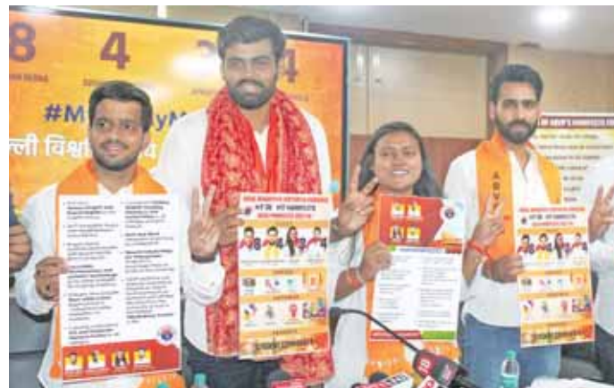
ABVP candidates Panel during the releasing manifesto for the Delhi University Students' Union (DUSU) elections, in New Delhi, on Monday

Issues of counselling centres, medical rooms and sanitary napkin dispensers at colleges will also be looked into, the manifesto said. Both the NSUI manifestos