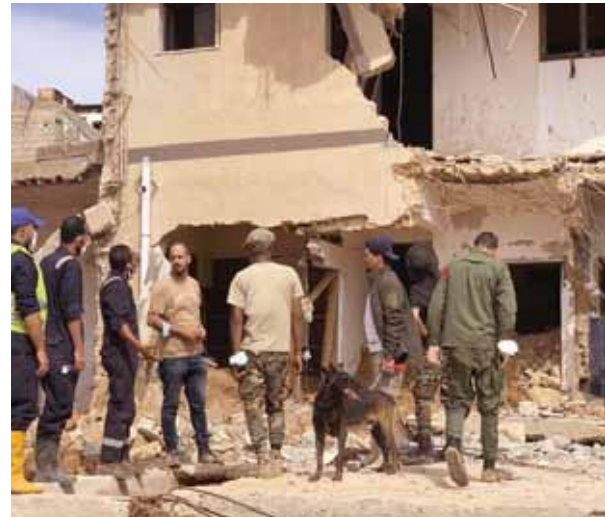
Rescue teams search for victims in Derna, Libya, on Sunday. Libyan authorities have opened an investigation into the collapse of two dams that caused a devastating flood in a Derna as rescue teams searched for bodies on Saturday, nearly a week after the deluge killed more than 11,000 people.

Seven of the surviving Greek rescue workers were in critical condition, the minister said. In a parallel statement, the