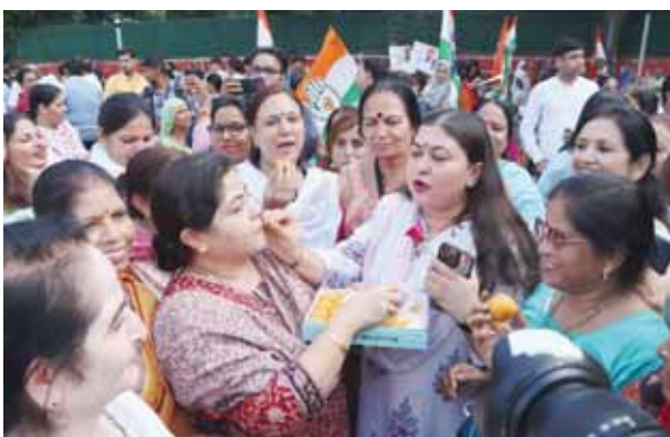
Congress members celebrate the Women's Reservation Bill in New Delhi on Tuesday.

Lok Sabha data shows that women MPs account for nearly 15 per cent of the lower House's strength while their