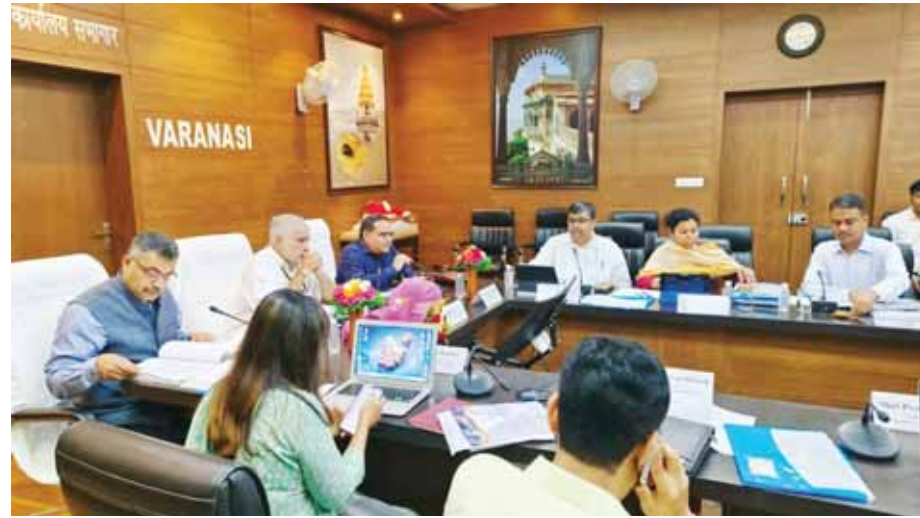
ECI officers holding a meeting with 12 DEOs/DMs on poll preparations in Varanasi on Monday.

They also discussed the preparation of the voter list in the context of the upcoming Lok Sabha elections, 2024. To make the voter list proper, instructions were given to all the 12 DEOs regarding registering the names of eligible voters in the voter list, removing the names of dead voters from the voter list and improving elector population (EP) and gender ratio.