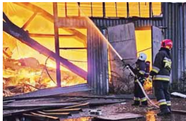
Emergency services work to extinguish a fire after a Russian attack in Lviv, Ukraine, on Tuesday.

Russia launched a massive drone attack on the western city of Lviv early Tuesday, damaging a warehouse facility in a fiery blaze and killing one man, Ukrainian authorities said. Ukraine intercepted 27 of 30 Shahed drones overnight, the Air Force said. But drones that got through air defense systems sparked an inferno at the industrial storage facility that was not used for military purposes, Gov. Maksym Kozlytsky said. An artillery strike in Kherson in the south struck a bus, killing a police sergeant and wounding two men, said Ihor Klymenko, Ukraine's minister of internal affairs. That strike also set a warehouse on fire. The developments in the war front came as Ukrainian President Volodymyr Zelenskyy was in New York to address the UN General Assembly and Security Council before going to Washington on Thursday to meet with lawmakers and President Joe Biden. Zelenskyy