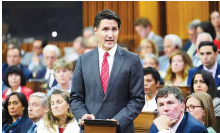
Canada Prime Minister Justin Trudeau delivers a statement in the House of Commons on Parliament Hill in Ottawa.

The Congress backed the Government's action and said the country's interests and concerns must be kept paramount and its fight against terrorism has to be uncompromising. "The Indian National Congress has always believed that our