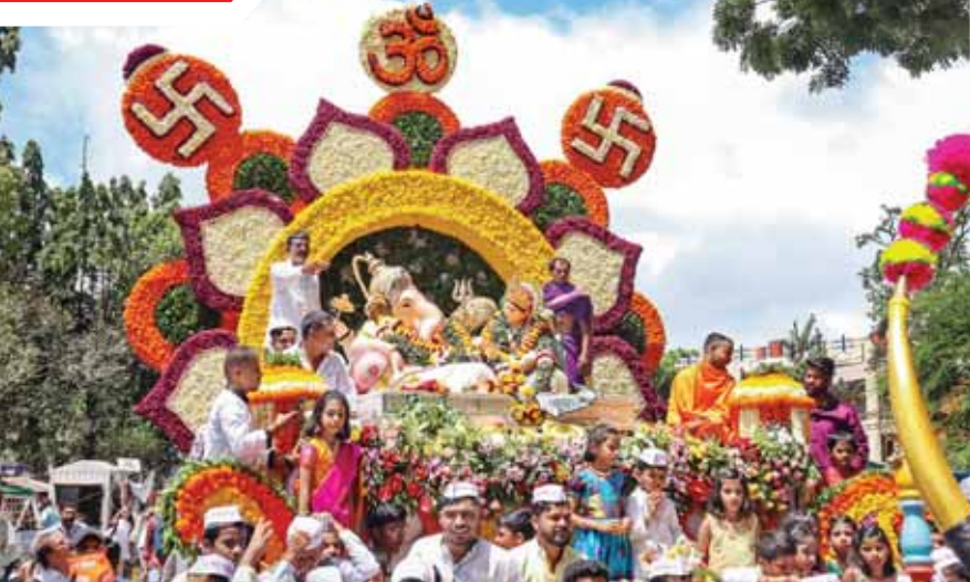
Devotees carry chariot with Ganpati idol on the occasion of Ganesh Chaturthi festival, in Pune