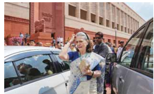
Congress MP Sonia Gandhi arrives at Parliament House complex during the special session in New Delhi on Wednesday