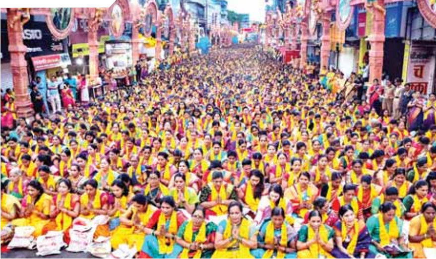
Women devotees chant 'Aharvashirsha' in front of Ulsav Mandap on the occasion of Ganesh Chaturthi festival, in Pune.