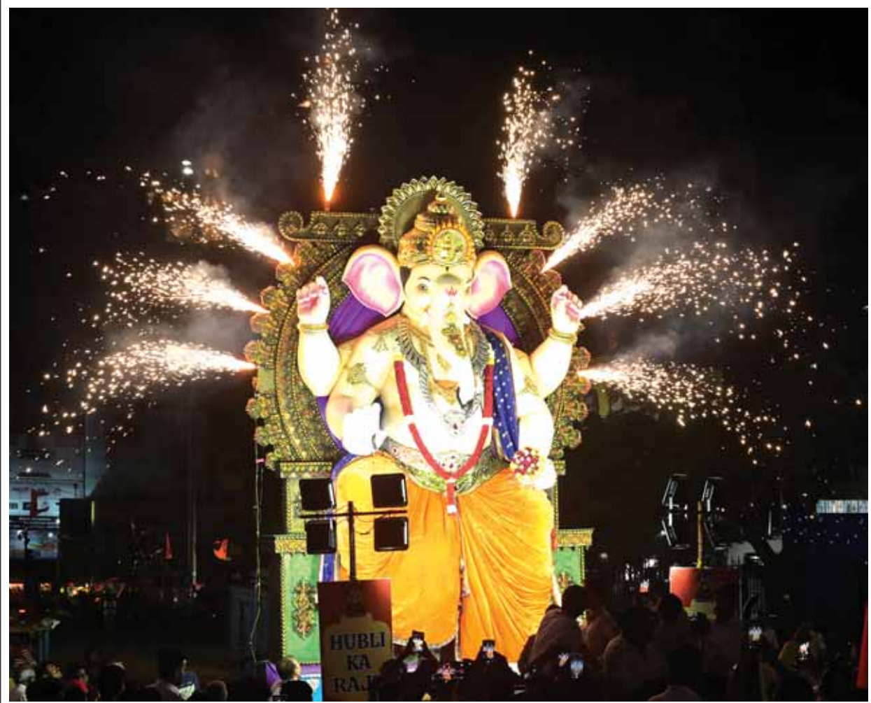
Hubballi Ka Raja arrives: Devotees carry a 23-feet Lord Ganesha idol for Ganesh Chaturthi celebrations in Hubballi on Tuesday. Ganpati is famously called Hubballi Ka Raja in Hubballi

UK Prime Minister Rishi Sunak's spokesperson told reporters that "work on the trade negotiations will continue as before" and that the UK was "not looking to conflate these issues". Soon after Trudeau's allegation, a UK Government spokesperson said Britain is in close touch with the Canadian authorities but declined to comment further.