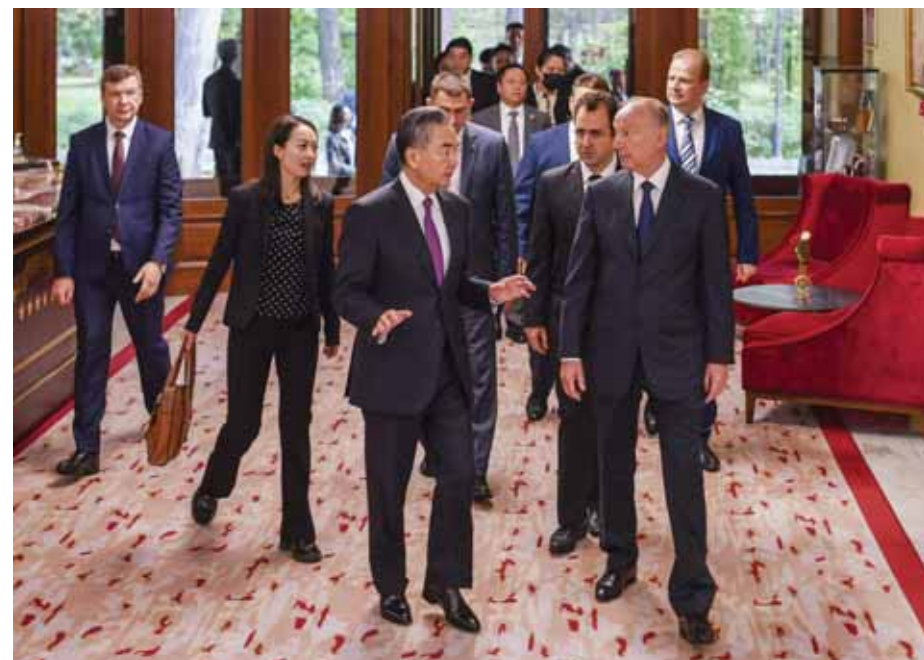
In this photo released by Xinhua News Agency, Chinese Foreign Minister Wang Yi, foreground left, talks to Secretary of the Security Council of the Russian Federation Nikolai Patrushev as they arrive for their 18th round of China-Russia strategic security consultation in Moscow, Russia on Tuesday.

Wang arrived in Russia on Monday on a four-day visit following his talks with US President Joe Biden's national security adviser in Malta over the weekend. Putin's plan to visit China was initially announced in July.