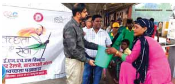
Campaign under 'Clean Station Day' being launched at the Banaras station in Varanasi on Tuesday