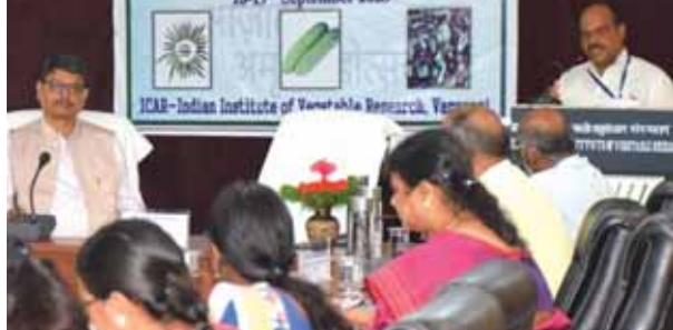
Progress of agrobiodiversity project being reviewed at IVRI in Varanasi on Tuesday.

A meeting was organised to review the research work being done on vegetable crops under Consortia Research Project (CRP) on Agro-Biodiversity, funded by Indian Council of Agricultural Research (ICAR), New Delhi and National Bureau of Plant Genetic Resources at ICAR-Indian Vegetable Research Institute (IVRI) here on Tuesday. This project is being conducted by six research institutes of the country including Indian Agricultural Research Institute (IARI), New Delhi, Punjab Agricultural University, Ludhiana, Indian Vegetable