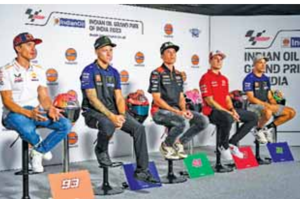
(L-R) Marc Marquez (Repsol Honda Team), Fabio Quartararo (Monster Energy Yamaha MotoGP Team), Aleix Espargaro (Aprilia Racing Team), Augusto Fernandez (GASGAS Factory Racing) and Franco Morbidelli (Monster Energy Yamaha MotoGP Team) during a pre-event Press conference ahead of Indian Oil Grand Prix of India at the Buddh International Circuit, in Greater Noida, on Thursday

The launch of the VCIMS portal assumes significance as it will help in curbing scams and cases of corruption like classrooms and excise scam and fake billing in the PWD by individuals / contractors, witnessed recently in Delhi.