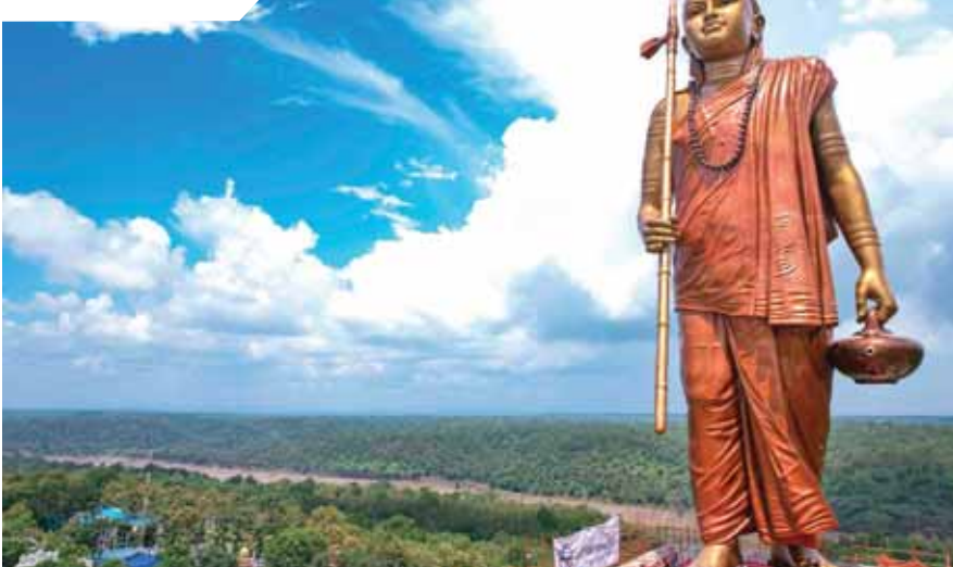
The 108 feet tall statue of saint Adi Shankaracharya, named 'Ekamata Ki Pratima' after it was unveiled in Khandwa