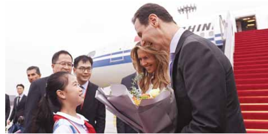
In this photo released by Xinhua News Agency, Syrian President Bashar Assad, right, and first lady Asma Assad receive a bouquet of flowers from a young girl as they arrive in Hangzhou, China, Thursday.

Foreign Ministry spokesperson Mao Ning said Assad's visit would "further deepen political mutual trust and cooperation in various fields between the two countries and push bilateral rela-