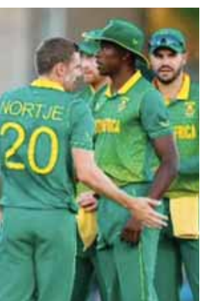
the World Cup, forcing the team management to name replacements.

However with the South African team set to leave for India on Saturday, both players failed to recover in time for