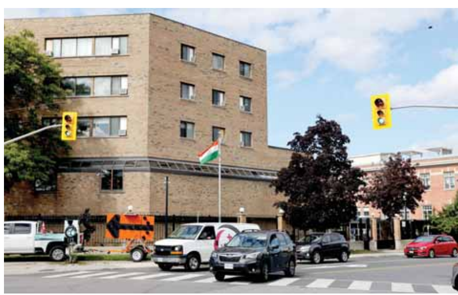
High Commission of India in Ottawa

"We are a country of the rule of law. We are going to