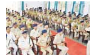
PIONEER NEWS SERVICE ■ PRAYAGRAJ

On the occasion of RPF Raising Day on Wednesday different activities were organised in NCR. Suraksha sammelan was held in the auditorium of RPF Zonal Training Centre/Prayagraj in which Principal Chief Security Commissioner (PCSC)/NCR addressed about 150 officers and members of the force. The PCSC distributed awards and merit certificates to best performers in crime prevention and detection. A tree plantation programme was organised in the campus of RPF Zonal Training Centre in Agra Division. A blood donation camp was organised by Jhansi division in which Sr DSC donated blood along with other members of the force. A cleanliness drive was organised