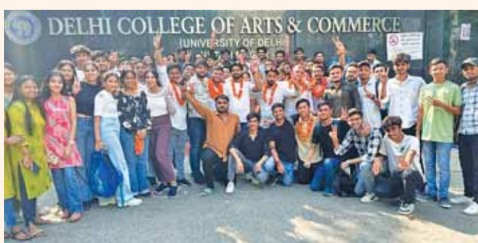
Association (AISA) have fielded candidates for all four posts. The ABVP had won three of the four seats in the 2019 DUSU elections.

The Akhil Bharatiya Vidyarthi Parishad (ABVP), the National Students' Union of India (NSUI), CPI(M)-backed Students' Federation of India and CPI-ML(Liberation)-affiliated All India Students'