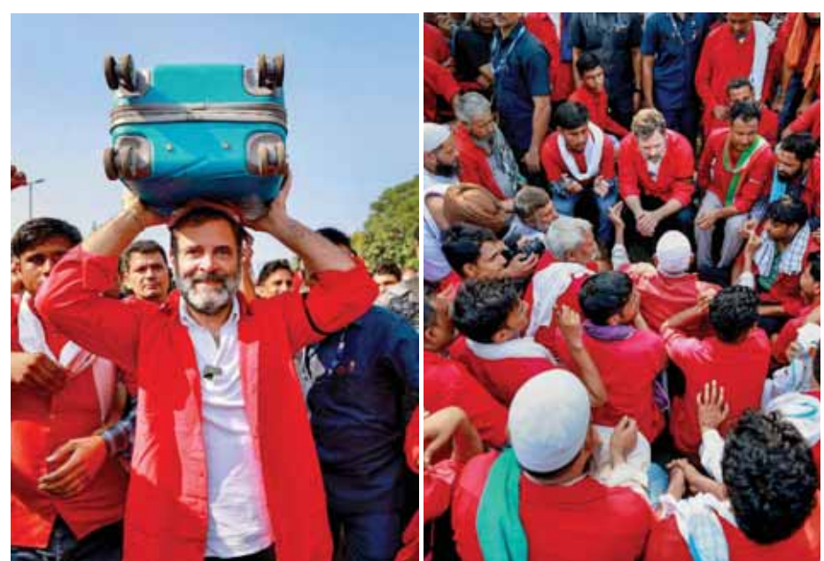
Congress leader Rahul Gandhi, wearing the porters' trademark red shirt and badge, carries luggage over his head during an interaction with porters at Anand Vihar railway station, in New Delhi, on Thursday

Following directions of the High Court the ED on Thursday submitted the list of properties of the TMC second-in-command along with those of other officials of the said company.