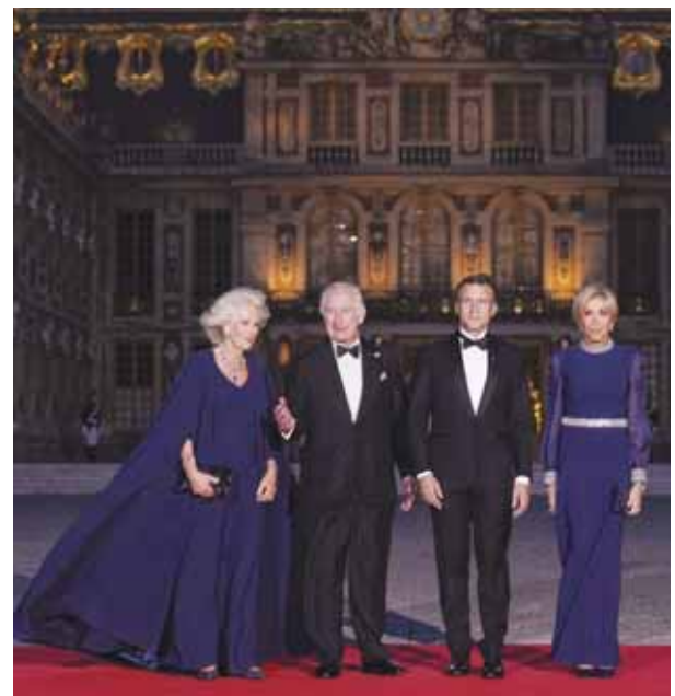
French President Emmanuel Macron, center right, his wife Brigitte Macron, right, Britain's King Charles III, center left, and Queen Camilla arrive for a state dinner, at the Chateau de Versailles, west of Paris, Wednesday.

The king also met there with the Paris Saint-Germain soccer club president Nasser Al-Khelaifi, who gave him the club's No. 3 jersey and explained the club's involvement in supporting young people and communities in difficulty.