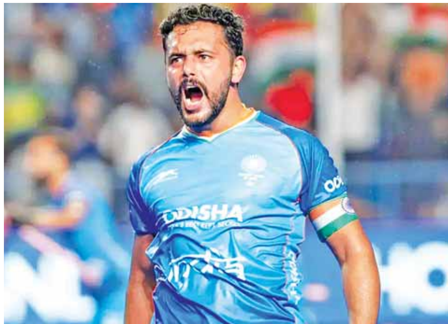
same," Harmanpreet said in a Hockey India release.

"I would also like to take this opportunity to congratulate our boxing star Lovlina for the