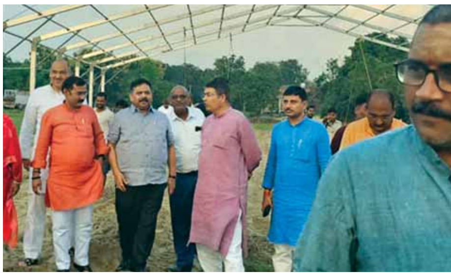
Senior BJP leaders inspecting preparations at PM's meeting site at Ganjari in Varanasi on Thursday.

Separate parking spaces have been earmarked for all types of vehicles coming from all directions. They said that there should be a complete arrangement for mobile toilets,