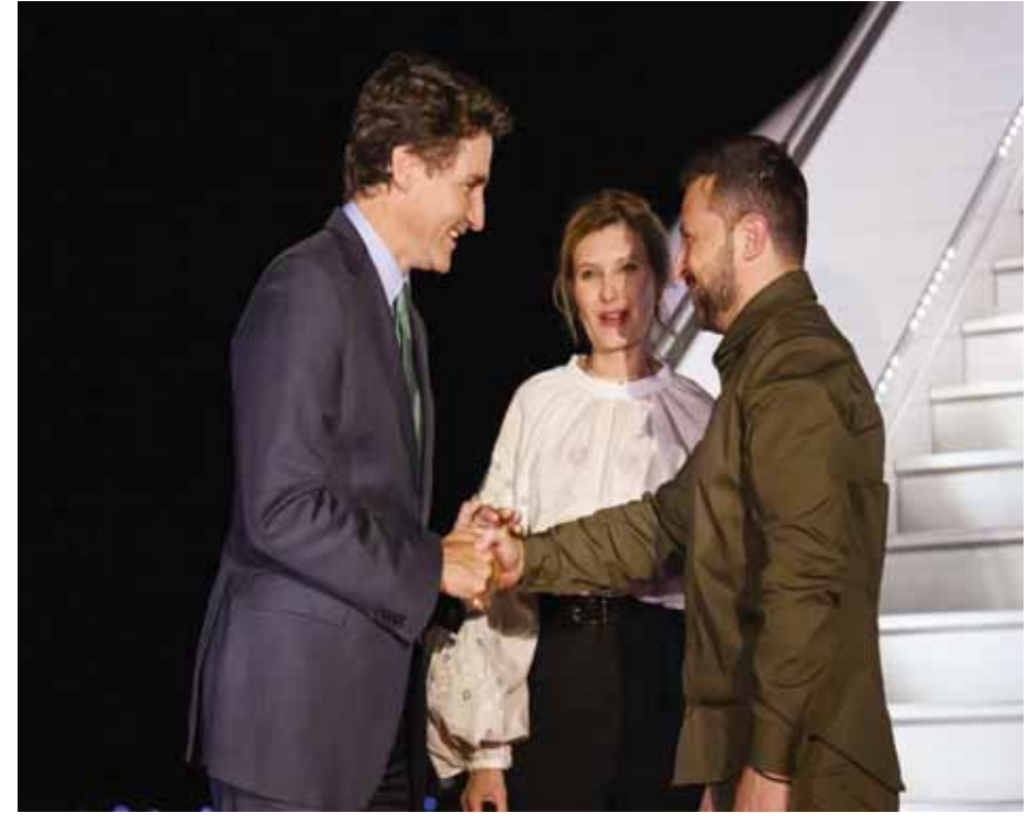
Canadian Prime Minister Justin Trudeau, left, greets Ukrainian President Volodymyr Zelensky as his wife Olena Zelenska looks on as they arrive at Ottawa airport, Canada, on Thursday.

permit for three years with pathways to permanent residency and citizenship. Zelensky is facing questions in Washington about the flow of American dollars that for 19 months has helped keep his troops in the fight against Russian forces. Ukrainian troops are struggling to take back territory that Russia gained over the past year. Their progress in the next month or so before the rains come and the ground turns to mud could be critical in rousing additional global support over the winter. Zelensky made his first official visit to Canada in 2019. Zelensky to speak before Canadian Parl Ukrainian President Volodymyr Zelensky will speak to the Canadian Parliament on Friday as part of his campaign to bolster support from Western allies for Ukraine's war against the Russian invasion. Zelensky flew into Canada's capital late Thursday