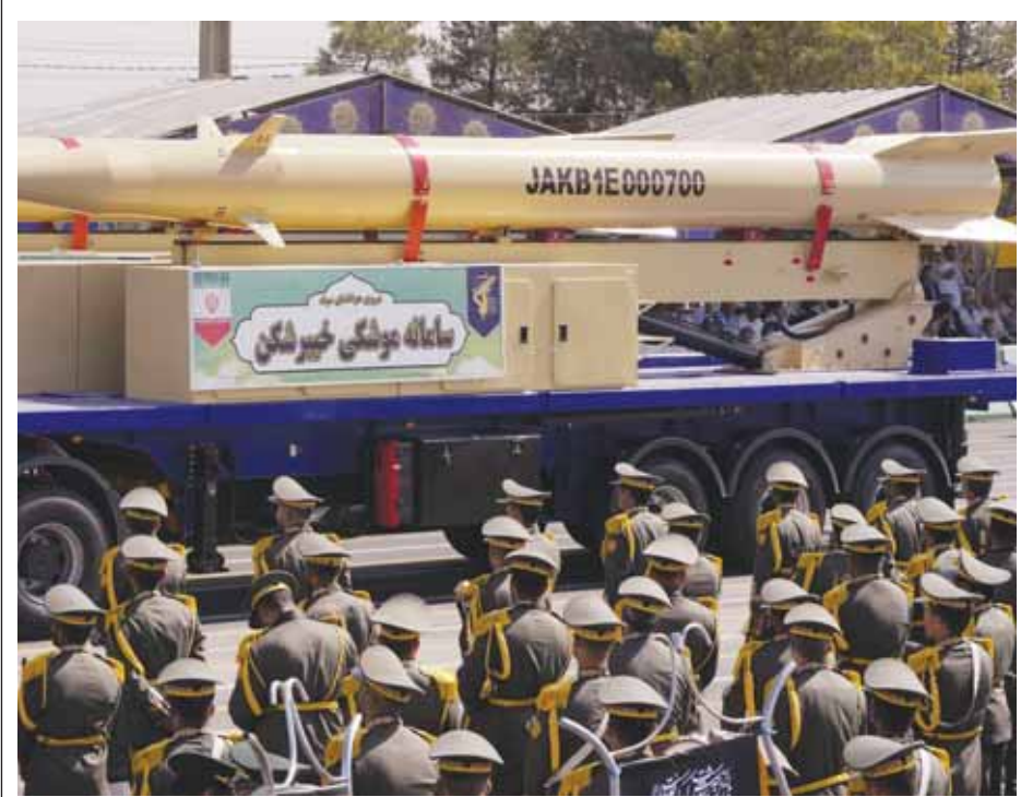
"Khaibar-buster" missiles are carried on a truck during an annual military parade marking anniversary of the beginning of war against Iran by former Iraqi Dictator Saddam Hussein, in front of the shrine of the late revolutionary founder Ayatollah Khomeini, just outside Tehran, Iran, Friday.