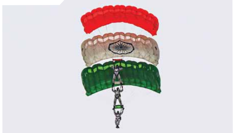
Indian Air Force (IAF) personnel perform during diamond jubilee celebrations of Air Force Station Jammu