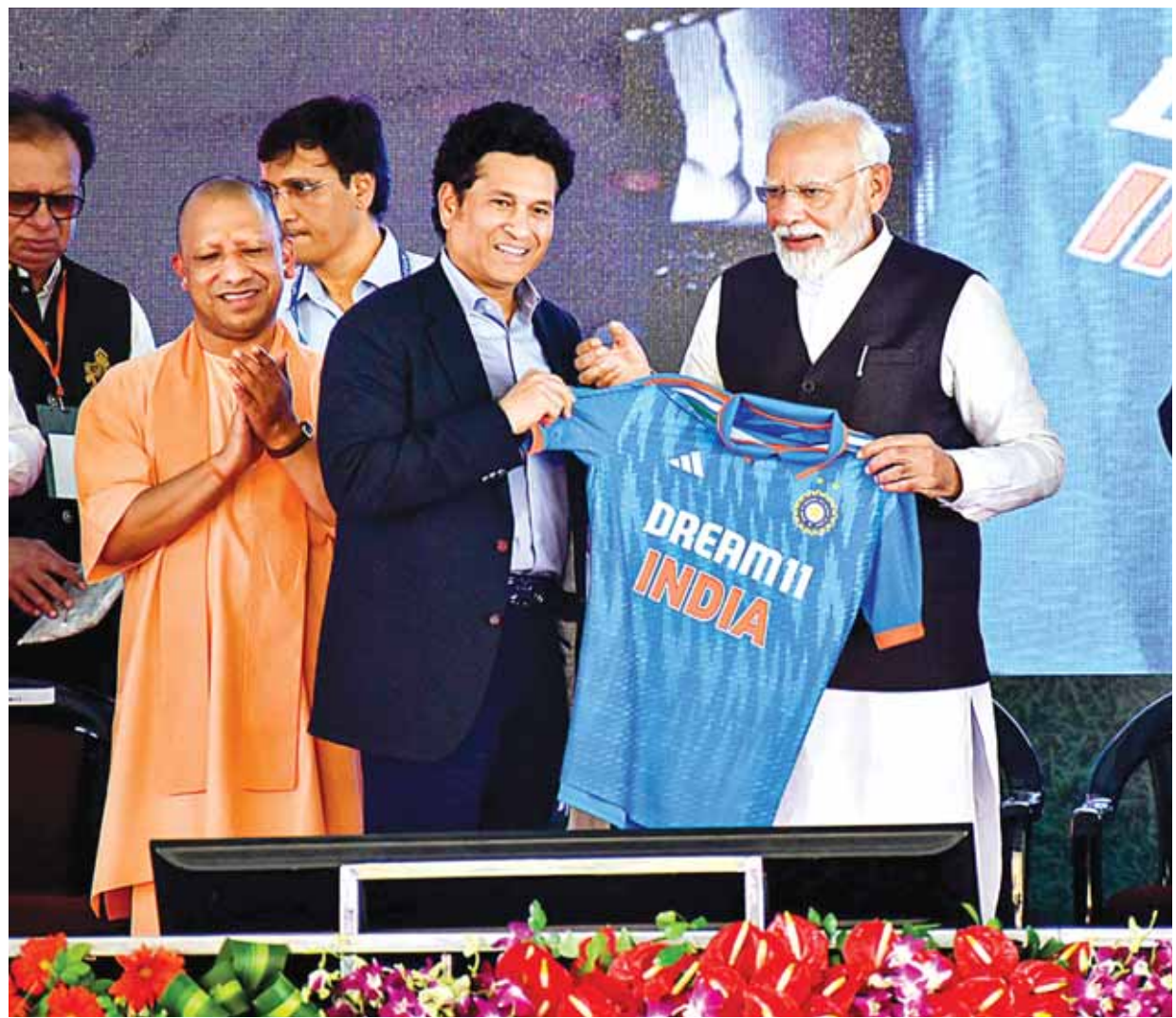
Legendary cricketer Sachin Tendulkar presents a Indian cricket team jersey to Prime Minister Narendra Modi, with Uttar Pradesh Chief Minister Yogi Adityanath looking on, during the foundation stone laying ceremony of an international cricket stadium in Varanasi on Saturday. The Uttar Pradesh Government said that it has spent ₹121 crore to acquire the land for the stadium, while the Board of Control for Cricket in India (BCCI) will spend ₹330 crore on its construction. To be built near the Ring Road in Rajatlab area, the stadium is likely to be ready by December 2025. The spectators' gallery of the stadium would resemble the steps of the ghats of Varanasi. This will be Uttar Pradesh's third international cricket stadium after Kanpur and Lucknow