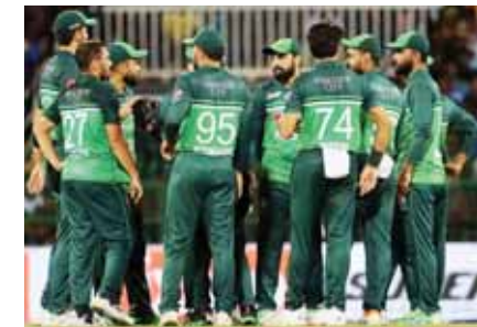
PTI ■ INDORE

Players and team officials of Pakistan's World Cup-bound contingent are yet to get visas for their scheduled travel to India on September 27, two days before their opening warm-up fixture.