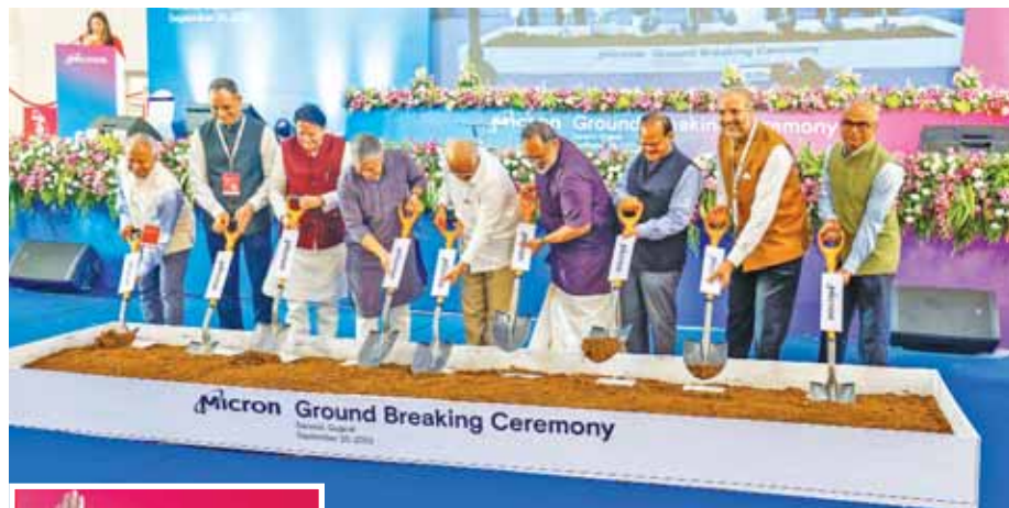
Union Minister for Railways and Electronics & Information Technology Ashwini Vaishnaw, leaders and officials from Micron Technology and Tata Project during a 'Ground Breaking Ceremony' at Micron Technology, in Sanand, Gujarat. (Insert) Vaishnaw addresses during the 'Ground Breaking Ceremony'

He said that there are some specific areas where India can take the lead and the focus of the semiconductor projects will be