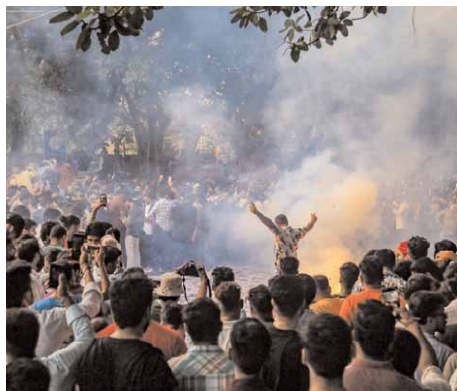
ABVP supporters celebrate after victory in the DUSU election in New Delhi on Saturday

A long queue was witnessed outside the Apple Store in BKC and also in New Delhi's Saket. One of the customer stated that he stood up for more than 8 hours to become the first person to buy iPhone 15 in India outside the BKC store.