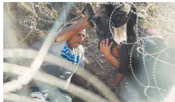
Migrants who crossed the Rio Grande from Mexico to the US work their way through concertina wire on Friday in Eagle Pass, Texas

Bárceña told a news conference in New York Friday that migrant shelters in Ciudad Juarez, across from El Paso, Texas, are 95 per cent full and that the Mexican government is 'very worried' about the border closures and the migrant surge, especially given Mexico's rocky relationship with Texas