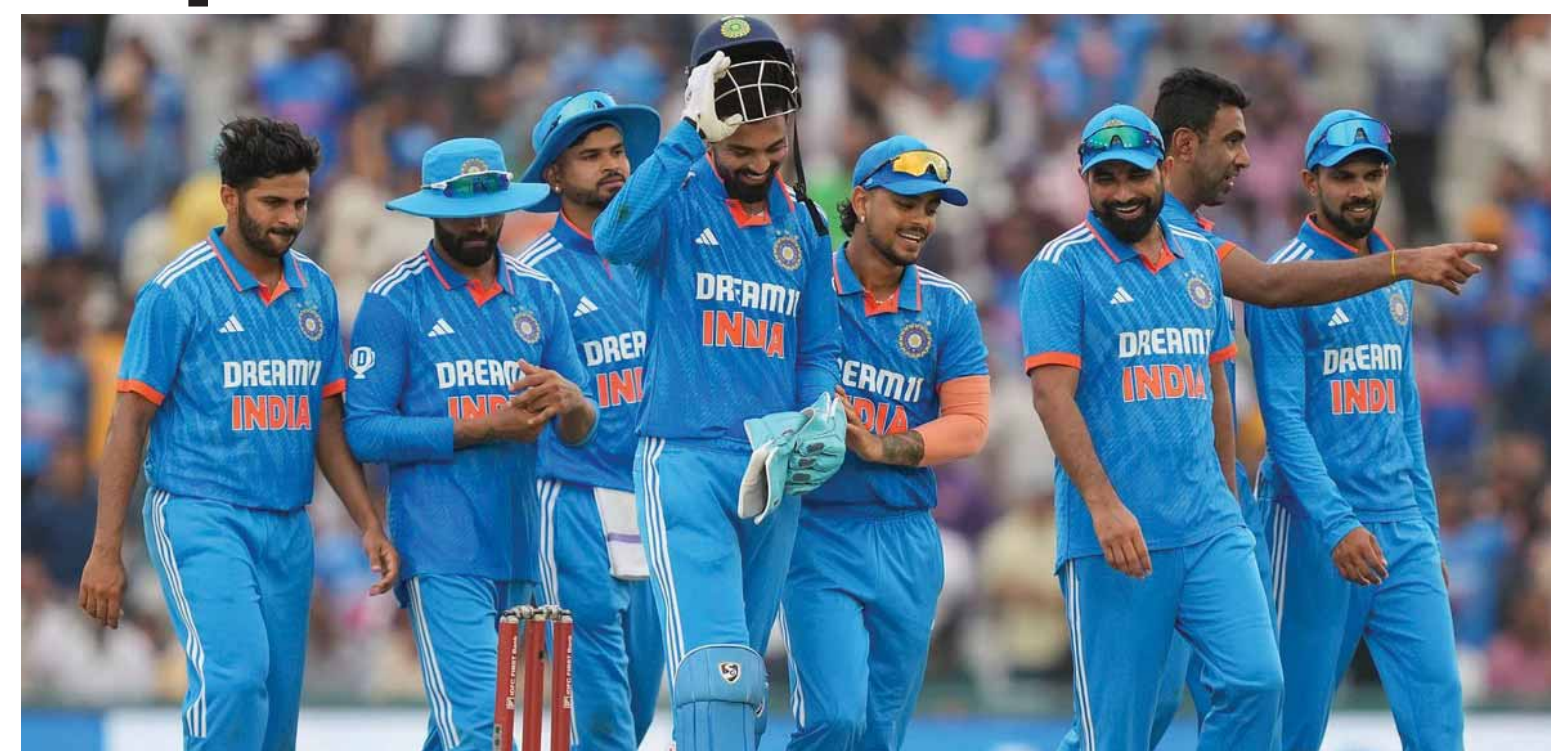
PTI ■ INDORE

Shreyas Iyer will be desperate for some runs after missing out on a flat track while the skillful R Ashwin will be searching for wickets in the middle overs when India take on Australia in the second ODI here on Sunday.