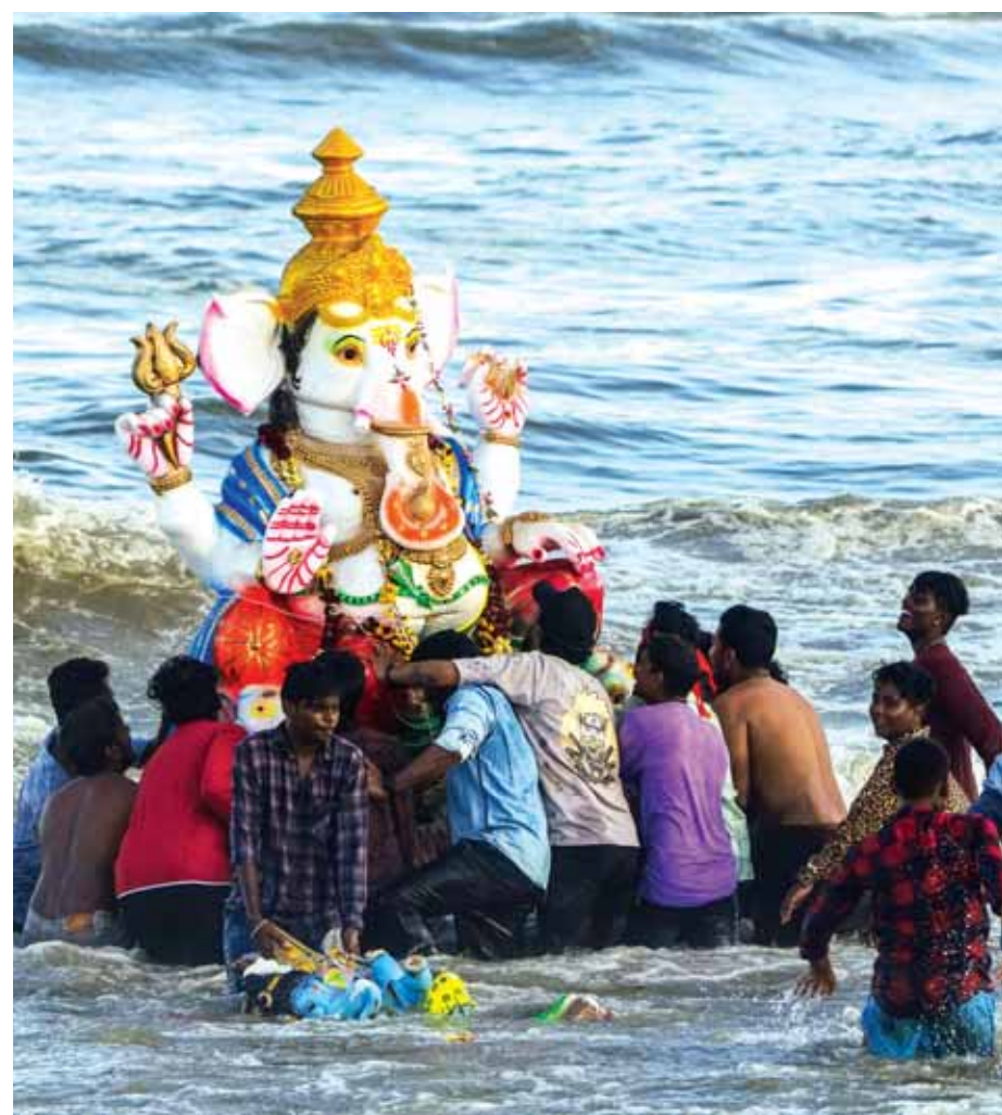
Devotees immerse a Lord Ganesha idol at the Pattinapakkam beach during Ganesh festival in Chennai