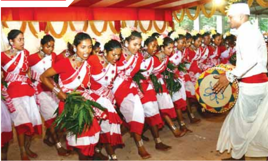
Tribal youth perform a cultural programme on the eve of Karma, a harvest festival, in Ranchi