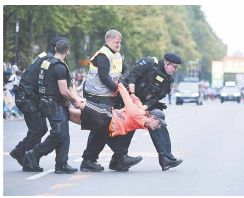
An activist from the climate protection group "Last Generation" is carried away by police officers during a protest prior to the start of the Berlin marathon, in Berlin, Sunday.

Serbia's parliamentary speaker Vladimir Orlic said Kurti "was quick to blame the Serbs," adding that Kurti was the one who wanted an "escalation."