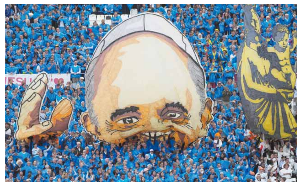
A giant image of Pope Francis is lifted as Pope Francis arrives at the "Velodrome Stadium", in Marseille, France, to celebrate mass, Saturday. Francis, during a two-day visit, will join Catholic bishops from the Mediterranean region on discussions that will largely focus on migration.

their top elected official or foreign minister to the summit. But the administration was "very disappointed" that Solomon Islands Prime Minister Manasseh Sogavare, who was in New York last week for the UN General Assembly, opted not to stick around for the White House summit, according to an administration official. The Solomon Islands last year signed a security pact with China. Prime Minister Melteke Sato Kilman of Vanuatu also is expected to miss the summit. He was elected by lawmakers earlier this month to replace Ishmael Kalsakau, who lost a no-confidence vote in parliament. Biden earlier this year had to cut short a planned visit to the Indo-Pacific, scrapping what was to be a historic stop in Papua New Guinea, as well as a visit to Australia for a gathering with fellow leaders of the so-called Quad partnership so he could focus on debt limit talks in Washington. He would have been the first sitting US president to visit Papua New Guinea. The US president is set to honour Australian Prime Minister Anthony Albanese with a state visit next month.