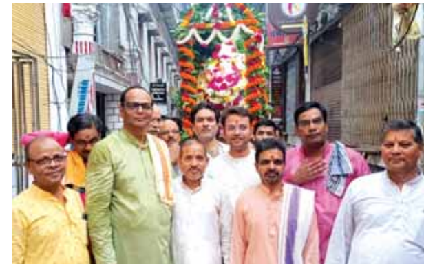
Nutan Mandal members taking our procession of Lord Ganesh's idol on last day of festival in Varanasi on Sunday.

The 115th week-long Ganeshotsav celebrated under the auspices of Nutan Balak Ganeshotsav Samaj Seva Mandal ended with the 'aarti' amidst the chanting of mantras here on Sunday. Respecting the High Court's decision not to immerse the idols in Ganga river and in view of the Supreme Court's orders not to immerse idols in ponds, a resolution was taken to keep the festival idol safe in view of conducting regular worship of the same. Before this a procession of Lord Ganesh was taken out in a 'palki' (palanquin) accompanied by musical instruments, which started from Ganesh Bhawan and reached Panchganga Ghat via Dudhvinayak, Phatak Rangiladas, Thatheri Bazar, Sudia, Bulanala, Golghar, Bhairavnath, Jatanbar, Bibhatiya, Rajmandir, Brahmaghat and Durga Ghat. The students were walking on the route singing the traditional verse 'Nutan Balak