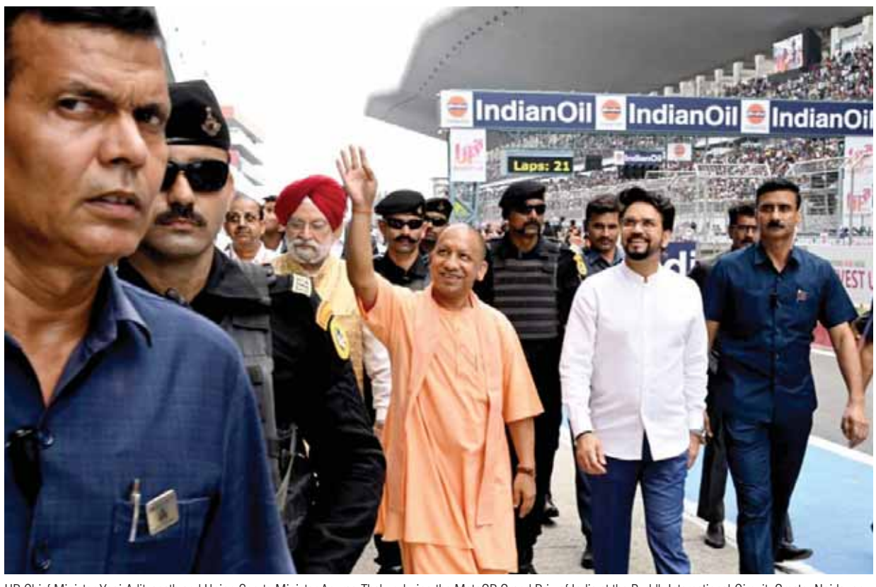
UP Chief Minister Yogi Adityanath and Union Sports Minister Anurag Thakur during the MotoGP Grand Prix of India at the Buddh International Circuit, Greater Noida, on Sunday

tunities buoyed by the visionary support of the ruling party at the Centre. The Chief Minister said the UP Government is working with the Centre to develop sports facilities like stadiums and mini-stadiums in every district of the State. "There are 58,000 gram panchayats in the State and open gyms are being developed where women and youngsters feel encouraged to pursue sporting avenues and our administration is encouraging every single talent," the Chief Minister said to a huge round of applause from the large gathering in at the Grand Prix venue Buddh International Circuit. The Chief Minister was in the Gautam Budh Nagar district on Sunday to inaugurate the MotoGP event in Greater Noida. This marked his second visit to the area in less than a week, the previous one being when he accompanied President Draupadi Murmu to the trade fair. In the run up to the 2024 Lok Sabha polls and to counter the competition from the Opposition bloc INDIA, the BJP Government in the State is giving an impetus to the infrastructure growth across the State. Yogi heading the most populous State with 80 Lok Sabha seats is a key BJP leader in securing the prospects of the party in the Parliamentary polls next year. Yogi, dubbed as "bulldozer baba" has meticulously pro-