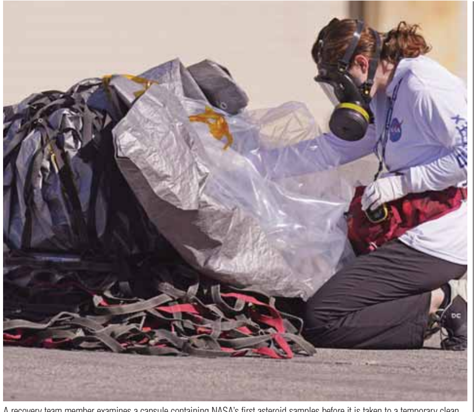
A recovery team member examines a capsule containing NASA's first asteroid samples before it is taken to a temporary clean room at Dugway Proving Ground in Utah on Sunday, September 24. The Osiris-Rex spacecraft released the capsule following a seven-year journey to asteroid Bennu and back