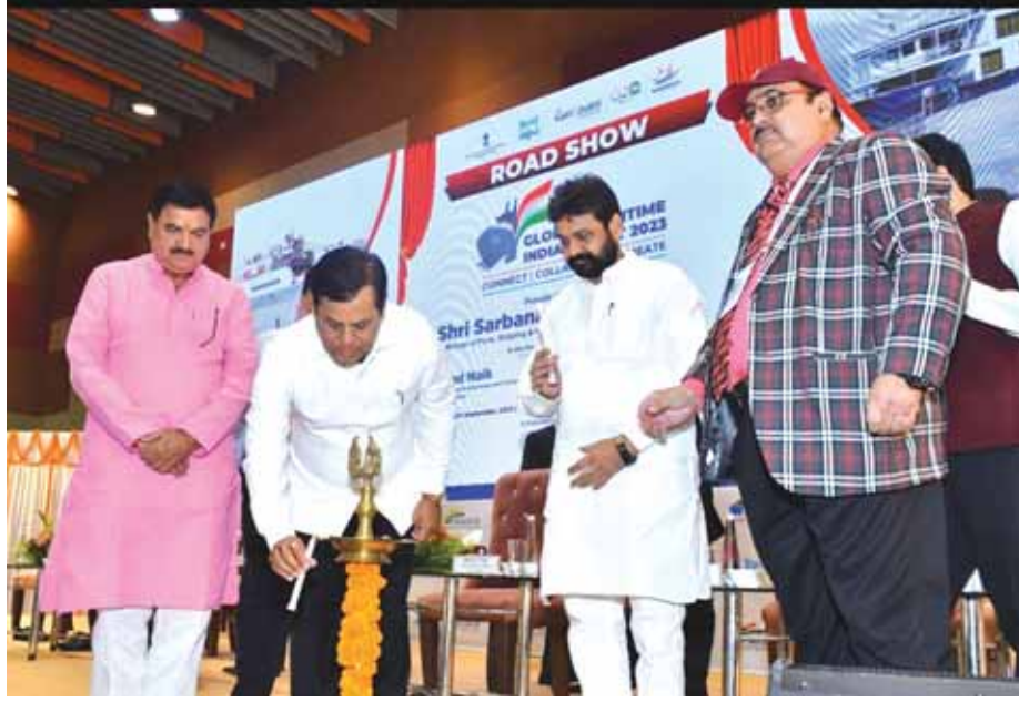
Union Minister of Ports, Shipping and Waterways and AYUSH Sarbananda Sonowal inaugurating an event at TFC in Varanasi on Monday.

Speaking on occasion, Sonowal announced plans to construct a world-class cruise terminal in Varanasi for expansion of river cruise tourism via waterways in the city. He further alluded to facilitation of the movement of goods to and from Nepal via waterways. "In the heart of Varanasi, the cradle of our civilisation, we embarked on a transformative journey to shape India's destiny. Under the dynamic and visionary leadership of Prime Minister Narendra Modi, India is poised to become the third largest economy in the world. Waterways and logistics are the bedrock of our economic growth, and the GMIS-2023 is the catalyst for partnership and realising the shared vision of generating investment of ₹10 lakh crore and creating more than 15 lakh employment avenues for the youth of this nation," said the Union Minister. He elaborated on the government's commitment to create a sustainable and modern ecosystem by stating, "the Jal Marg Vikas Project and Arth Ganga initiative are tangible testaments to our dedication. Our multi-modal terminals, innovative Ganga river transport and modernisation of 60 community jetties are bolstering industries and preserving our cultural heritage. We're fostering regional cooperation