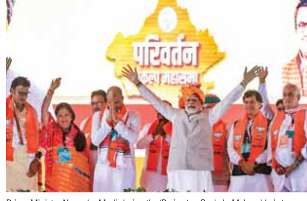
Prime Minister Narendra Modi during the 'Parivartan Sankalp Mahasabha' at Dadiya village in Jaipur on Monday

PTI ■ JAIPUR The Ashok Gehlot Government in Rajasthan has wasted five important years of the State's youth, Prime Minister Narendra Modi said on Monday as he called upon the people to oust the Congress from power. Addressing a BJP rally here, the prime minister said the Congress deserved zero marks for the government it ran in Rajasthan for the last five years. He accused the Congress dispensation of patronising the mafia leasing recruitment exam question papers and said when the BJP forms government, strictest action will be taken against the mafia. The "Parivartan Sankalp Mahasabha" marked the culmination of four 'Parivartan Yatras' that the Bharatiya Janata Party (BJP) took out in the poll-bound state. Assembly elections in Rajasthan are due later this year. Addressing the well-attended rally, Prime Minister