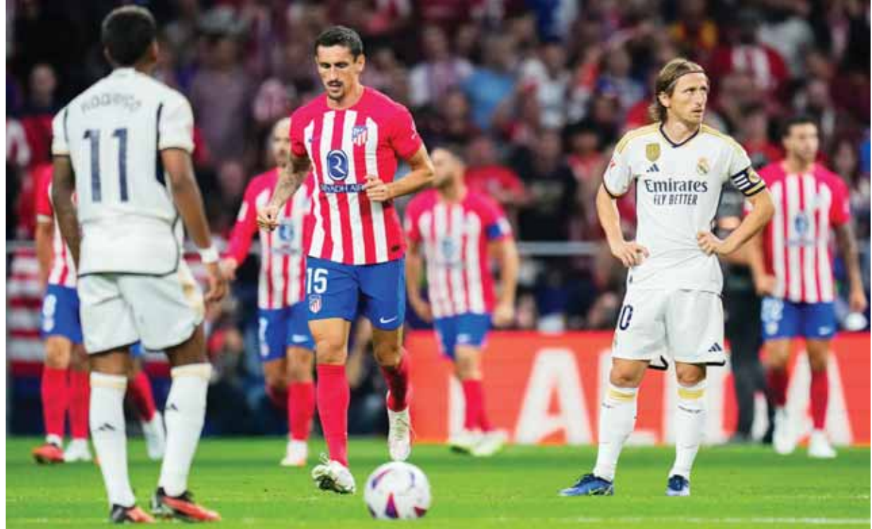
Morata led the line well for Atletico and was rewarded with two goals, which he celebrated wildly.

"It was a problem of defensive fragility, which we haven't had in the first few games," Real Madrid coach Carlo Ancelotti told reporters. "In just over 45 minutes they put three past us, it was not a good night ... the team was not compact, above all in the first half, Atletico took advantage of that."