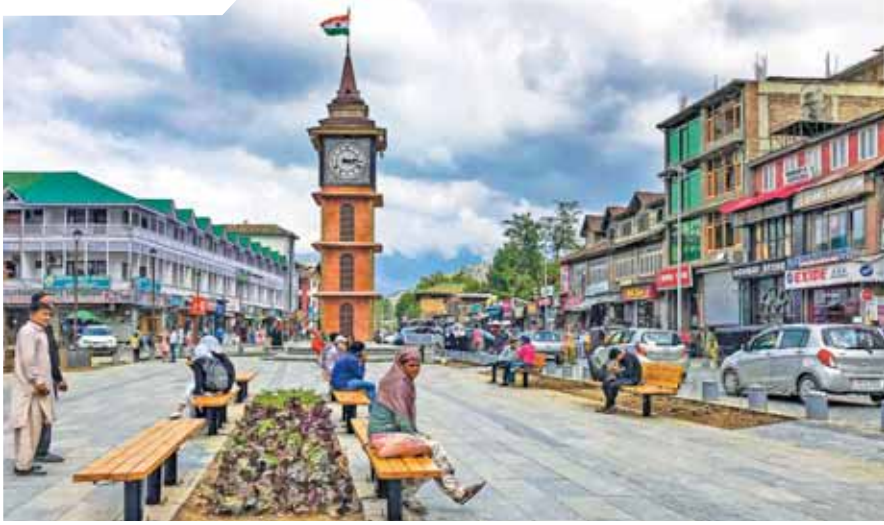
Tourists and locals at Ghanta Ghar on a cloudy day, in Srinagar