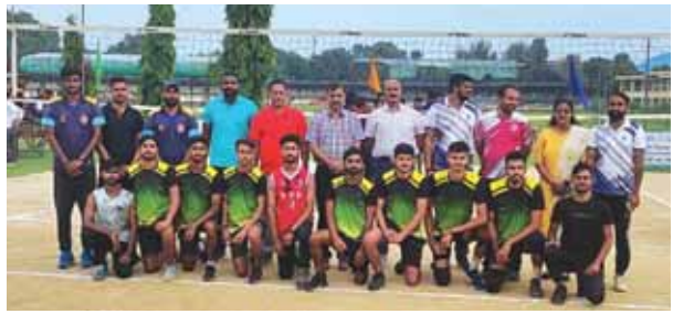
The team of Commerce Faculty which won the Inter-Faculty Volleyball Championship (Men) 2023-24 organised by the USB, BHU.

The Commerce Faculty won the Inter-Faculty Volleyball Championship (Men) 2023-24 defeating Arts Faculty in the final match played on Monday. The championship was organised by the University Sports Board (USB), Banaras Hindu University BHU) on varsity sports ground here. The final match of the Inter-Faculty Volleyball Championship (Men) 2023-24 was played between Arts Faculty and Commerce Faculty and the latter won the final match and championship as well by defeating the former by 25-18, 25-10, 25-14. Earlier the semi-final matches were also played. In the first semi-final, the Arts Faculty became the winner by defeating the Institute of Science in four sets 25-21, 25-23, 22-25, 25-18. In the second semi-final match, the Commerce Faculty became