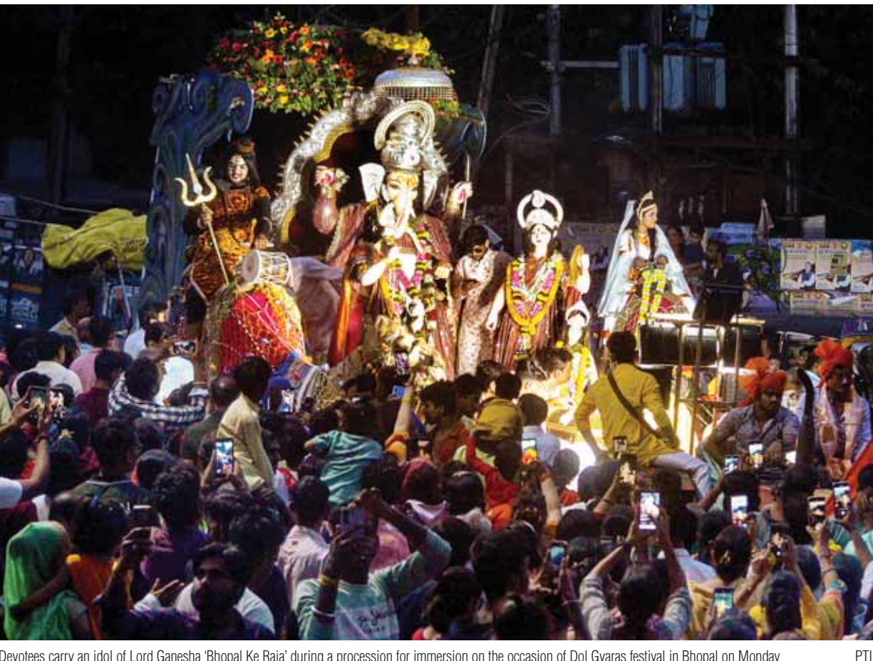
Devotees carry an idol of Lord Ganesha 'Bhopal Ke Raja' during a procession for immersion on the occasion of Dol Gyaras festival in Bhopal on Monday

Earlier, Modi was welcomed by the BJP Mahila Morcha cadre at the venue. Modi reached the meeting venue in Dadiya village in Vatika on the outskirts of Jaipur from a nearby helipad in an open-top vehicle escorted by activists of the BJP's women wing who raised slogans in his support. Earlier, kickstarting Madhya Pradesh poll campaign, Prime Minister Narendra Modi on Monday said the Congress and its allies in the new 'ghamandiya' alliance "reluctantly" supported the Women's Reservation Bill in Parliament and warned people that if given an opportunity, they will backtrack on the historic legislation. Addressing a massive gathering of BJP workers, 'Karyakarta Mahakumbh', here, the PM tore into the Congress, equating the national party with "rusted iron" and alleging its functioning has been outsourced to "urban Naxals" and that the organisation is not run by leaders.