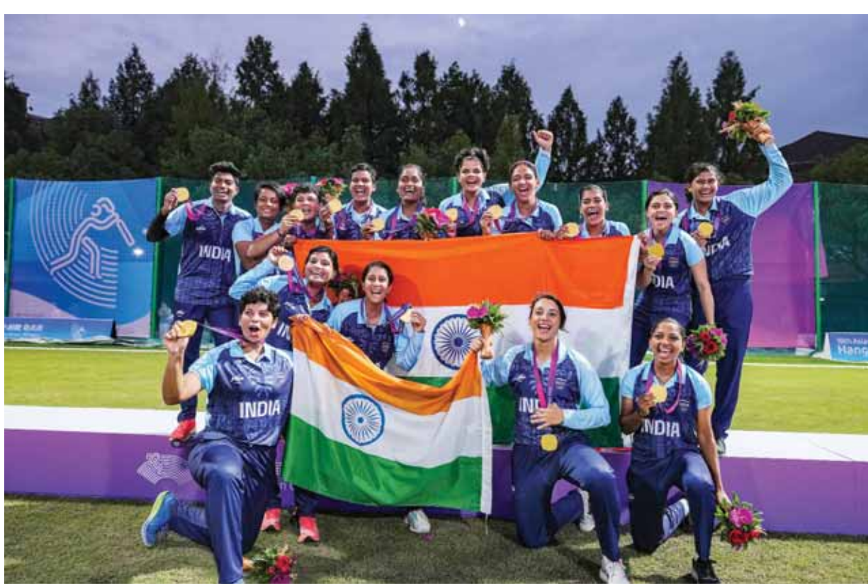
Indian players pose for photos after winning the gold medal in the women's cricket event at the 19th Asian Games in Hangzhou in China on Monday