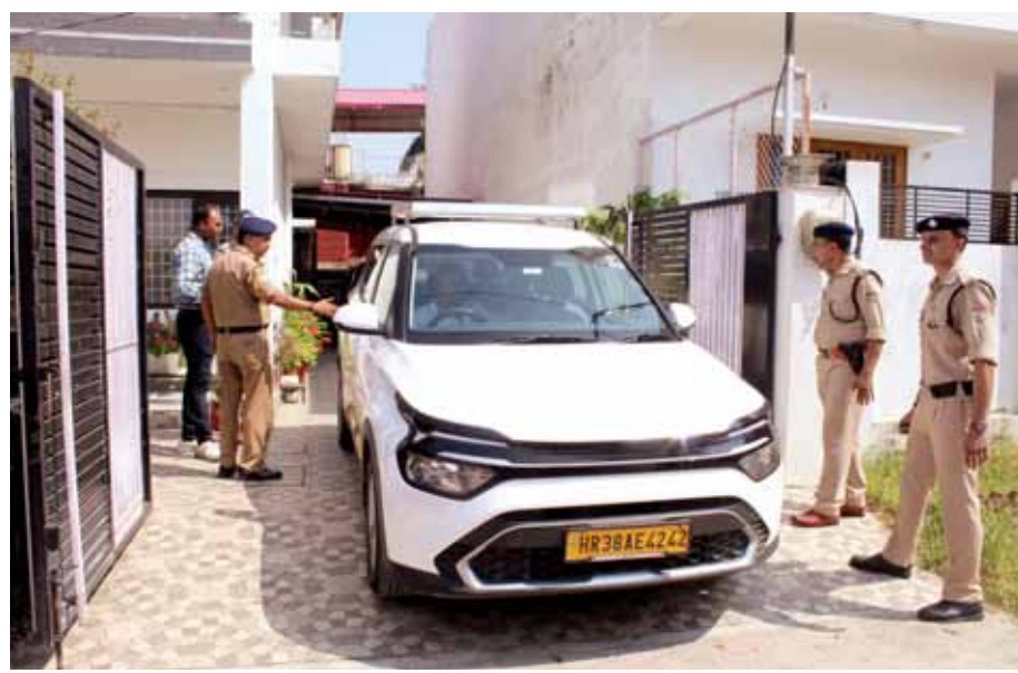
Police personnel outside a residential premises during a raid by National Investigation Agency in Dehradun on Wednesday

es were the seventh in the series of such crackdowns launched by NIA following the registration of five cases since August 2022, including the two new cases registered against Organised Criminal Gangs in July 2023. The cases relate to conspiracies of targeted killings, terror funding of pro-Khalistan outfits and extortion by the gangsters, many of whom are lodged in various jails or are operating from various foreign countries, including Canada, Pakistan, Malaysia, Portugal and Australia and the United States among others, officials said.