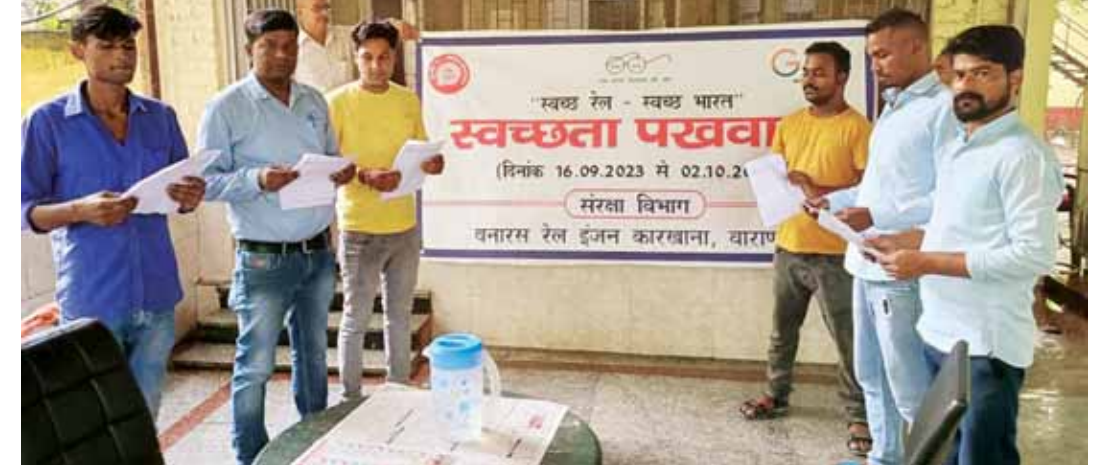
Employees taking a pledge for clean food, water at BLW in Varanasi on Wednesday.