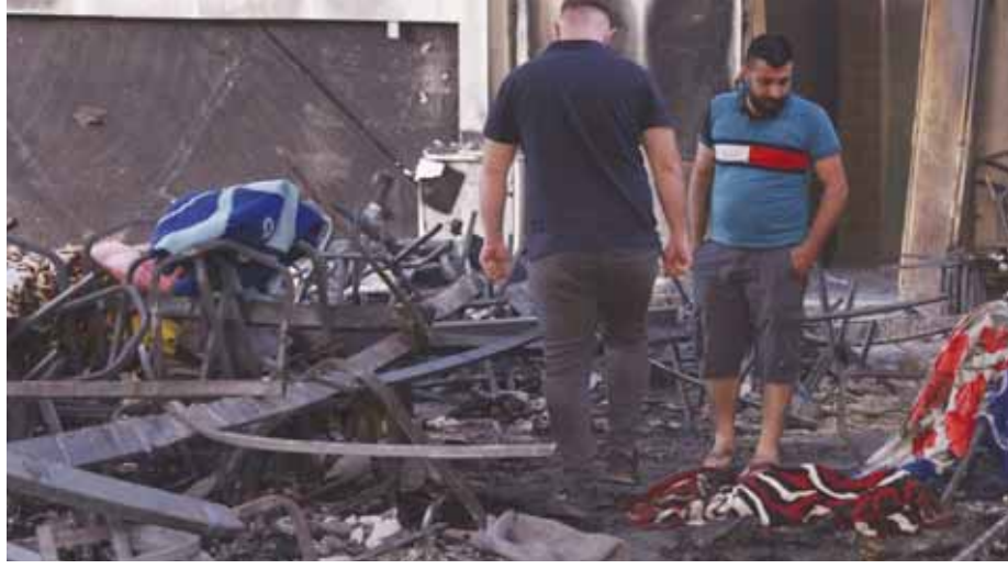
People gather at the site of a fatal fire, in the district of Hamdaniya, Nineveh province, Iraq on Wednesday. A fire that raced through a hall hosting a Christian wedding in northern Iraq killed multiple people, authorities said Wednesday.

The fire happened in the Hamdaniya area of Iraq's Nineveh province, authorities said. That's a predominantly Christian area just outside of the city of Mosul, some 335 kilometres (205 miles) north-west of Baghdad. There was no official word on the cause of