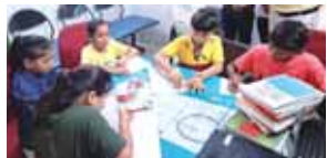
Children taking part in 'Clean Competition' at DRM Office in Varanasi on Friday.