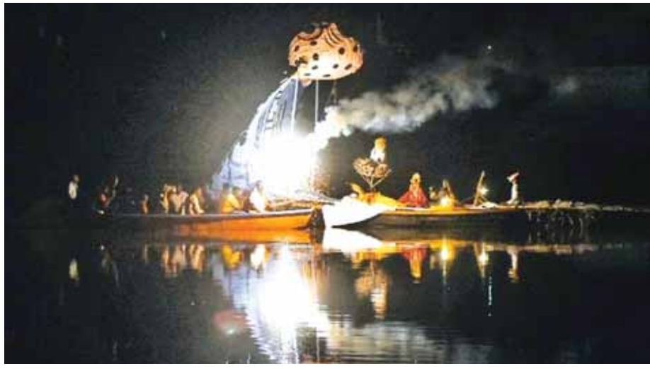
The Ksheer Sagar tableaux near Durga Mandir pond in Ramnagar on the first day of Ramlila in Varanasi on Thursday night.

Ramnagar Ramlila drew global attention since UNESCO proclaimed the tradition of this Ramlila 'a masterpiece of the oral and intangible heritage of humanity' in 2005. Later, the Central government and Indira Gandhi National Centre for the Arts (IGNCA) produced a two-hour documentary entitled 'Ramlila'. Ramnagar Ramlila is still organised under the patronage of the royal family of the Banaras Estate, though funded by the state government since the abolition of Princely Estates. The unique feature of