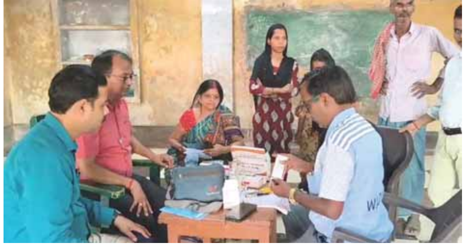
A doctor checking patients at Ramnagar in Varanasi on Thursday.