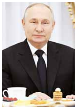
The June 23-24 rebellion aimed to oust the Russian Defense Ministry's leadership that Prigozhin blamed for mishandling the war in Ukraine and trying to place Wagner under its control. His mercenaries took over Russia's southern military headquarters in Rostov-on-Don and then rolled toward Moscow before abruptly halting the mutiny.

Russian President Vladimir Putin has ordered one of the top commanders of the Wagner military contractor to take charge of "volunteer units" fighting in Ukraine, signalling the Kremlin's effort to keep using the mercenaries after the death of their chief, Yevgeny Prigozhin.