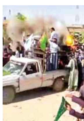
squad from near the blast site, he said.

Later, a hand grenade was also defused by the bomb