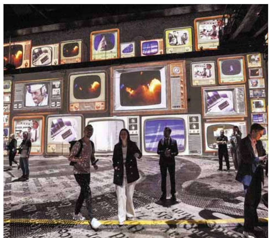
People watch the preview of the new digital exhibition "Destination Cosmos" at the former gas plant Phoenix in Dortmund, Germany, Thursday, Sept. 28, 2023. The multimedia presentation of Phoenix des Lumières art center shows the history of man's desire to explore space from the earliest stargazers to the International Space Station and the exploration of Mars.

Madrid (AP): A new animal welfare law that took effect Friday in Spain outlaws the use of animals for recreational activities that cause them pain and suffering but allows bullfights and hunting with dogs. Spain's first specific animal rights legislation is intended to crack down on abuses. The law particularly targets the mistreatment of domestic animals, introducing fines of up to 200,000 euros ($212,000). It bans the buying of pets in stores or online, but gives stores a grace period to find homes for their animals. In the future, it only will be legal to purchase pets from registered breeders. The new rules allow pets into most establishments, including restaurants and bars. The law bans the use of wild animals at circuses and gives owners six months to comply. It allows zoos to keep using the marine mammals in their dolphin shows until the animals die.