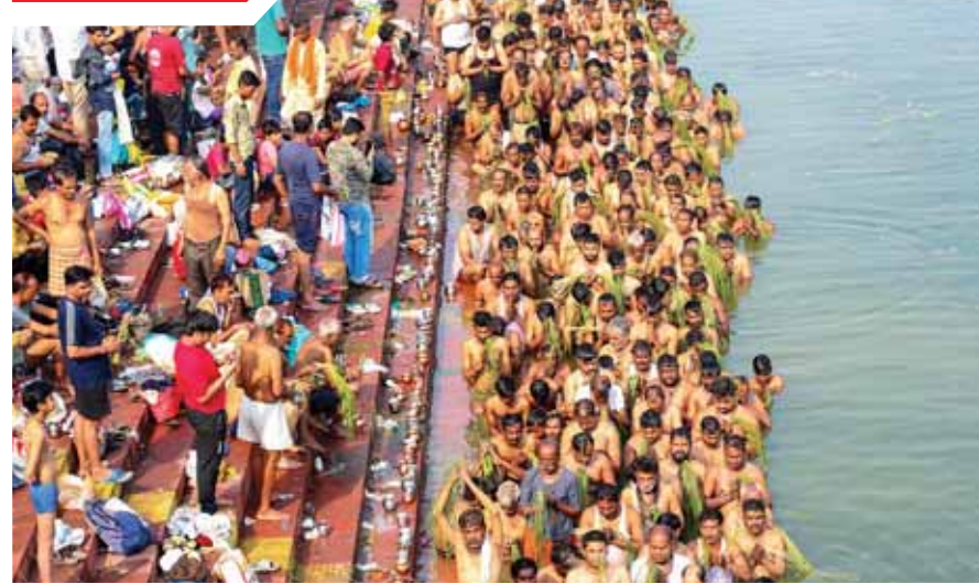
Hindu devotees perform 'Tarpan' ritual for their ancestors on first day of 'Pitra Paksh', in Bhopal