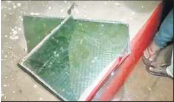
Broken windowpane lying at Khanapur police station in Nirmal district after BJP activists attacked the police station on Friday night

The activists threw stones and broke the windowpanes in the police station. At one point,