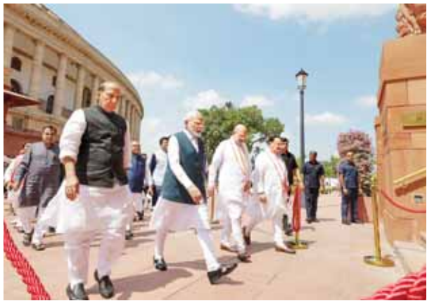
Prime Minister Narendra Modi, with Union Ministers Amit Shah and Rajnath Singh and other parliamentarians, enters the new Parliament building, in New Delhi, on Tuesday.

Marking a historical turn in the legislative empowerment of women in the country, the Modi Government also introduced a Constitution