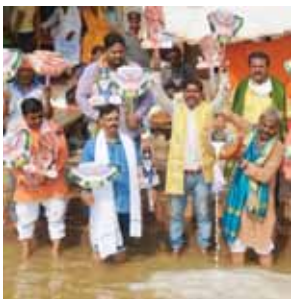
Milk being offered in river Ganga in Varanasi on Tuesday to welcome new Parliament building.

By worshipping Maa Ganga, they prayed to the Almighty for a bright future for the country