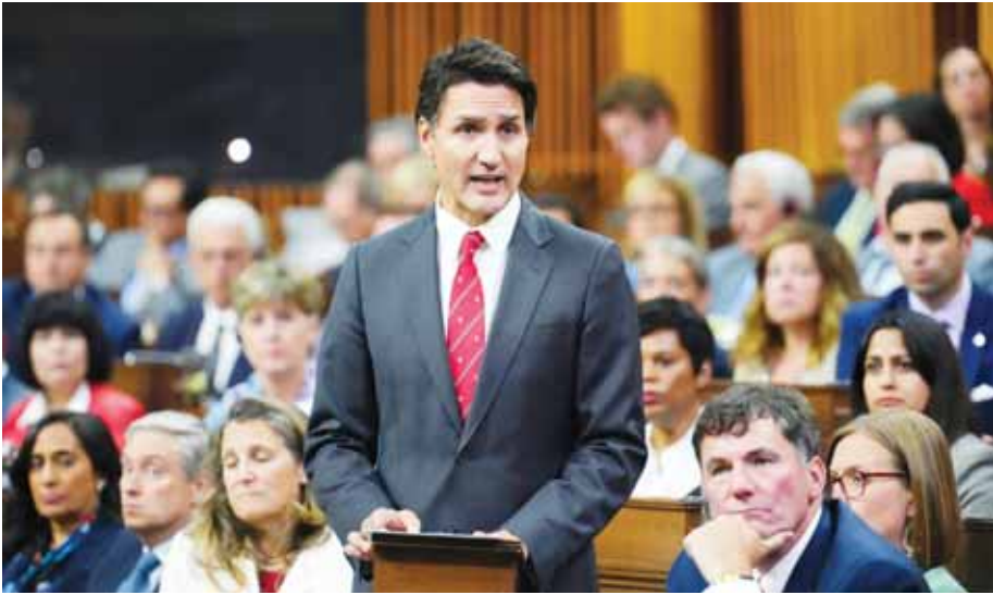
Canada Prime Minister Justin Trudeau delivers a statement in the House of Commons on Parliament Hill in Ottawa.

The Congress backed the Government's action and said the country's interests and concerns must be kept paramount and its fight against terrorism has to be uncompromising. "The Indian National Congress has always believed that our