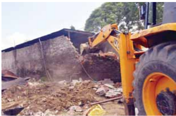
The KDA squad bulldozed illegal construction on its land in Boodhpur Machharia on Monday