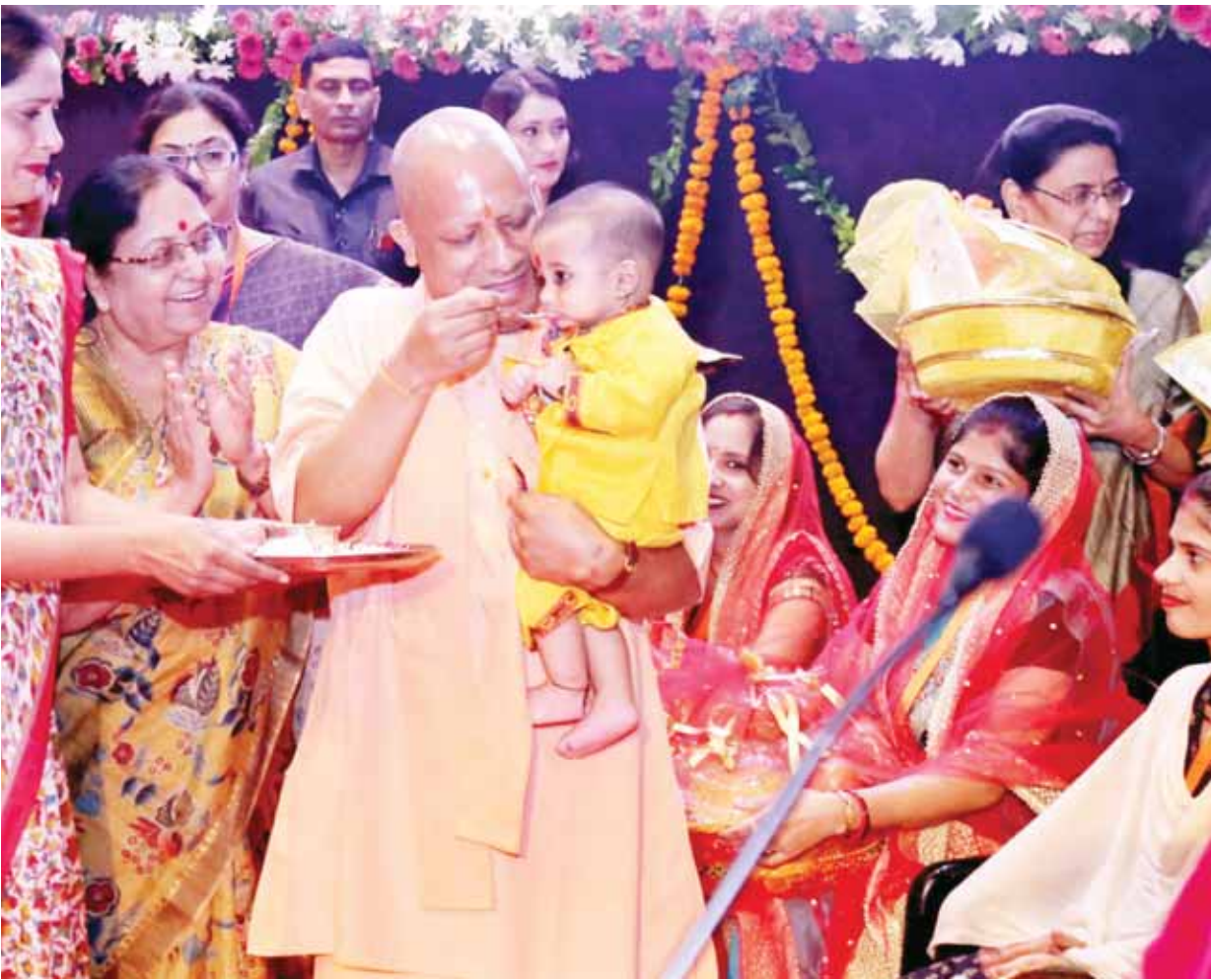
Chief Minister Yogi Adityanath performing Annaprashan Sanskar of a child in Lok Bhawan on Tuesday

During the baby shower ceremony, the chief minister gifted medicines and nutritious food items to some pregnant women. He also per-