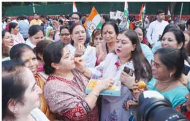
Congress members celebrate the Women's Reservation Bill in New Delhi on Tuesday.

Lok Sabha data shows that women MPs account for nearly 15 per cent of the lower House's strength while their