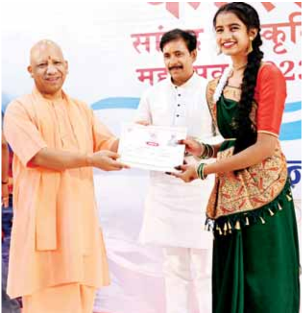
CM Yogi Adityanath distributing a certificate to a participant of KSSM in Varanasi on Monday.