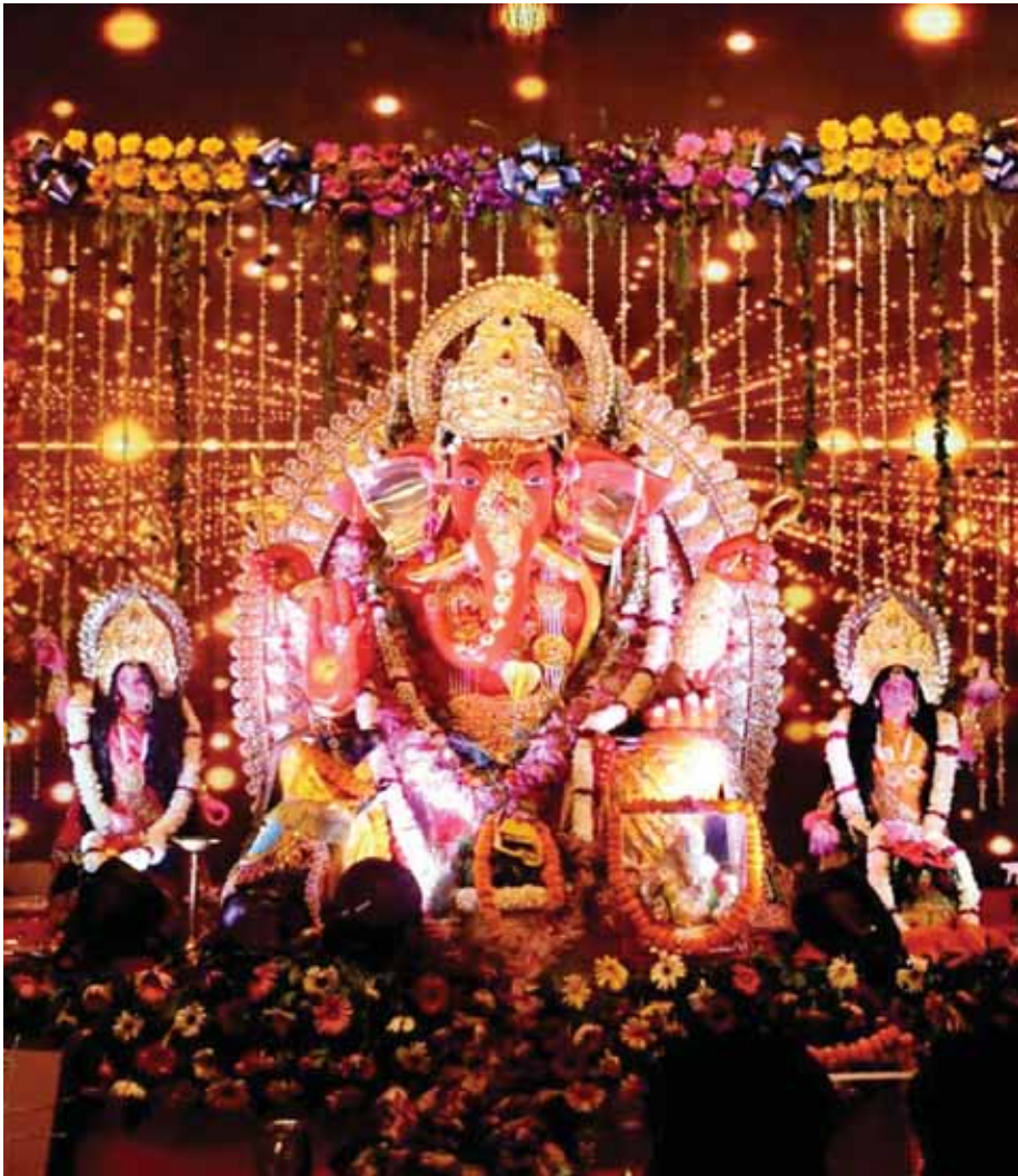
Ganesh idol installed at Jhulelal Park on the occasion of Ganesh Chaturthi in Luknow on Tuesday

The Mayor also asked the tax department to set up tax assessment and collection camps in every ward.