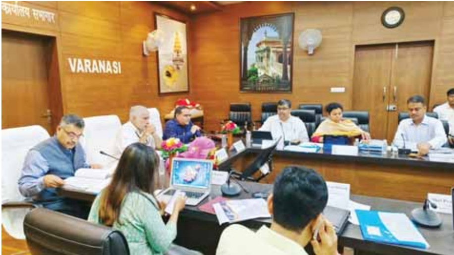
ECI officers holding a meeting with 12 DEOs/DMs on poll preparations in Varanasi on Monday.

They also discussed the preparation of the voter list in the context of the upcoming Lok Sabha elections, 2024. To make the voter list proper, instructions were given to all the 12 DEOs regarding registering the names of eligible voters in the voter list, removing the names of dead voters from the voter list and improving elector population (EP) and gender