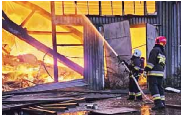
Emergency services work to extinguish a fire after a Russian attack in Lviv, Ukraine, on Tuesday.

Russia launched a massive drone attack on the western city of Lviv early Tuesday, damaging a warehouse facility in a fiery blaze and killing one man, Ukrainian authorities said. Ukraine intercepted 27 of 30 Shaped drones overnight, the Air Force said. But drones that got through air defense systems sparked an inferno at the industrial storage facility that was not used for military purposes, Gov. Maksym Kozzytsky said. An artillery strike in Kherson in the south struck a bus, killing a police sergeant and wounding two men, said Ihor Klymenko, Ukraine’s minister of internal affairs. That strike also set a warehouse on fire. The developments in the war front came as Ukrainian President Volodymyr Zelenskyy was in New York to address the UN General Assembly and Security Council before going to Washington on Thursday to meet with lawmakers and President Joe Biden. Zelenskyy