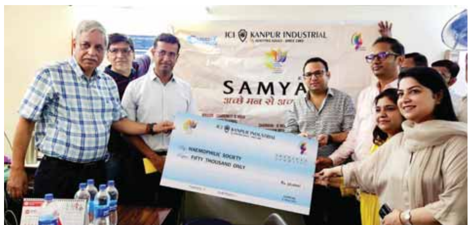
Members of JCI Kanpur Industrial Club extending financial assistance of ₹50,000 to Haemophilia Society.