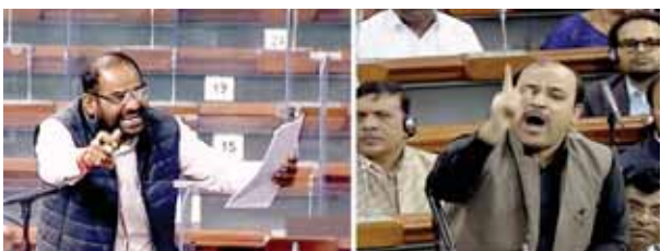
A combo of file images shows BJP MP Ramesh Bidhuri and BSP MP Kunwar Danish Ali during in the Lok Sabha in New Delhi on Friday

"We are truly dismayed by our MP's behaviour, especially considering that this incident occurred on a day when the nation was celebrating the passage of the Women's Bill and the success of Chandrayaan, both of which were being widely reported across the country. Furthermore, it coincided with an unprecedented record of