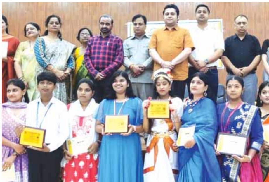
The winners of the national essay writing competition organised by Dr Sujata Verma Smriti Samiti on Friday.