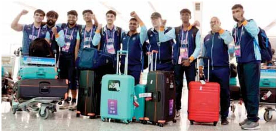
Indian e-Sports team poses for photographs upon their arrival to participate in the 19th Asian Games, in Hangzhou in China on Friday

Termining the act of denial of accreditation as discriminato-