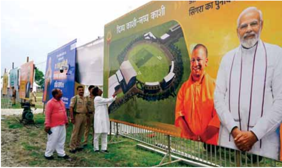
Final touches being given to international cricket stadium site at Ganjari on eve of PM's arrival in Varanasi on Friday.

Mahotsav witnessed the participation of more than 37,000 persons across 17 disciplines, who displayed their skills in singing, instrumental playing, nukkad natak, dancing etc. The meritorious participants will get a chance to showcase their cultural skills during the programme at RICC. Meanwhile after the RICC, now a glimpse of Lord Shiva and Kashi will be seen in the new international cricket stadium being built in Varanasi. PM is coming to Kashi on Saturday to give a gift to the sports lovers of Purvanchal (eastern UP) an international cricket stadium in his parliamentary constituency. The cricket lovers of Purvanchal will no longer have to go far to watch international cricket matches. With the construction of an international cricket stadium at a cost of ₹451 crore, along with watching the matches, the basic infrastructure for international cricketers will also be ready. The cricket legends, Sachin Tendulkar and Sunil Gavaskar, are likely to attend the foundation stone laying ceremony of the stadium. In this project, the Yogi gov-