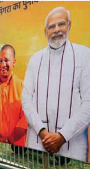
Atal Residential School ready for inauguration at Karsada in Varanasi.

ernment has spent ₹121 crore on land acquisition while the BCCI will spend ₹330 crore to construct the stadium. This stadium will be ready in about 30 months near Ring Road in Ganjari village of Rajatalab area of the district. The double engine government is continuously playing a positive role in the rejuvenation of Kashi. Along with implementing PM's schemes in Kashi, Chief Minister Yogi Adityanath himself has been inspecting from time to time to ensure that all the work is done properly. In the same sequence, as per the intention of the CM to build an international stadium, 30.86 acres of land worth ₹121 crore has been given on lease to Uttar Pradesh Cricket Association (UPCA) for the construction of this stadium. The PM is creating new dimensions of development to change the picture of his parliamentary constituency. The CM is giving concrete shape to development and employment related projects in Kashi. The people of Kashi had never thought that their MP would give such a big gift to Purvanchal in the form of an international cricket sta-