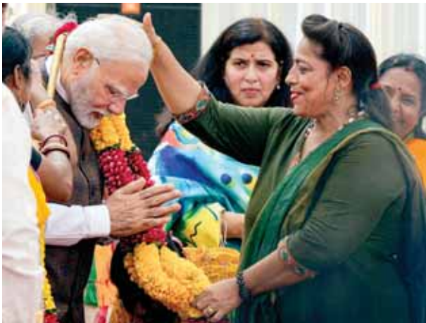
Prime Minister Narendra Modi being felicitated during the 'Nari Shakti Vandan-Abhinandan Karyakram', a day after Parliament passed the Women's Reservation Bill, at the BJP headquarters in New Delhi, on Friday

The inaugural Tirunelveli-Chennai Vande Bharat Express train will leave from Tirunelveli Junction 6 am and reach Chennai around 1:50 pm, while the return journey will begin at