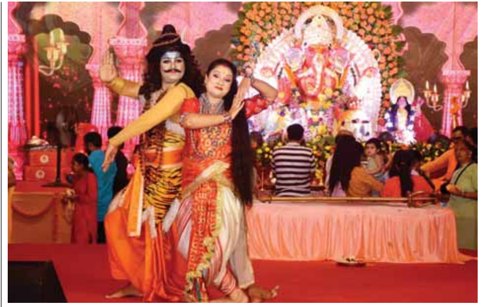
Dancers performing at a Ganesh Utsav Pandal in Lucknow on Monday

The police registered a case in this regard and started investigation. "We have summoned all the security guards, who will be paraded before the complainant and his girlfriend," the police said.