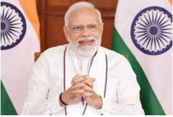
PNS ■ LUCKNOW

Prime Minister Narendra Modi is set to make another visit to his parliamentary constituency, Varanasi, on November 5 where he plans to inaugurate a series of crucial development projects for the people of Kashi.