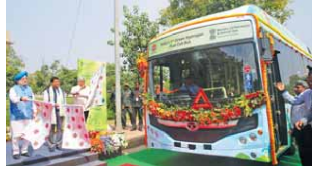
Union Minister for Petroleum & Natural Gas, Housing and Urban Affairs, Hardeep Singh Puri flags off 1st Green Hydrogen Fuel Cell Bus at India Gate in New Delhi on Monday

Puri said by the end of 2023, IOC will scale up the number of buses to 15. IOC will undertake opera-