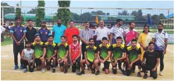
The team of Commerce Faculty which won the Inter-Faculty Volleyball Championship (Men) 2023-24 organised by the USB, BHU.

The final match of the Inter Faculty Volleyball Championship (Men) 2023-24 was played between Arts Faculty and Commerce Faculty and the latter won the final match and championship as well by defeating the former by 25-18, 25-10, 25-14. Earlier the semi-final matches were also played. In the first semi-final, the Arts Faculty became the winner by defeating the Institute of Science in four sets 25-21, 25-23, 22-25, 25-18. In the second semi-final match, the Commerce Faculty became