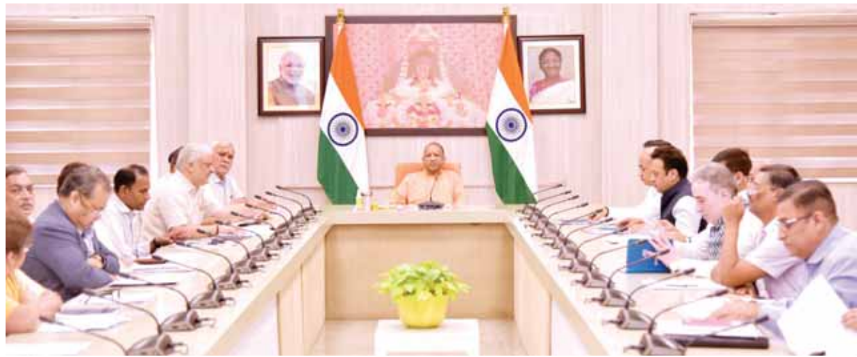
Chief Minister Yogi Adityanath at a review meeting in Lucknow on Monday

Additionally, the chief minister stressed on a comprehensive assessment of necessary positions at all administrative levels, spanning from villages and cities to districts and government departments. He directed the Appointment and