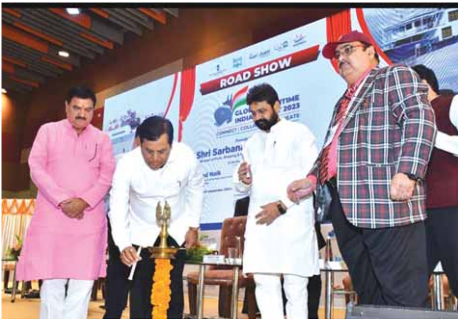
Union Minister of Ports, Shipping and Waterways and AYUSH Sarbananda Sonowal inaugurating an event at TFC in Varanasi on Monday.

Speaking on occasion, Sonowal announced plans to construct a world-class cruise terminal in Varanasi for expansion of river cruise tourism via waterways in the city. He further alluded to facilitation of the movement of goods to and from Nepal via waterways. "In the heart of Varanasi, the cradle of our civilisation, we embarked on a transformative journey to shape India's destiny. Under the dynamic and visionary leadership of Prime Minister Narendra Modi, India is poised to become the third largest economy in the world. Waterways and logistics are the bedrock of our economic growth, and the GMIS-2023 is the catalyst for partnership and realising the shared vision of generating investment of ₹10 lakh crore and creating more than 15 lakh employment avenues for the youth of this nation," said the Union Minister. He elaborated on the government's commitment to create a sustainable and modern ecosystem by stating, "The Jal Marg Vikas Project and Arth Ganga initiative are tangible testaments to our dedication. Our multi-modal terminals, innovative Ganga river transport and modernisation of 60 community jetties are bolstering industries and preserving our cultural heritage. We're fostering regional cooperation