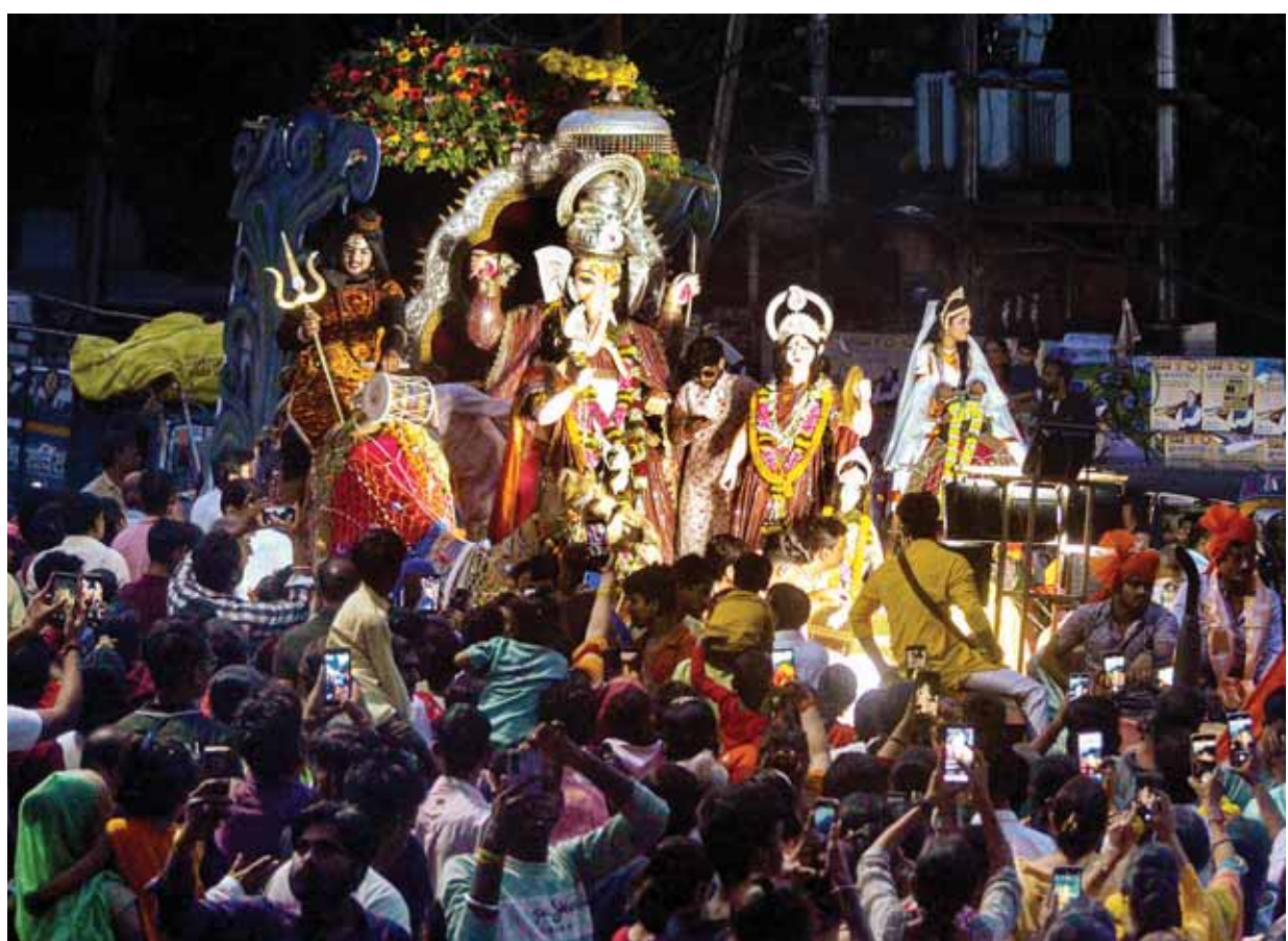
Devotees carry an idol of Lord Ganesha 'Bhopal Ke Raja' during a procession for immersion on the occasion of Dol Gyaras festival in Bhopal on Monday

Addressing a massive gathering of BJP workers, "Karyakarta Mahakumbh", here, the PM tore into the Congress, equating the national party with "rusted iron" and alleging its functioning has been outsourced to "urban Naxals" and that the organisation is not run by leaders.