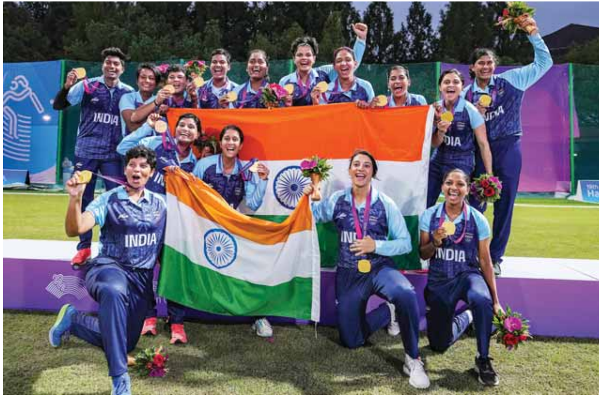
Indian players pose for photos after winning the gold medal in the women's cricket event at the 19th Asian Games in Hangzhou in China on Monday

"It was a great opportunity we got this time, and the fact that we were able to grab that