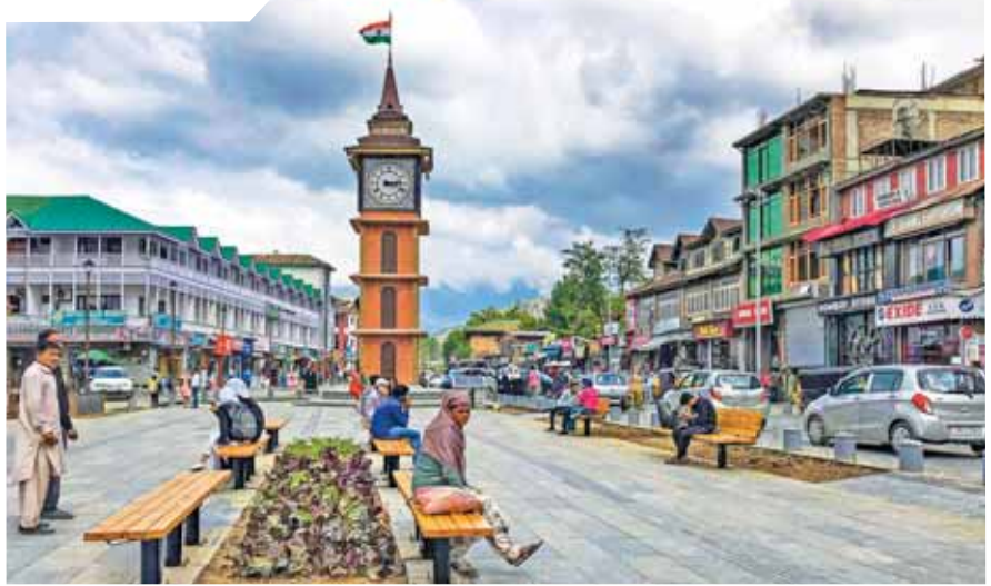
Tourists and locals at Ghanta Ghar on a cloudy day, in Srinagar