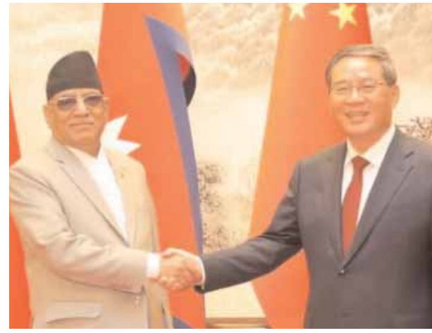
the eastern Chinese city.

The two sides exchanged views on the ways to further strengthen and consolidate the mutual understanding and cooperation and give a new impetus in the front of economy, trade and people-to-people contacts, it said, two days after Chinese President Xi Jinping held talks with Prachanda in Hangzhou on the sidelines of the Asian Games being held in