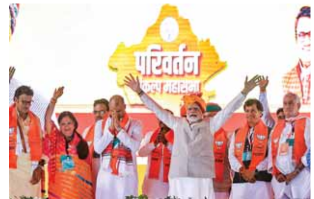
Prime Minister Narendra Modi during the 'Parivartan Sankalp Mahasabha' at the Dadiya village in Jaipur on Monday

Addressing the well-attended rally, Prime Minister