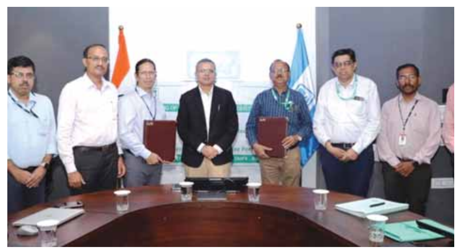
A memorandum of understanding was signed between NTPC Green Energy Limited (NGEL) and Syama Prasad Mookerjee Port

NTPC is India's largest power utility having a total installed capacity of 73+ GW. Its wholly owned subsidiary