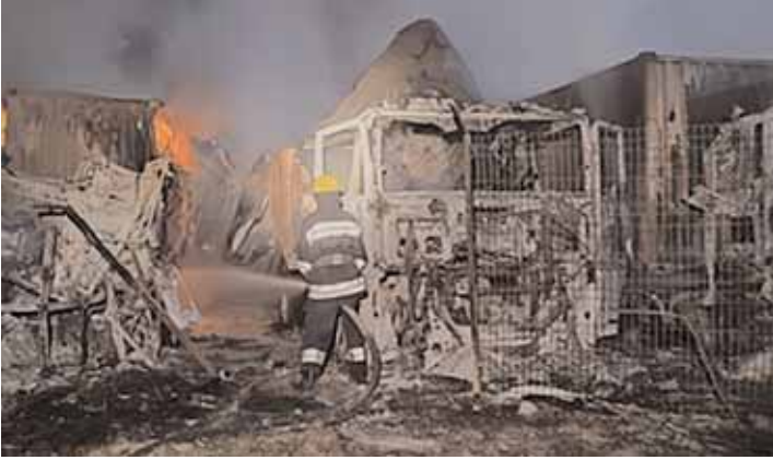
In this photo provided by the Odesa Region Administration, firefighters work to extinguish a fire in port infrastructure after a Russian rocket attack in Izmail, Ukraine, on Tuesday

Russian forces targeted the area of Izmail in the Odesa region, in what has become a sustained campaign to target Ukraine's ability to export grain. Attacks on Monday killed two people in a grain warehouse in Odesa and badly damaged an abandoned high-rise hotel, officials said. After Moscow pulled out of a UN-brokered grain deal this summer, the strikes on Izmail and cities located in the southern part of the Odesa region became routine. Attacks on the cities on the Danube have been especially damaging because the route has emerged as the most promising for continued Ukrainian exports. At least nine civilians were killed in Ukraine and 15 people were injured over the past