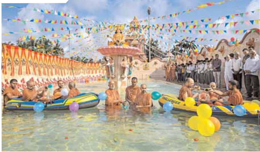
Saints Of Swaminarayan Gurukul pray to Lord Swaminarayan on the 'Jal Jilani Ekadashi', in Surat