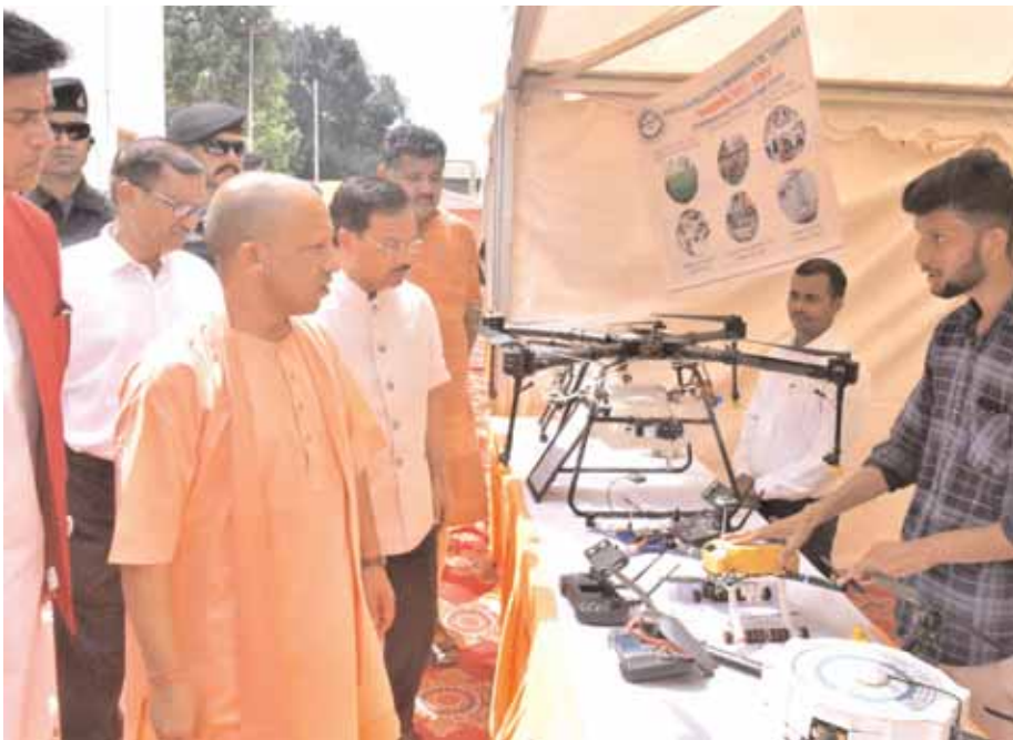
Chief Minister Yogi Adityanath going around an exhibition at Madan Mohan Malviya Technological University in Gorakhpur on Tuesday

“Prior to 2017, Uttar Pradesh was at number 14 in ease of doing business, but significant improvements were made through the introduction of the Nivesh Mitra single-window portal. In addition, the