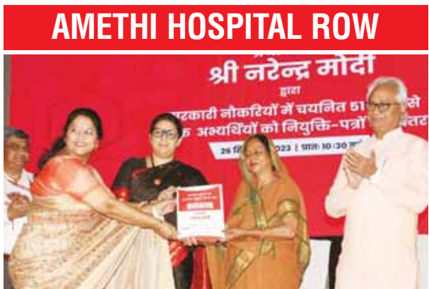
Union minister Smriti Irani giving appointment letters to candidates at a job fair at Indira Gandhi Pratishthan in Lucknow on Tuesday

“More than 400 employees and doctors work in the hospital. Due to the closure of the hospital, all of them became unemployed and everyone was