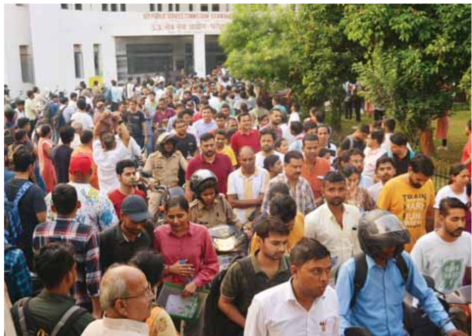
Aspirants coming out of Lok Seva Aayog in Aliganj after appearing for UP PCS (Main) examination on Tuesday