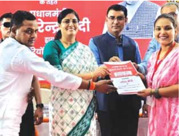
Union Minister Anupriya Patel giving away an appointment letter to a candidate in Varanasi on Tuesday.

Anupriya handed over appointment letters to the newly-appointed candidates and wished them a happy future. During the ceremony in Varanasi, appointment letters were given to 213 candidates, out of which a total of 49 are women candidates who were selected for various posts like