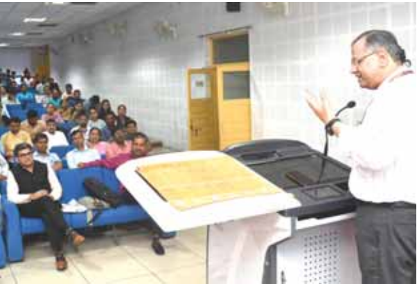
A speaker expressing his views in a session of day-long workshop organised by the Intellectual Property Rights and Technology Transfer (IPRTT) Cell of BHU.