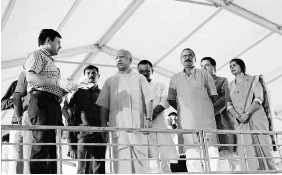
CM Yogi Adityanath inspecting PM's public meeting site at Ganjari in Varanasi on Monday evening.

He also took detailed information from the children regarding the arrangements for their accommodation, food, education etc. The CM blessed the children to study diligently and progress in life with all their might. He also instructed the officers present on the spot and the school principal to provide a high level education system to the children as per the intention of the govern-