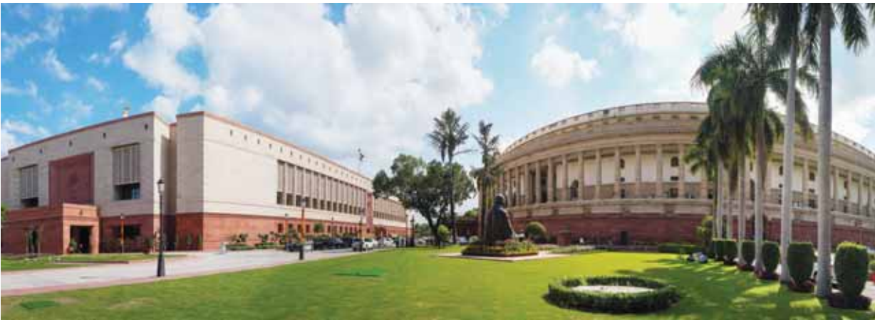
Old and new Parliament Houses in New Delhi on Monday