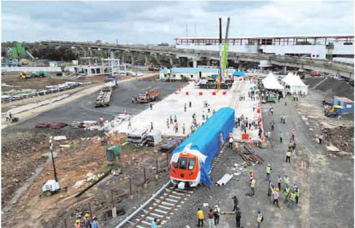
A coach of Bhopal Metro unloaded at Subhash Nagar depot ahead of its trial run, in Bhopal on Monday.