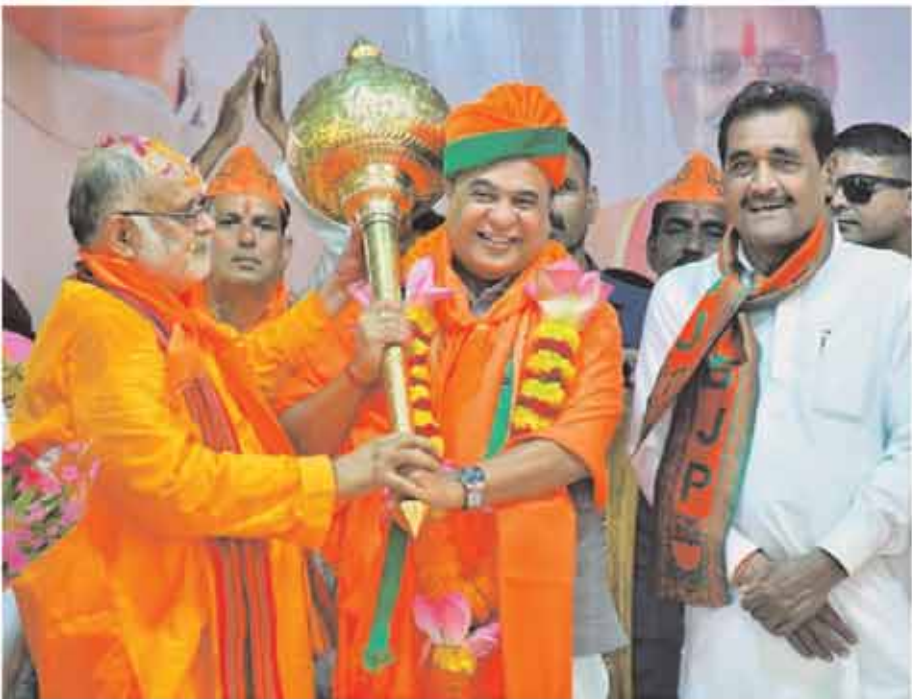
Assam Chief Minister Himanta Biswa Sarma during BJP's Jan Ashirwad Yatra in Sironj, Vidisha district Madhya Pradesh on Monday.