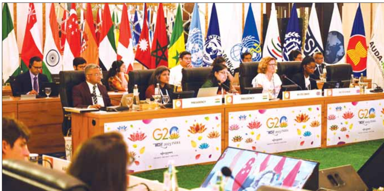
A glimpse from the two-day fourth and final meeting of the G20 Framework Working Group under the Indian Presidency, which began in Nava Raipur, Chhattisgarh, on Monday.

Meanwhile, the Chief Minister flagged off the first batch of products ready for the market from the factory.