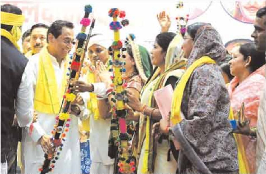
Madhya Pradesh State Congress President Kamal Nath during a programme to mark the martyrdom day of Tribal leaders Raja Shankar Shah and Raghunath Shah in Bhopal on Monday.