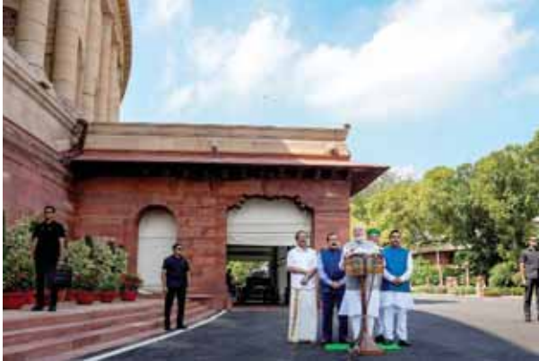
Prime Minister Narendra Modi addresses the media on the first day of the Special Session of Parliament in New Delhi. Union Ministers V Muraleedharan, Pralhad Joshi and Arjun Ram Meghwal are also seen

Modi is known to spring surprises at the last minute and is also adept in holding government business on sensitive