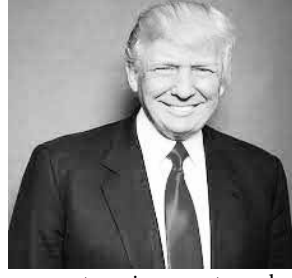
momentum in recent weeks, Trump is far ahead of his GOP rivals and political pundits believe that he is on his way to becoming the party's nominee.

A new poll by the Washington Post and ABC News has shown President Joe Biden trailing behind his predecessor Donald Trump in a hypothetical November 2024 match. "Trump edges out Biden 51-42 in head-to-head matchup," the poll said. Trump is way ahead of his other Republican rivals in the party's presidential race. The GOP's formal nomination process will begin with the Iowa Caucus and the New Hampshire Primary in January.