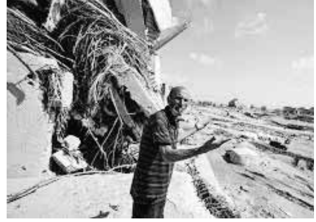
according to search teams.

Government officials and aid agencies have given estimated death tolls ranging from more than 4,000 to over 11,000. The bodies of many of the people killed still are under rubble or in the Mediterranean,