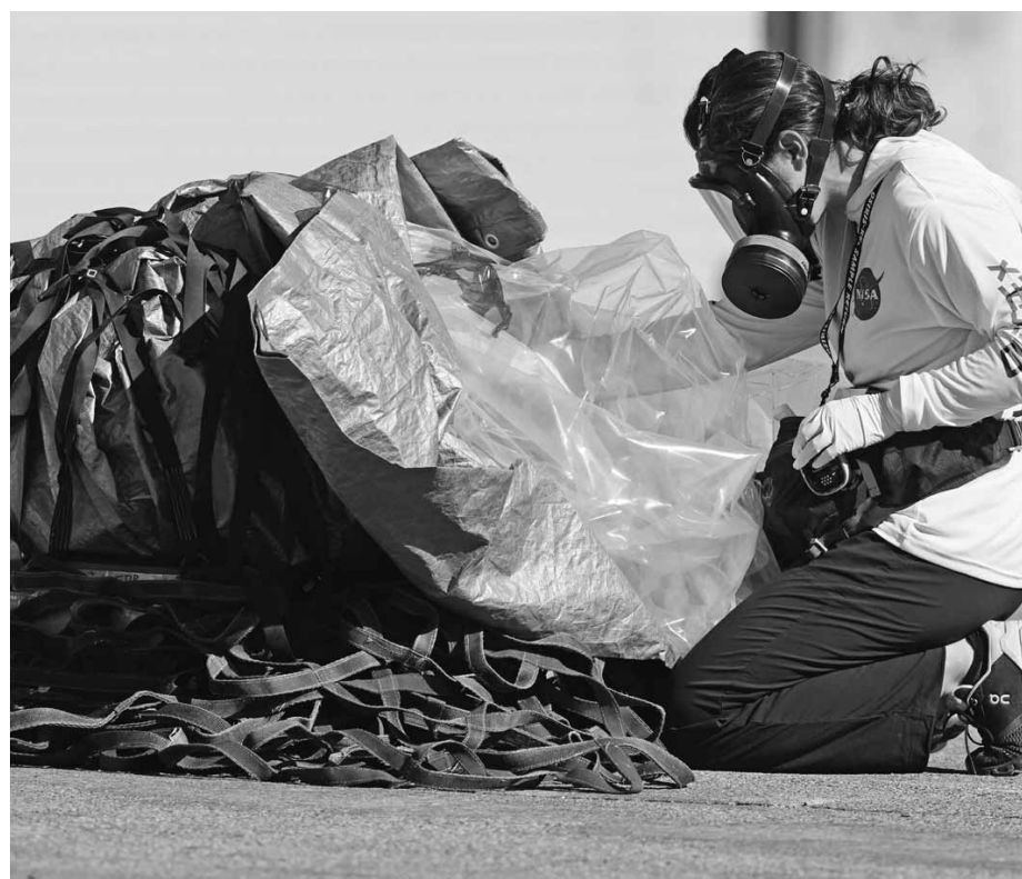
A recovery team member examines a capsule containing NASA's first asteroid samples before it is taken to a temporary clean room at Dugway Proving Ground in Utah on Sunday, September 24. The Osiris-Rex spacecraft released the capsule following a seven-year journey to asteroid Bennu and back

The Russian Defence Ministry said its air defences downed three Ukrainian drones over the Kursk region of Russia and three others over the Bryansk region early Monday. It also reported that three drones were shot down over the Belgorod region. Kursk Gov Roman Starovoit said a downed drone over the centre of the city of Kursk damaged the roof of an administrative building and several private houses and shattered windows in an apartment building. Starovoit said there were no injuries. A day earlier, a Ukrainian drone damaged the roof of an administrative building in Kursk that some Ukrainian and Russian media reported housed the offices of the Federal Security Service, Russia's main domestic security agency.