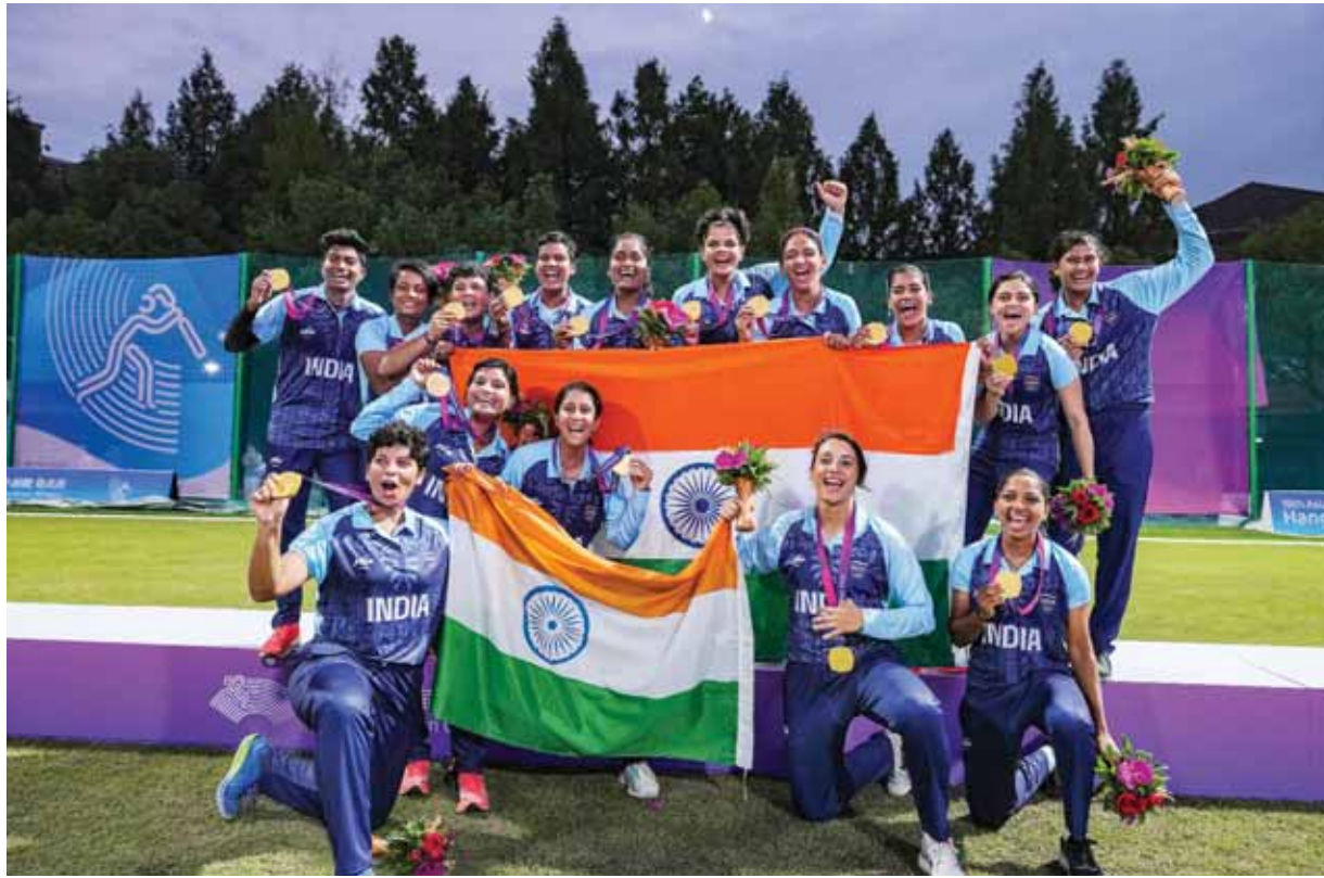
Indian players pose for photos after winning the gold medal in the women's cricket event at the 19th Asian Games in Hangzhou in China on Monday

"It was a great opportunity we got this time, and the fact that we were able to grab that