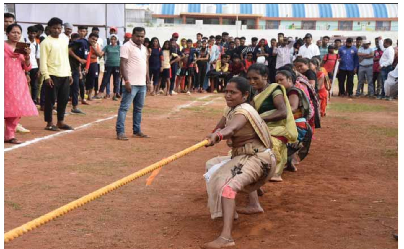
State level tournaments of Chhattisgarhia Olympics on Monday commenced at four of the sports grounds in Raipur. The event will conclude on September 27.