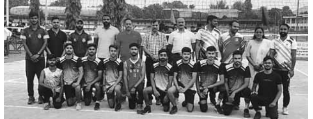
The team of Commerce Faculty which won the Inter-Faculty Volleyball Championship (Men) 2023-24 organised by the USB, BHU.

The Commerce Faculty won the Inter-Faculty Volleyball Championship (Men) 2023-24 defeating Arts Faculty in the final match played on Monday. The championship was organised by the University Sports Board (USB), Banaras Hindu University (BHU) on varsity sports ground here. The final match of the Inter-Faculty Volleyball Championship (Men) 2023-24 was played between Arts Faculty and Commerce Faculty and the latter won the final match and championship as well by defeating the former by 25-18, 25-10, 25-14. Earlier the semi-final matches were also played. In the first semi-final, the Arts Faculty became the winner by defeating the Institute of Science in four sets 25-21, 25-23, 22-25, 25-18. In the second semi-final match, the Commerce Faculty became