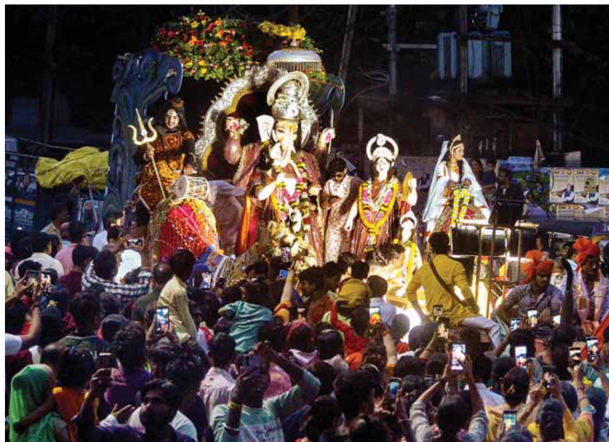
Devotees carry an idol of Lord Ganesha 'Bhopal Ke Raja' during a procession for immersion on the occasion of Dol Gyaras festival in Bhopal on Monday

Gandhi also targeted Prime Minister Narendra Modi on Awaz Yojana, saying the Centre had failed to provide funds despite repeated reminders from the Chhattisgarh government.