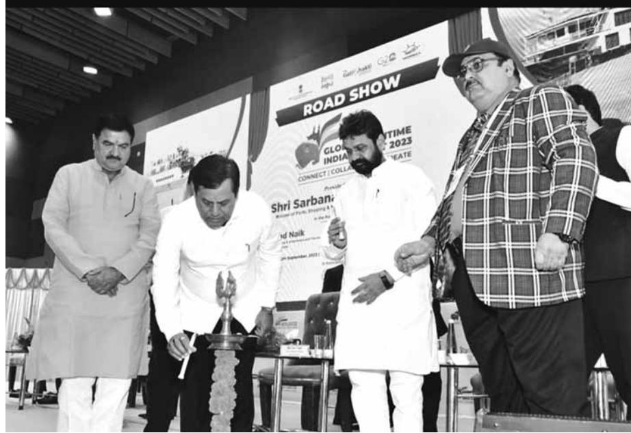
Union Minister of Ports, Shipping and Waterways and AYUSH Sarbananda Sonowal inaugurating an event at TFC in Varanasi on Monday.

Speaking on occasion, Sonowal announced plans to construct a world-class cruise terminal in Varanasi for expansion of river cruise tourism via waterways in the city. He further alluded to facilitation of the movement of goods to and from Nepal via waterways. "In the heart of Varanasi, the cradle of our civilisation, we embarked on a transformative journey to shape India's destiny. Under the dynamic and visionary leadership of Prime Minister Narendra Modi, India is poised to become the third largest economy in the world. Waterways and logistics are the bedrock of our economic growth, and the GMIS-2023 is the catalyst for partnership and realising the shared vision of generating investment of ₹10 lakh crore and creating more than 15 lakh employment avenues for the youth of this nation," said the Union Minister. He elaborated on the government's commitment to create a sustainable and modern ecosystem by stating, "the Jal Marg Vikas Project and Arth Ganga initiative are tangible testaments to our dedication. Our multi-modal terminals, innovative Ganga river transport and modernisation of 60 community jetties are bolstering industries and preserving our cultural heritage. We're fostering regional cooperation