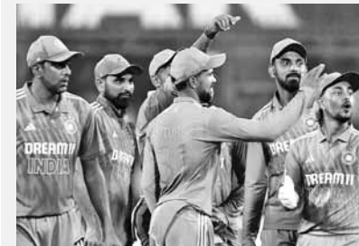
India secured a resounding 5-star victory. Three batsmen — Gill, Shreyas, and SKY (Surya Kumar Yadav) — along with two bowlers — Ashwin and Jadeja — crushed Australia by a convincing 99-run margin.

Earlier, centuries for Gill (his 6th in ODIs, 9th in international matches) and Shreyas Iyer (his 3rd in ODIs, 4th in international matches) provided a solid foundation for India. Bowlers Jadeja (3 for 42), Ashwin (3 for 41), and P. Krishna (2 for 56) spun their magic, clinching the 2nd ODI match and securing the series for India. SKY (Surya Kumar Yadav) played a pivotal role with four sixes in an over and a whirlwind 72* (37 balls), propelling India to an imposing total of 399 runs (for 5 in 50 overs) and securing a substantial victory.