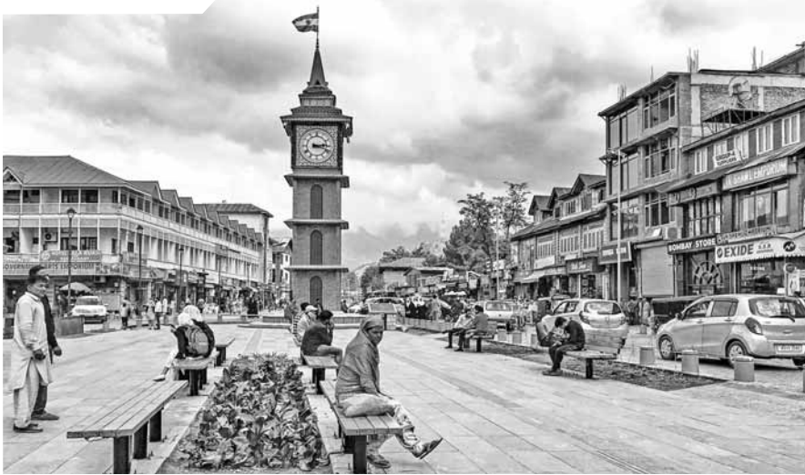
Tourists and locals at Ghanta Ghar on a cloudy day, in Srinagar