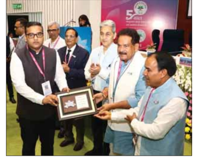
cards and digital health records under the Ayushman Bharat Digital Mission.

Chhattisgarh was on Monday conferred three awards for excellent implementation of the Ayushman Bharat Scheme at the Arogya Manthan programme held in New Delhi. In the large states category, Chhattisgarh has been awarded for gender equality, 100 percent utilization of the funds and more than 90 percent of the families in the state having at least one Ayushman card. AIIMS Raipur was honoured for facilitating patients through digital