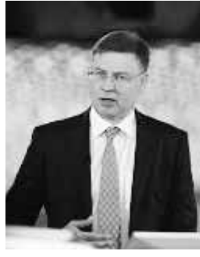
Valdis Dombrovskis, EU trade commissioner.

The European Union's trade commissioner called for a more balanced economic relationship with China on Monday, noting an EU trade deficit of nearly 400 billion euros ($425 billion), while also warning that China's position on the war in Ukraine could endanger its relationship with Europe. Valdis Dombrovskis, in a speech at China's prestigious Tsinghua University, said that the EU and China face significant political and economic headwinds that could cause them to drift apart.