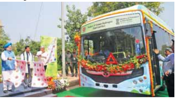
Union Minister for Petroleum & Natural Gas, Hardeep Singh Puri flags off 1st Green Hydrogen Fuel Cell Bus at India Gate in New Delhi on Monday.

tional trials of 15 fuel cell buses powered by green hydrogen on the identified routes in Delhi, Haryana, and UP. Under this programme, the first set of 2 fuel cell buses was launched on Monday.