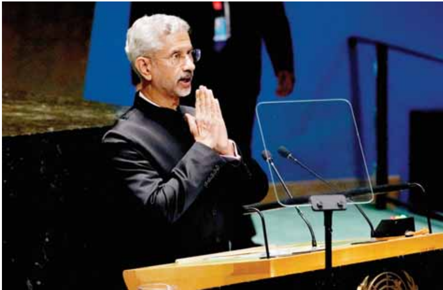
External Affairs Minister Subrahmanya Jaishankar addresses the 78th session of the United Nations General Assembly on Tuesday

Jaishankar's remarks on the "political convenience" appears to be directed at