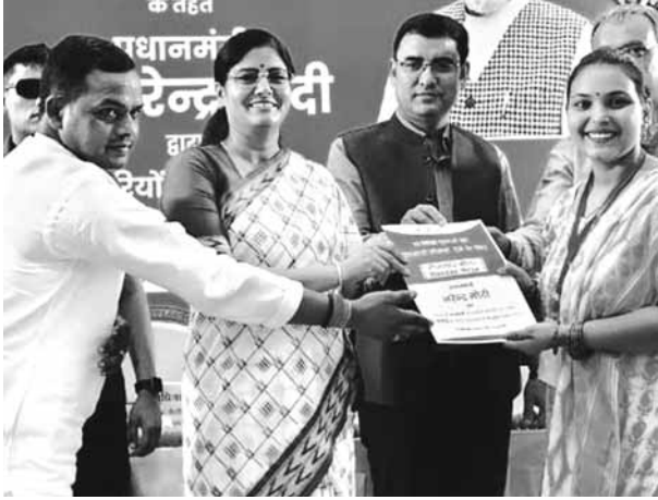
Union Minister Anupriya Patel giving away an appointment letter to a candidate in Varanasi on Tuesday.

Anupriya handed over appointment letters to the newly-appointed candidates and wished them a happy future. During the ceremony in Varanasi, appointment letters were given to 213 candidates, out of which a total of 49 are women candidates who were selected for various posts like