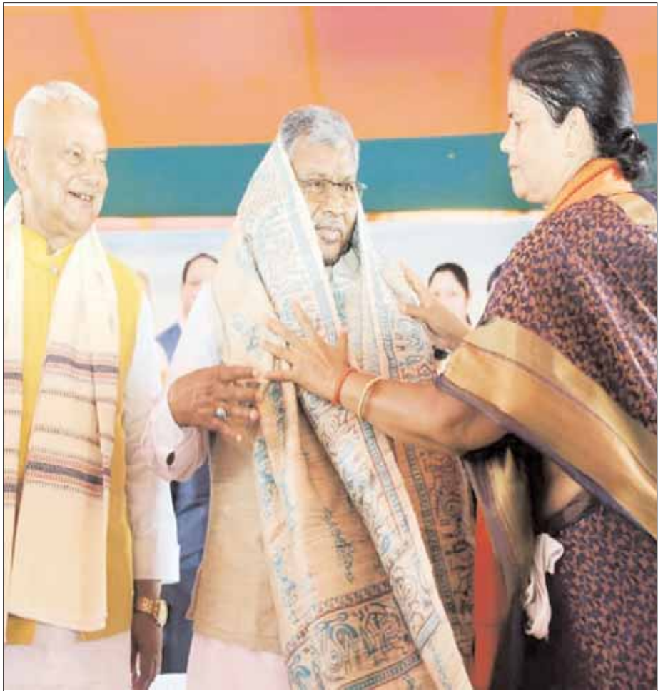
BJP State President Babulal Marandi being welcomed by party leader during his Sankalp Yatra at Football ground Nirsha, on Tuesday.