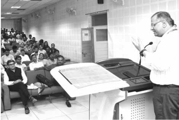
A speaker expressing his views in a session of day-long workshop organised by the Intellectual Property Rights and Technology Transfer (IPRTT) Cell of BHU.