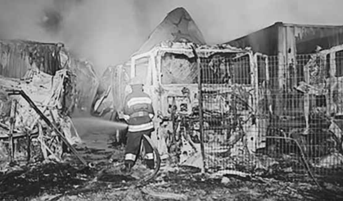
In this photo provided by the Odesa Region Administration, firefighters work to extinguish a fire in port infrastructure after a Russian rocket attack in Izmail, Ukraine, on Tuesday

Russian forces targeted the area of Izmail in the Odesa region, in what has become a sustained campaign to target Ukraine's ability to export grain. Attacks on Monday killed two people in a grain warehouse in Odesa and badly damaged an abandoned high-rise hotel, officials said. After Moscow pulled out of a UN-brokered grain deal this summer, the strikes on Izmail and cities located in the southern part of the Odesa region became routine. Attacks on the cities on the Danube have been especially damaging because the route has emerged as the most promising for continued Ukrainian exports. At least nine civilians were killed in Ukraine and 15 people were injured over the past