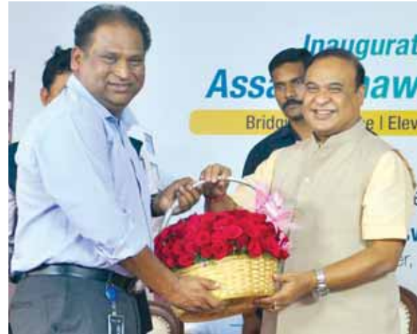
Naruvi Hospitals' Dr GV Sampath welcomes Chief Minister of Assam Himanta Biswa Sarma

JSW INFRA IPO SUBSCRIBED 2.13 TIMES ON DAY 2 New Delhi: The initial share sale of JSW Infrastructure, a part of the JSW Group, received 2.13 times subscription on the second day of offer on Tuesday. The Initial Public Offer (IPO) received bids for 29,02,18,698 shares against 13,62,83,186 shares on offer, as per data available with the NSE. The quota for Retail Individual Investors (RIIs) received 4.52 times subscription while the portion for non-institutional investors got subscribed 3.70 times. The category for Qualified Institutional Buyers (QIBs) was subscribed 55 per cent.