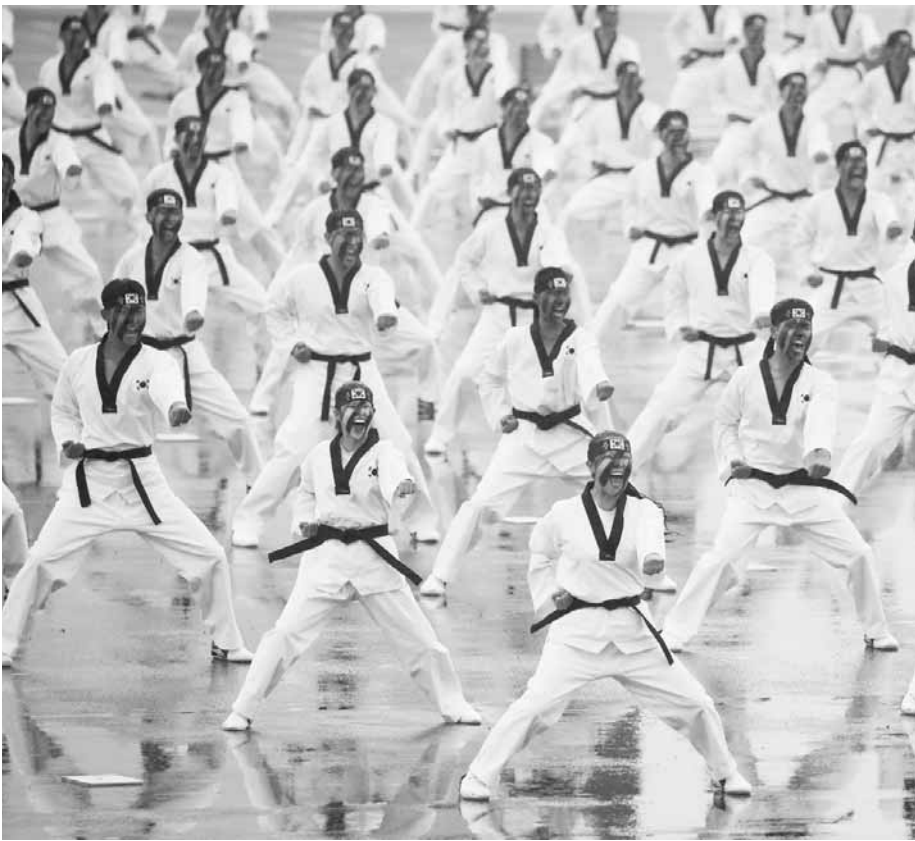
South Korean soldiers give a demonstration of their skills in the traditional Korean martial art of Taekwondo during a celebration to mark the 75th anniversary of Armed Forces Day in Seongnam, South Korea, Tuesday.

But Yoon says Seoul-Washington-Tokyo cooperation won't marginalise any particular nation.