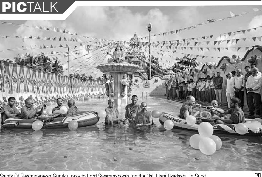
Saints Of Swaminarayan Gurukul pray to Lord Swaminarayan on the 'Jal Jilani Ekadashi, in Surat

The Indian women's cricket team has been steadily rising in stature, captivating the hearts of cricket fans across the country. Their victory in the Asian Games final is a testament to the hard work and dedication that these remarkable athletes put into their craft. From fierce batting to exceptional bowling, every aspect of their game has shone brightly on the international stage. The emergence of women's cricket leagues, greater media coverage and increased investment in infrastructure are all signs of a brighter future for the sport in India. The Indian women's team's triumph in the Asian Games cricket final is a cause for nationwide celebration. These incredible sportspersons have not only showcased their cricketing prowess but have also laid the foundation for a brighter future for women's cricket in India. As we celebrate this historic win, let us remember that it is not just a victory on the cricket field but a triumph of 'nari shakti.' The Indian squad has shown what can be achieved with talent and unwavering determination. Let these wins be a harbinger of more success for sportspersons—a true Amritkal for sports.