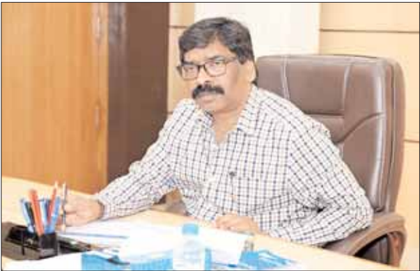
Chief Minister Hemant Soren during a meeting with officials regarding the preparations for organizing the Netarhat Eco Retreat - 2023 proposed by the Tourism Department, in Ranchi on Tuesday.

In the meeting, the CM said that the main objective of organising Netarhat Eco Festival-2023 is to attract international, national and domestic tourists, so that Jharkhand can be recognized as a favourite tourism state. In the meeting, the CM directed the concerned officials to give their best to make the Netarhat Eco Festival event a success. He told the officials that Netarhat Eco-Festival is a great opportunity for tourists to know about Jharkhand