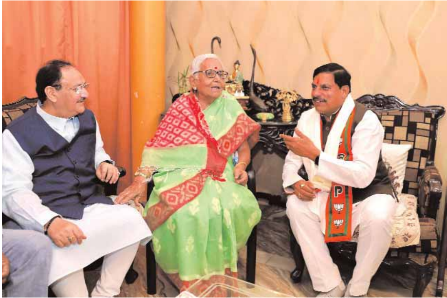
BJP National President JP Nadda meets his mother-in-law and former BJP MP Jayashree Banerjee during his two-day state visit, in Jabalpur, Madhya Pradesh on Wednesday. Madhya Pradesh Chief Minister Mohan Yadav also present on the occasion.