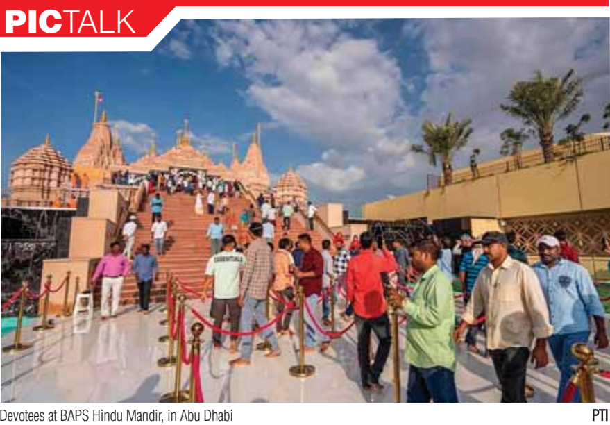
Devotees at BAPS Hindu Mandir, in Abu Dhabi

The Directorate General of Civil Aviation (DGCA) has stepped in, demanding daily reports from the airlines regarding the status of flight operations, crew availability and measures taken to mitigate the impact of disruptions on passengers. The crew shortage issue highlights the challenges faced by airlines in managing their workforce in the midst of evolving dynamics of the aviation industry, particularly in the wake of the COVID-19 pandemic. Domestic flights have been reporting disruptions, including layoffs, furloughs and changes in travel demand patterns, much to the consternation of passengers. The incident underscores the importance of effective workforce management and contingency planning for airlines to ensure smooth and uninterrupted flight operations. As the aviation industry strives to rebound from the challenges posed by the pandemic, maintaining a robust and adequately trained workforce is critical to meeting the evolving needs of passengers and sustaining growth. This is what DGCA must be concerned about and has taken up on priority. As Vistara endeavours to overcome the crew shortage crisis and restore normalcy to its flight operations, the incident serves as a reminder of the complex and dynamic nature of the aviation industry. Effective collaboration among airlines, regulators and stakeholders is essential to address challenges promptly and ensure the seamless functioning of the aviation ecosystem.