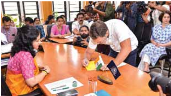
Congress candidate Rahul Gandhi files his nomination papers for the upcoming Lok Sabha elections, in Wayanad district, on Wednesday

Government schemes and their benefits. “If they are not getting the benefits, tell them about Modi's guarantee of ensuring benefits to them. “Our target is to add 370 votes per booth compared to previous elections, with focus on women and first-time voters,” he said. Modi asked the BJP workers to focus on youth voters, particularly first-time voters, and make them aware of the corruption and other misdeeds of the previous Governments. Referring to the construction of the Ram temple in Ayodhya, he said now Ramlalla is seated in the temple, Article 370 has been abolished and law against triple talaq is in place. “He said the law against triple talaq has given security to Muslim families. Earlier, elderly persons in families remained worried that after marriage their daughters might return home due to triple talaq,” he said, adding, “when intentions are clear, good results come”. This time voters are saying “Phir ek baar Modi sarkar” (Modi Government once again), the Prime Minister said. During the programme, the PM spoke to booth heads of Etah, Agra, Hathras and Bareilly and directed them to involve party supporters as campaigners to achieve the target.