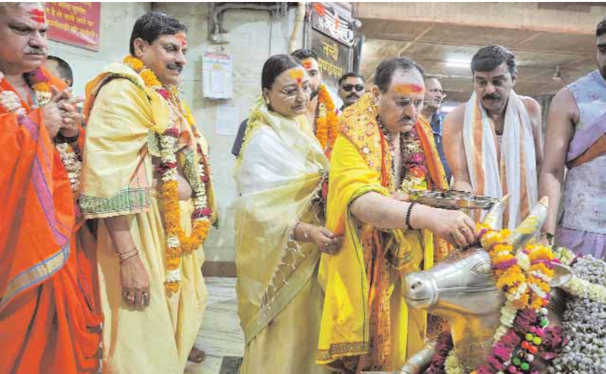
BJP National President JP Nadda and Madhya Pradesh Chief Minister Mohan Yadav offer prayers at the historical Mahakaleshwar Temple in Ujjain, Madhya Pradesh on Wednesday.