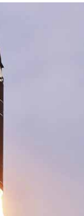
This photo provided by the North Korean government shows the test-fire of what they call an intermediate-range ballistic missile on the outskirts of Pyongyang, North Korea Tuesday.