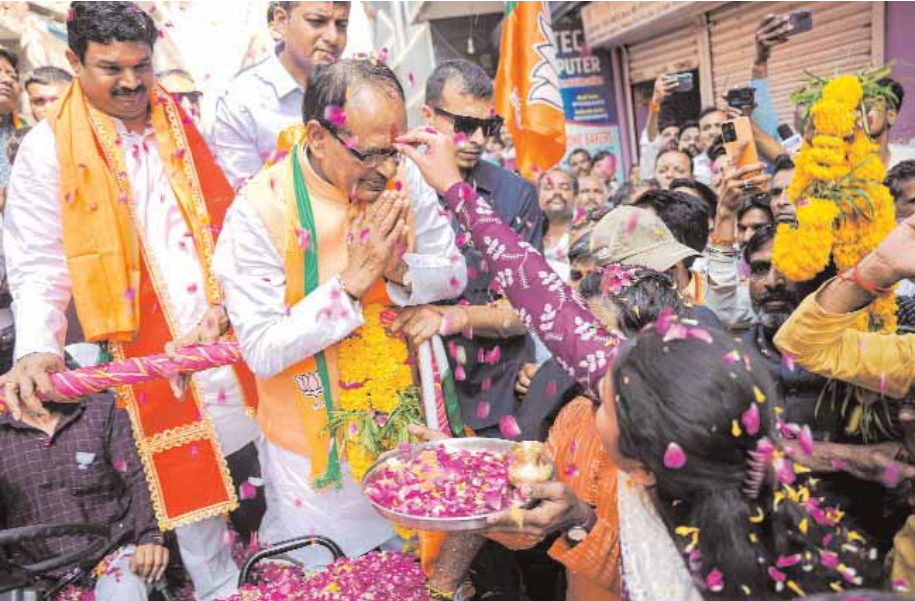
Former Madhya Pradesh Chief Minister and BJP candidate from Vidisha Lok Sabha seat Shivraj Singh Chouhan in a roadshow during an election campaign ahead of the Lok Sabha elections in Ashta, Sehore district Madhya Pradesh on Wednesday.