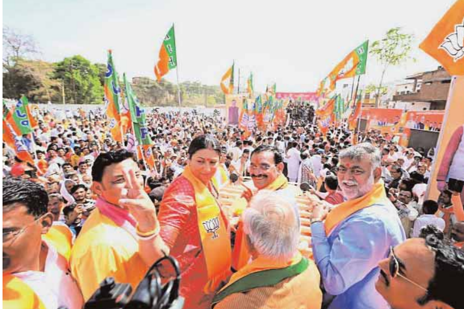
BJP State President and party's Lok Sabha candidate from Khajuraho seat VD Sharma with Union Minister Smriti Zubin Irani during a rally for filing his nomination papers ahead of the Lok Sabha elections in Panna, Madhya Pradesh on Wednesday.