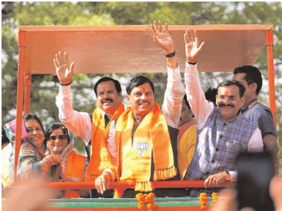
Madhya Pradesh Chief Minister Mohan Yadav during a roadshow in support of BJP candidate from Khajuraho Lok Sabha seat VD Sharma during filing his nomination papers ahead of the Lok Sabha elections in Panna, Madhya Pradesh on Wednesday.

ing of the wedding program and the pen drive for mixing. Since the complainant wanted to preserve the memories related to the marriage ceremony through photographs and videos, but due to the negligence and careless act of the opponent, the complainant was deprived of the memories related to the said marriage ceremony, photographs and videos. Thus the studio did not complete its work properly. After which the opposition will have to pay an amount of Rs 2.5 lakh to the complainant along with interest at the rate of 9 percent per annum, within two months. At the same time, orders were given to pay mental compensation of Rs 50 thousand and other expenses of Rs 5 thousand.