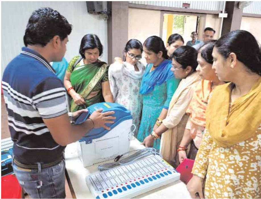
Polling officials undergo a hands-on training programme ahead of the Lok Sabha elections at BSSS college in Bhopal on Wednesday.

Earlier, Collector Singh had also issued orders under Section 144 on March 12. In this also, orders were given regarding monopoly. For this, teams have also been formed under the leadership of SDM. Be it uniform or books, or any kind of stationery. Right now parents have to pay their arbitrary price. Sets of books from class 1st to 8th are available for Rs 2500 to Rs 6000. If parents go to other shops, it is not available there. Same is the case with uniforms also. Uniforms with school logos are available only from designated shops. Parents are also forced to buy belts and ties at arbitrary prices. Last year, the district administration team had also taken action by conducting surprise inspections at uniform and book shops. This time too, action is being claimed on receiving the complaint.