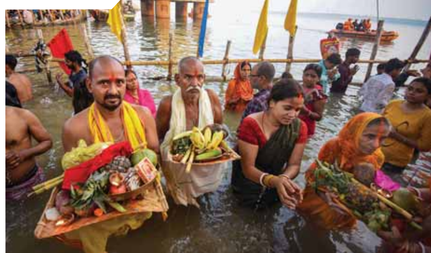
Devotees perform 'Arghya' ritual on the last day of 'Chaiti Chhath' festival, in Patna