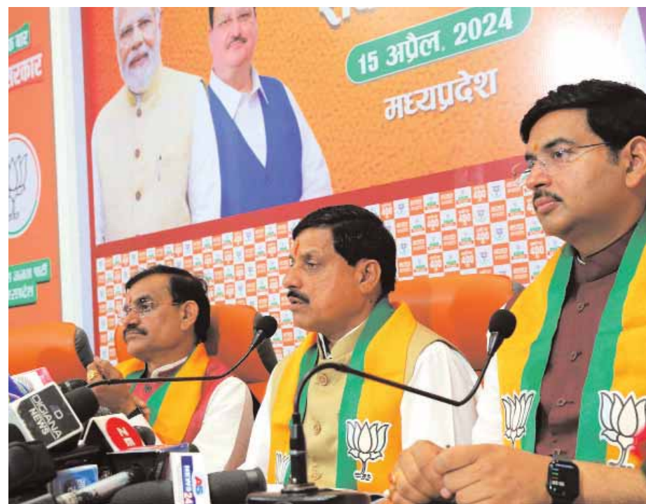
Madhya Pradesh Chief Minister Mohan Yadav with BJP State President VD Sharma during a press conference at BJP Media Center, in Bhopal on Monday.

tourism here has also taken a huge leap. We have a lot of potential in all types of tourism here. The Chief Minister said that the financial system of more than 60 countries of the world runs through tourism. There are many states in our country whose economy is dependent on tourism. Yadav said that a solution to the slums of the poor has also been found in the resolution letter. Now the resolution of satellite towns has been taken. Generally urbanization is increasing rapidly. Master plans made for cities are also made keeping 25 years in mind, but now through satellite towns, the city as well as the cities around it will be developed. Like Sehore will develop with the development of Bhopal, Dewas and Ujjain will develop with Indore.