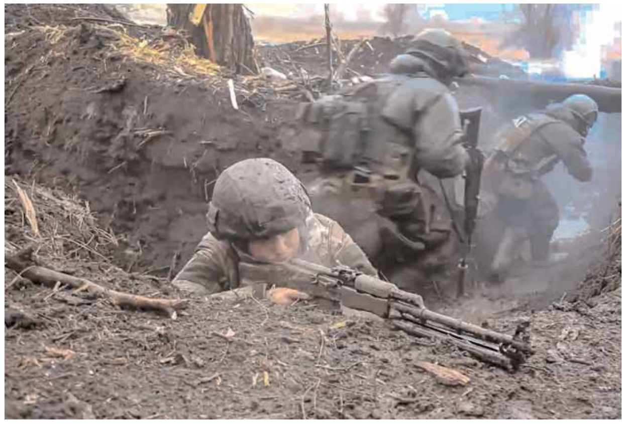
In this photo released by the Russian Defence Ministry Press Service on Monday, April 15, 2024, Russian soldiers participate in a military exercise somewhere in Russian-controlled Donetsk region, eastern Ukraine.

tlefield advantage. At the same time, Ukraine is struggling with shortages of ammunition and troops. Ukraine's military chief on Saturday warned that the battlefield situation in the industrial east has recently significantly worsened. A crucial hurdle to receiving more air defense supplies is the hold-up in Washington of House approval for a US aid package that includes roughly $60 billion for Ukraine. House Speaker Mike Johnson said Sunday he will try to move the package forward this week. "The exhaustion of US-provided air defences resulting from delays in the resumption of US military assistance to Ukraine combined with improvements in Russian strike tactics have led to increasing effectiveness of the Russian strike campaign in Ukraine," the Institute for the Study of War said.