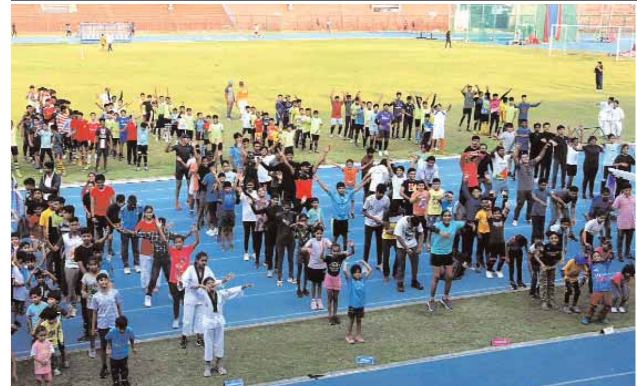
Children take part in an annual sports summer camp organised by Madhya Pradesh Department for Sports and Youth Welfare, at TT Nagar Stadium in Bhopal on Monday.