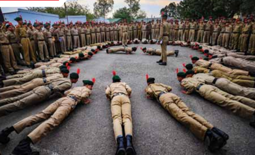
National Cadet Corps perform a drill during their 10-day summer season camp at Nagrota, in Jammu.