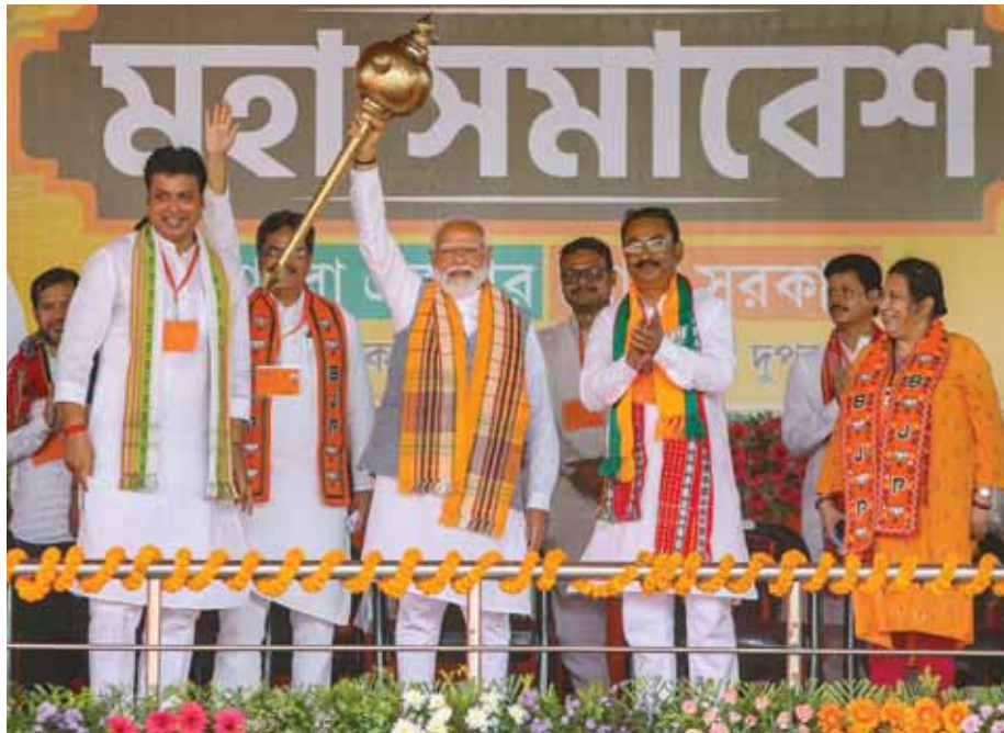
Prime Minister Narendra Modi being felicitated by Tripura Chief Minister Manik Saha, BJP candidate and former Chief Minister Bipal Kumar Deb and others during a public meeting ahead of the Lok Sabha elections in Agartala on Wednesday

Prime Minister Narendra Modi on Wednesday slammed the Congress, saying the party had adopted the 'loot' east policy while the BJP had turned it into the 'Act East' policy. Addressing a rally here, the Prime Minister said Tripura has witnessed pioneering transformations under the BJP government. Modi said the birth celebrations of Lord Ram is being held in his own temple in Ayodhya after 500 years. "The Congress had adopted the 'loot' east policy while the BJP has turned it into the Act East policy," Modi told an election rally in the Tripura capital. Modi said his government has decided to construct three crore new houses in India for the poor. "Tripura's people are going to benefit a great deal from it," he added.