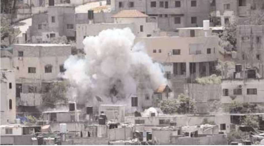
Smoke rises from an explosion during an Israeli military raid in the Nur Shams refugee camp, near the West Bank town of Tulkarem, on Saturday, April 20, 2024