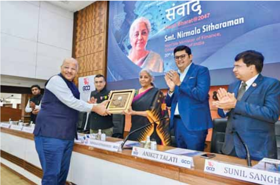
Union Finance Minister Nirmala Sitharaman during an interaction with Gujarat Chamber of Commerce & Industry (GCCl) members, in Ahmedabad

approach has helped especially after China plus one started being a concern for many industry experts, she said policies have been tailored in such a way so as to make India an attractive destination for manufacturing and for services. Speaking about inflation, she said it never crossed the tolerance band, except for one month, under the Narendra Modi government, whereas before that (pre-2014) the economy was in a bad shape and inflation was in double digits. “At that time (pre 2014) nobody had any expectations from the country. After much hard work, we have emerged as the world’s fifth largest economy and are confidently saying we will be third in the next two to two-and-half years,” the Union minister said. On employment, Sitharaman said there was lack of complete data from both the formal and informal