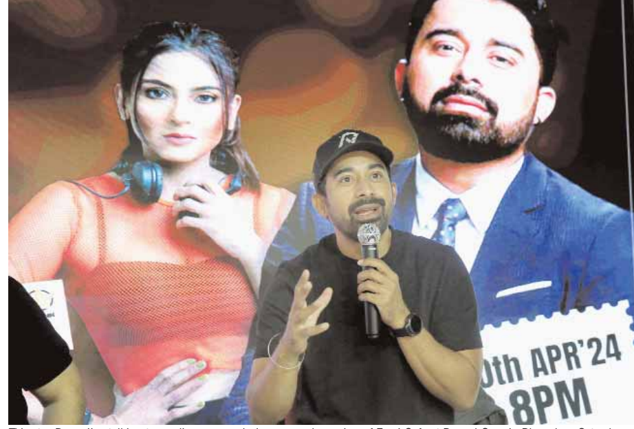
TV actor Rannvijay talking to media persons during a grand opening of Farzi Cafe at Bansal One, in Bhopal on Saturday.

Farzi Café launches in Bhopal on Friday. Located in the heart of the city at Bansal One, The Biggest Commercial and F&B Hub of Bhopal city, Farzi Café, Bhopal is spread across 4500 sq feet with an outdoor seating area, a live screening section and quirky interiors creating an ambience that the city has not experienced before. Focusing on the gourmet diner as well as the youth of India, Farzi Café has brought Indian cuisine back "in-Vogue". The menu at Farzi Café, Bhopal includes dishes with their own stories to tell with table theatrics, flowing smoke and a gastronomic experience with an elaborate tapas style menu, along with molecular mixology that will be a first for Bhopal. Zorawar Kalra, founder and Managing Director, Massive Restaurants - the force behind Farzi Café, on the launch of Farzi Café, Bhopal "Farzi Café is a world-renowned brand and we are delighted to bring its rendition of global cuisine, where culinary art meets the alchemy of contemporary dining to absorb the guest into the ultimate gastronomic illusion to Bhopal.