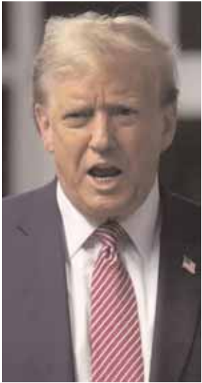
Former President Donald Trump speaks with the media following proceedings in his trial, at Manhattan Criminal Court in New York on Friday

The man, who police said had travelled from Florida to New York in the last few days, hadn't breached any security checkpoints to get into the park. The park outside the courthouse has been a gathering spot for protesters, journalists and gawkers throughout Trump's trial, which began with jury selection Monday. Through Friday, the streets and sidewalks in the area around the courthouse were generally wide open and crowds have been small and largely orderly. Authorities said