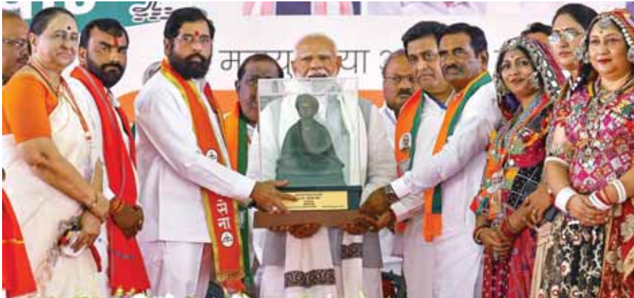
Nanded: Prime Minister Narendra Modi with Maharashtra Chief Minister Eknath Shinde during a rally for Lok Sabha polls, in Nanded, on Saturday

Modi said that the infighting was on within the Opposition INDIA bloc over the 25 per cent seats. "Come June 4, the INDI alliance leaders will tear the clothes and hair of one another. Do you want to waste your votes on these leaders? That's why you should vote for the NDA. Voting for NDA is