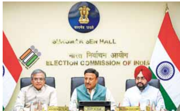
Chief Election Commissioner Rajiv Kumar with Election Commissioners Gyanesh Kumar and Sukhbir Singh Sandhu addresses the media in New Delhi on Monday.