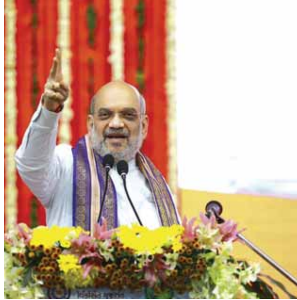
Lord Ram's idol at the Ayodhya temple in lure of their vote bank. The Union minister hailed PM Modi, saying he has a "track record of 10 years and agenda for 25 years." "Narendra Modi ji has

Union Home Minister Amit Shah on Monday said the government led by Prime Minister Narendra Modi has eliminated terrorism from the country while Naxalism is on the verge of ending. Addressing an election rally in Chhattisgarh's Kanker town, Shah also asked Naxalites to surrender, or else they would be rooted out from the state in two years. He asked Congress leader Rahul Gandhi that four generations of his family were in power in the country, but what they have done for the poor people in Chhattisgarh. "The Congress says the minority (community) has the first right over the country's resources of the country, but we (BJP) say the poor, adivasis, Dalits and backwards have the first right over resources of the country," Shah said. He also said that Congress leaders did not attend the consecration ceremony of