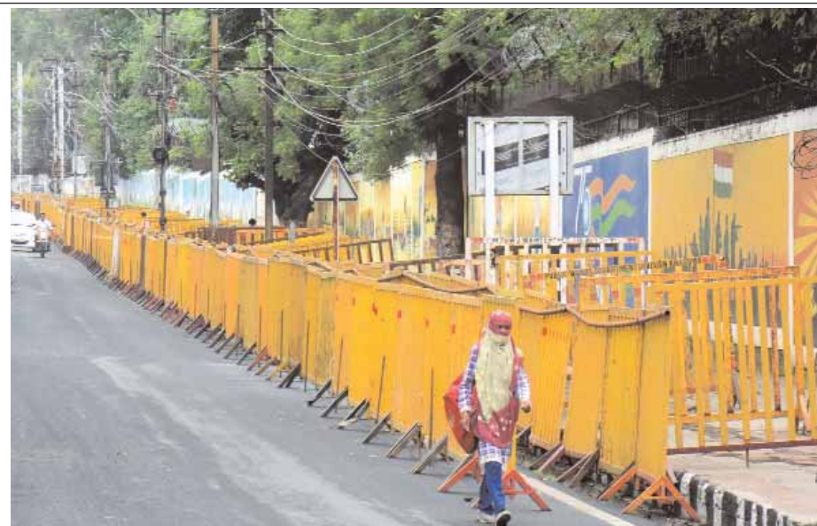
Preparations underway ahead of Prime Minister Narendra Modi's road show for the Lok Sabha elections in Bhopal on Monday.

commence around 7 pm, Bhopal Commissioner of Police Harinarayanachari Mishra told media persons. Nearly 2,000 police personnel, including 24 IPS officers, will be deployed for security during the roadshow, he added. In the 2019 Lok Sabha polls, the BJP won 28 out of the total 29 Lok Sabha seats in the state, while the Congress won only the Chhindwara constituency. This time, the BJP is aiming for a clean sweep in the state. The BJP has been winning the Bhopal Lok Sabha seat since 1989. According to the Election Commission, there are 23,29,892 voters in the Bhopal Lok Sabha constituency.