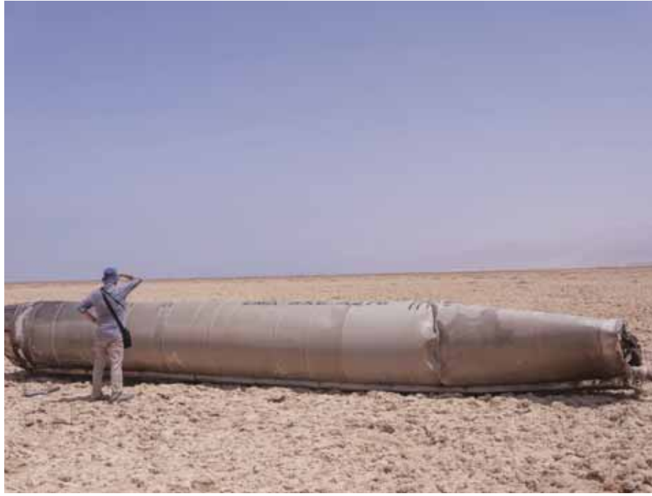
A photojournalist looks at part of the intercepted ballistic missile that fell near the Dead Sea in Israel, Sunday. The suspected Israeli killing of Iranian generals at an Iranian diplomatic compound in Syria on April 1 prompted Iran's retaliatory barrage last weekend of more than 300 missiles and drones that the U.S., Israel and regional and international partners helped bat down without significant damage in Israel. And then came Friday's ads apparent Israel.

Israel's Military Intelligence chief Major General Aharon Haliva resigned on Monday, taking responsibility for his unit's failures during the unprecedented October 7 Hamas attacks on the Jewish state. Haliva is the first General of the Israeli army's general staff to leave his position due to the failures that led to the massive attack by the Palestinian militant organisation Hamas and the subsequent war in Gaza. In his resignation letter written in Hebrew, Haliva said, "The Intelligence Division did not live up to the task we were entrusted with. Throughout my duties, I knew that alongside authority comes heavy responsibility." The General said he would like to "take responsibility" for what happened on October 7 and promised to do his best to complete as many of the war's goals as possible. Haliva also called for the establishment of a state investigative committee, "that can probe and find out in a thorough, in-depth, comprehensive and precise manner all the fac-