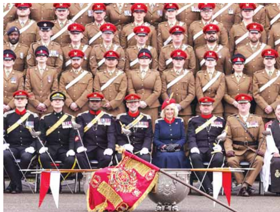
Britain's Queen Camilla poses for a group photograph with The Royal Lancers, in Caterick, England. Queen Camilla undertakes her first visit to the Regiment since being appointed as their Colonel-in-Chief.

that for more than seven years hindered its ability to compete in targeted search ads. An FTC investigation into whether that violated the Anti-Monopoly Law led Google to drop the restrictions. Google said in an emailed statement that it has cooperated fully with the commission's probe, and stressed the commission has not found it had outright violated anti-monopoly laws. It promised to carry out the commission's directives to offer "valuable" search functions to Japanese users and advertisers. Line Yahoo declined comment. Google will be under review for the next three years, to ensure it carries out needed changes, the commission said.