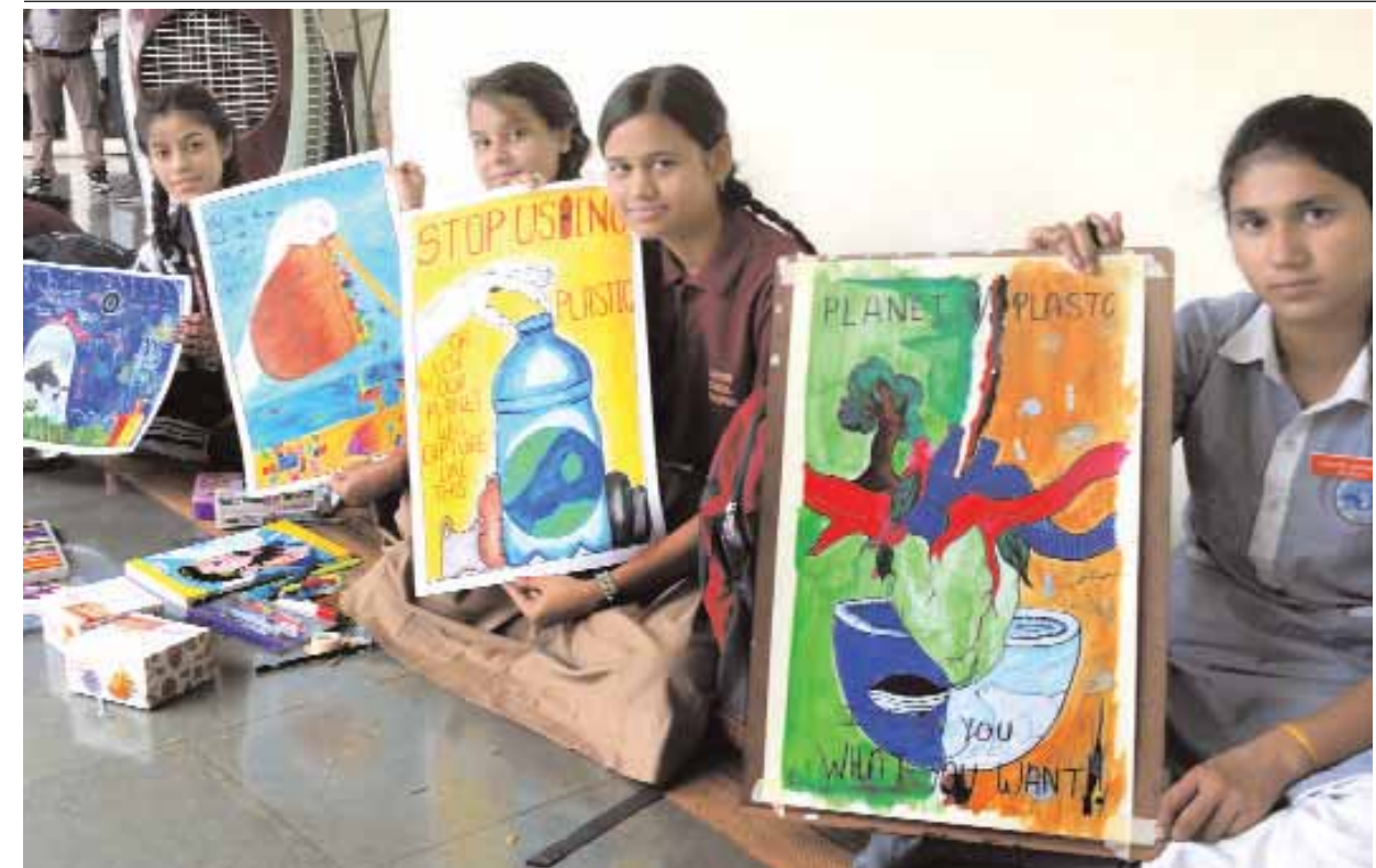
Students take part in a poster making competition on the occasion of World Earth Day at the Regional Museum of Natural History in Bhopal on Monday.