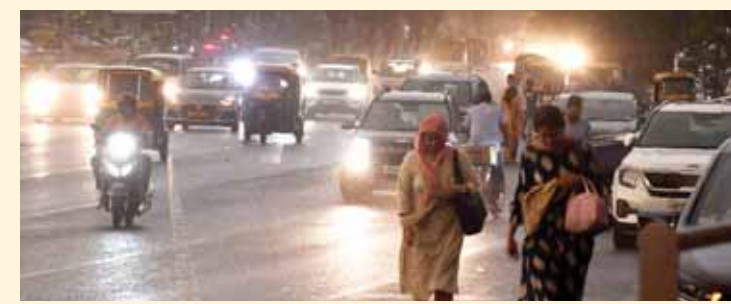
Gusty winds swept the national Capital as parts of Delhi received light rain on Tuesday, bringing respite to people