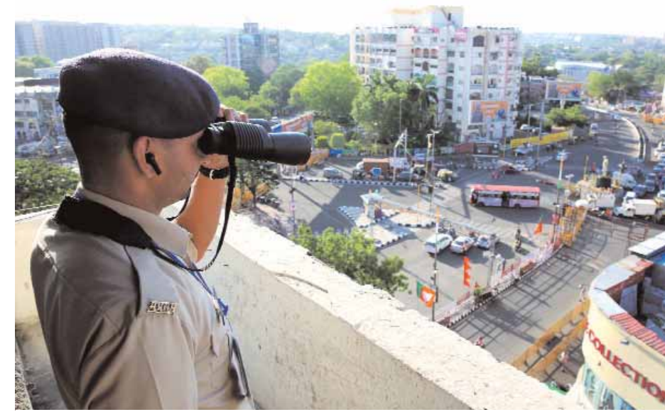
A security personnel keeps vigil through a binocular ahead of Prime Minister Narendra Modi's road show for the Lok Sabha elections in Bhopal on Tuesday.