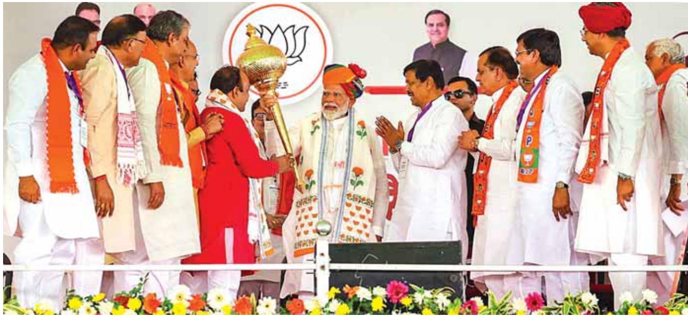
Prime Minister Narendra Modi being felicitated by BJP leaders during a public meeting for Lok Sabha elections in Tonk district Rajasthan on Tuesday

it could not fulfil its intention," Modi claimed.