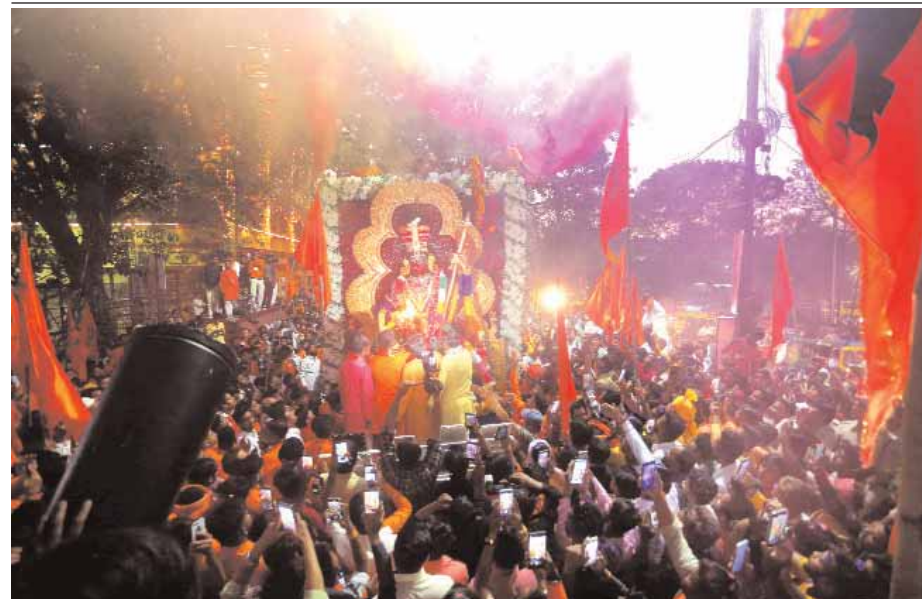
Members of Jai Maa Bhawani Hindu Sangathan participate in a religious procession on the occasion of Hanuman Jayanti in Bhopal on Tuesday.

will continue till April 25. Another system may become active from April 26. Due to this, rain is expected in the last week of April also. Due to rain, the day temperature has dropped in many cities of the state.