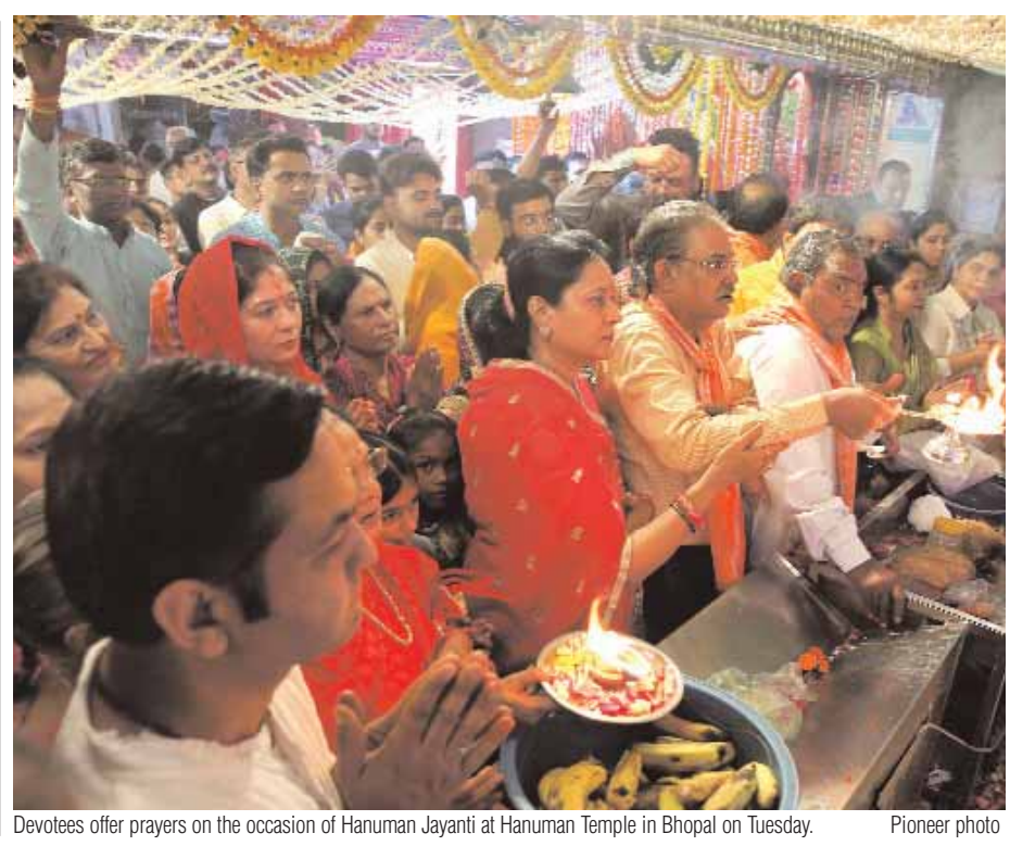
Devotees offer prayers on the occasion of Hanuman Jayanti at Hanuman Temple in Bhopal on Tuesday.