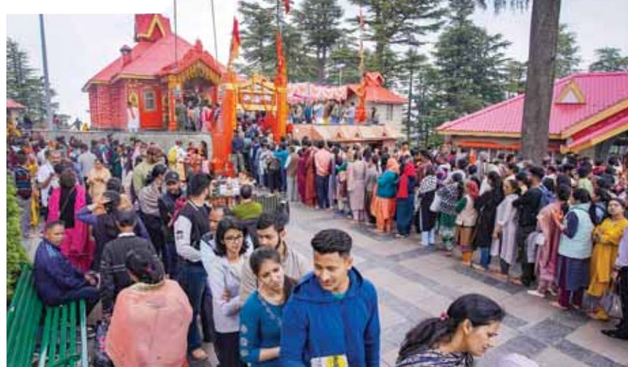
Devotees arrive at Jakhu temple to offer prayers on the occasion of 'Hanuman Jayanti', in Shimla