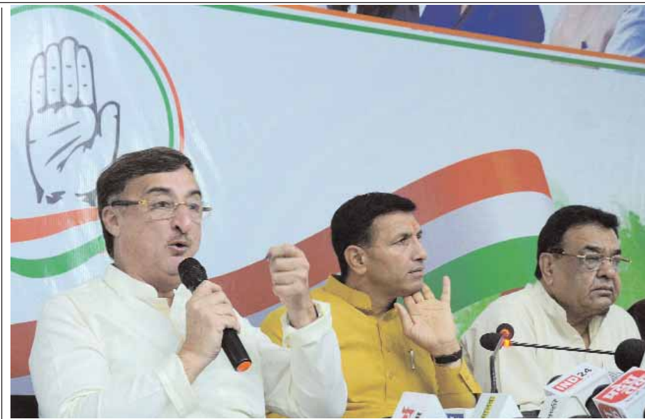
Senior Congress leader and Rajya Sabha MP Vivek Tankha with Congress State President Jitu Patwari addresses a press conference at PCC headquarters in Bhopal on Wednesday.