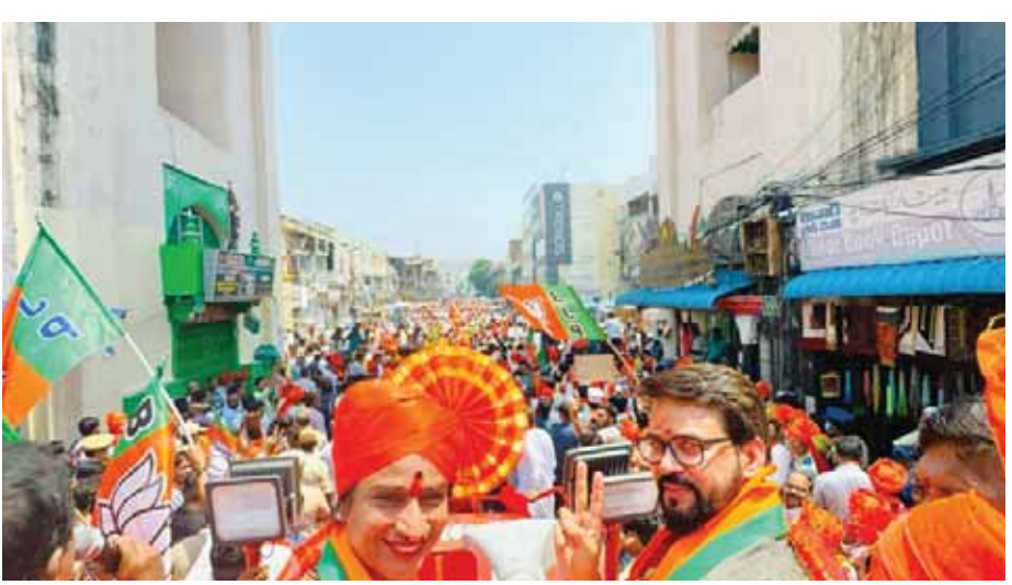
Union Information and Broadcasting Minister Anurag Thakur campaigning in a road show for the BJP Hyderabad candidate Madhavi Lok Sabha on Wednesday.

by malaria and ensure all individuals, irrespective of their socio-economic status or geographical location, have access to prevention, diagnosis and treatment services for the disease. "Moreover, by leveraging digital technology, we can better understand the diverse health needs of populations, collect and analyse data and monitor progress in real-time, enabling us to identify and address health inequities through both proven