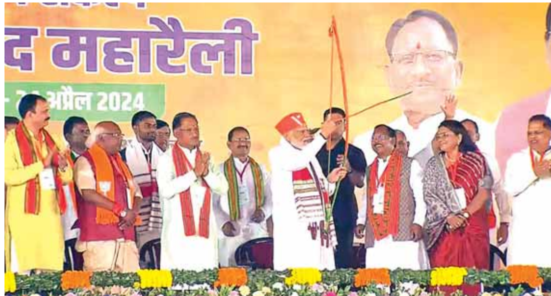
Prime Minister Narendra Modi during a public meeting for the Lok Sabha elections, in Surguja district, Chhattisgarh, on Wednesday

In his poll rallies, Modi framed Pitroda's comments in his wider onslaught against the Congress, asserting that they have exposed its hidden agenda and that the party has become so removed from the country's social and family values that it wants to legally rob people of their assets and lifelong savings they want to bequeath to their children. Pitroda had spoken about inheritance tax in the US while delving into the issue of