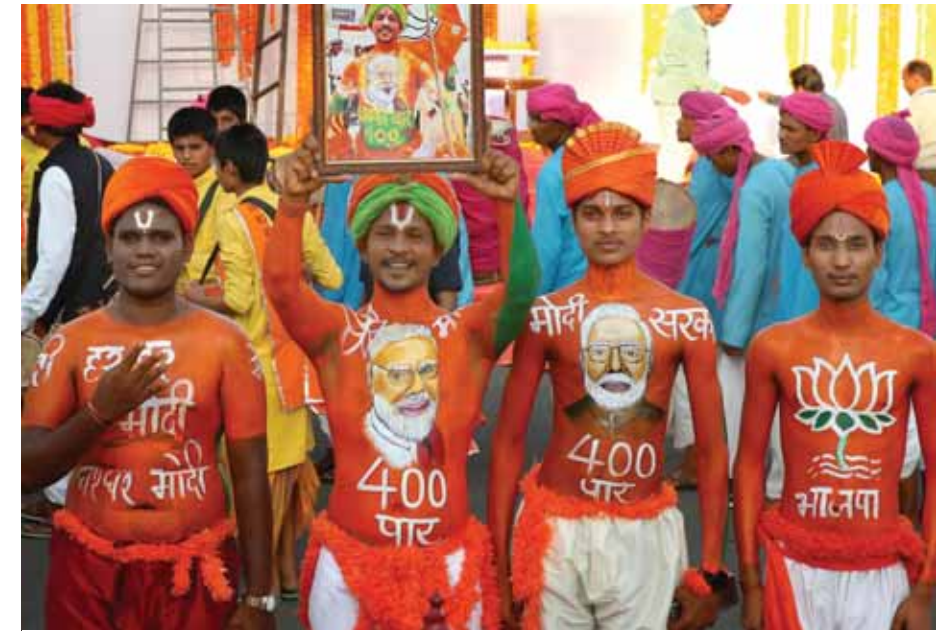
BJP supporters during Prime Minister Narendra Modi's road show for Lok Sabha elections, in Bhopal on Wednesday.