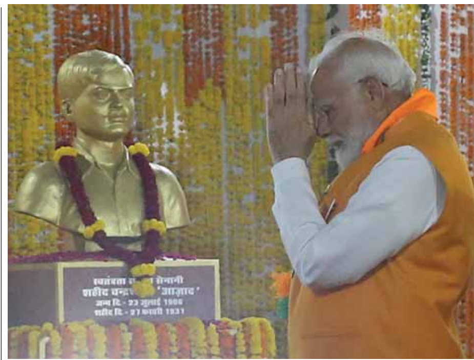
Prime Minister Narendra Modi pays tributes to Pt Chandrashekhar Azad during a road show for Lok Sabha elections, in Bhopal on Wednesday.

the tribals, the Muslims, that is why we appoint them to the highest positions in the country. This work was never done during the Congress government. He never made any tribal or Muslim the President of the country. We love the poor, that is why people from poor families become Prime Ministers and Chief Ministers here. Only Bharatiya Janata Party and Prime Minister Shri Narendra Modi can do this work. Congress people keep fighting each other and their politics runs on this basis. They have been doing this work for years. Their mentality has been like this since the country's independence. When the country became independent, they first got India-Pakistan divided and then continued to rule by creating division between Hindus and Muslims.