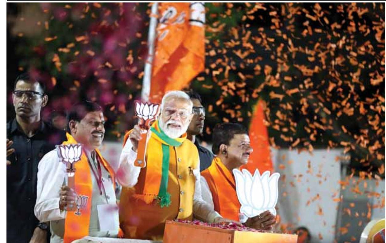
Prime Minister Narendra Modi during a road show for Lok Sabha elections, in Bhopal on Wednesday.

districts would witness rainfall. There is no warning of rain in the state on April 27, but it will remain cloudy. These include Agar-Malwa, Rajgarh, Guna, Khargone, Khandwa, Burhanpur, Harda, Betul, Narmadapuram, Raisen, Pandhurna, Chhindwara, Narsinghpur, Sagar, Tikamgarh, Chhatarpur, Panna, Damoh, Jabalpur, Dindori, Mandla and Balaghat districts. Many rainfall records were broken in April. About two and a quarter inches of rain fell in Bhopal. At the same time, a record of rain for 11 consecutive days in April has also been made. There has been continuous rain in the state from April 7 to April 17. Now the state is getting drenched again. It is expected to rain till April 27. It has rained from the second system for five consecutive days.