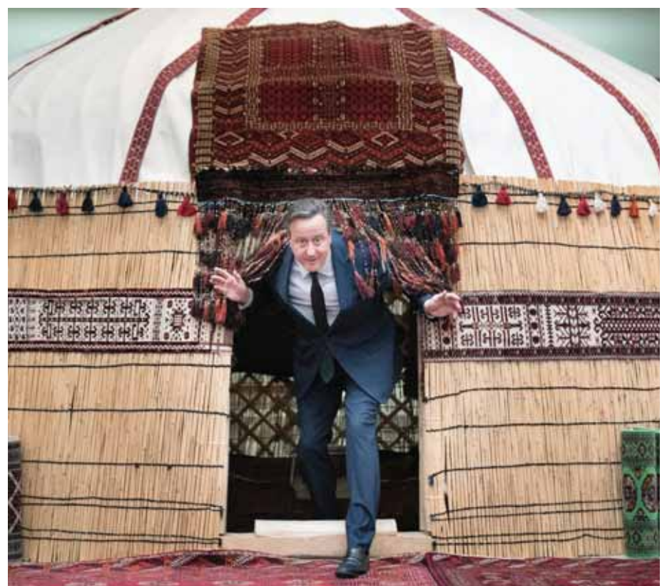
Foreign Secretary Lord David Cameron visits the National Carpet Museum in Ashgabat in Turkmenistan during his five day visit to Central Asia, on Wednesday.