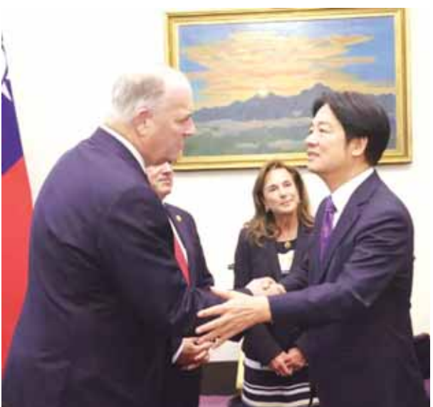
In this photo released by the Taiwan Presidential Office, U.S. Democratic Congressman Dan Kildee, left, meets with Taiwan President-elect and Vice President Lai Ching-te in Taipei, Taiwan on Tuesday.

AP ■ TAIPEI Taiwan's president-elect has appointed new foreign and defence ministers to join his incoming administration as the island faces continuing military threats and diplomatic isolation from China. Lai Ching-te, who assumes the presidency on May 20, announced Thursday that current Presidential Secretary General Lin Chia-lung will take over as foreign minister. He said Wellington Koo will head the Defence Ministry at a time when Taiwan is upgrading its defences against China with new ships, submarines, warplanes, missile systems and other land-based defences. Along with stepping up its threat to annex Taiwan by force, China has whittled down the number of Taiwan's formal diplomatic allies to