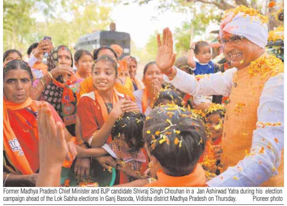
Former Madhya Pradesh Chief Minister and BJP candidate Shivraj Singh Chouhan in a Jan Ashirwad Yatra during his election campaign ahead of the Lok Sabha elections in Ganj Basoda, Vidisha district Madhya Pradesh on Thursday.