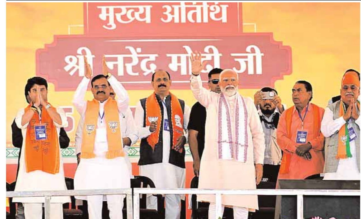
Prime Minister Narendra Modi with Union Minister Jyotiraditya Scindia and BJP State President VD Sharma during an election rally ahead of the Lok Sabha elections in Morena Madhya Pradesh on Thursday.