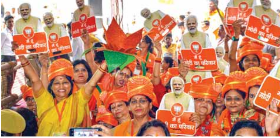
BJP supporters during Prime Minister Narendra Modi's election campaign rally for Lok Sabha polls, in Agra, on Thursday

Taking cognisance for the first time of a model code conduct violation complaint against Prime Minister Narendra Modi, the Election Commission has issued notice to BJP national president JP Nadda and sought his response by April 29.