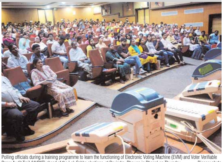
Polling officials during a training programme to learn the functioning of Electronic Voting Machine (EVM) and Voter Verifiable Paper Audit Trail (VVPAT) ahead of the Lok Sabha elections, at Ravindra Bhawan in Bhopal on Thursday.