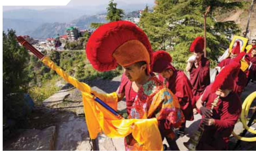
Tibetan monks during special prayers for the long life of the 11th Panchen Lama on his birthday, in Shimla