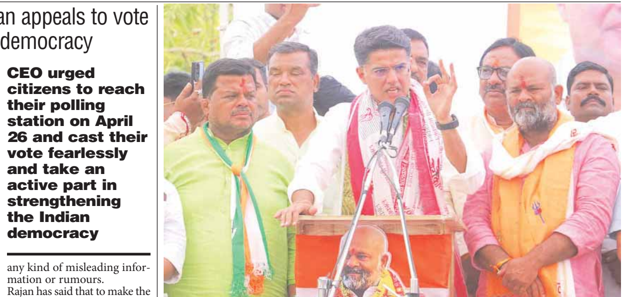
AICC General Secretary Sachin Pilot during a public meeting in support of Congress candidate Mahesh Parmar ahead of the Lok Sabha elections in Ujjain, Madhya Pradesh on Thursday.

even malaria mosquitoes will not breed and when there are no mosquitoes then how will malaria breed. Therefore we should maintain cleanliness around us. If someone gets fever, get it checked immediately and do not be careless in treatment. The program was organized in collaboration with District Malaria Office, Bhopal. Children had special participation in these programs. Health education session using