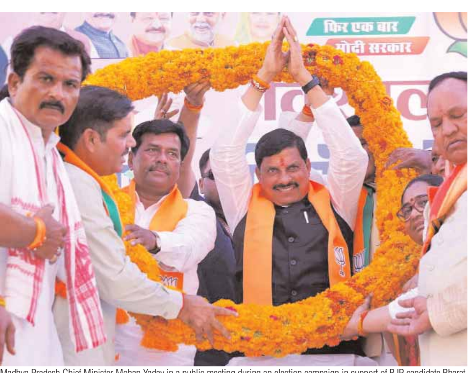
Madhya Pradesh Chief Minister Mohan Yadav in a public meeting during an election campaign in support of BJP candidate Bharat Singh Kushwaha ahead of the Lok Sabha election in Karera, Shivpuri district Madhya Pradesh on Saturday.

from Gwalior to Guna six lane, which was earlier two lane, was done at a cost of Rs 5000 crore. Union Minister Shri Scindia said that today Shivpuri is connected to the main stream of development. There were only a few trains from Shivpuri railway station, but today there are trains for every corner of the country.