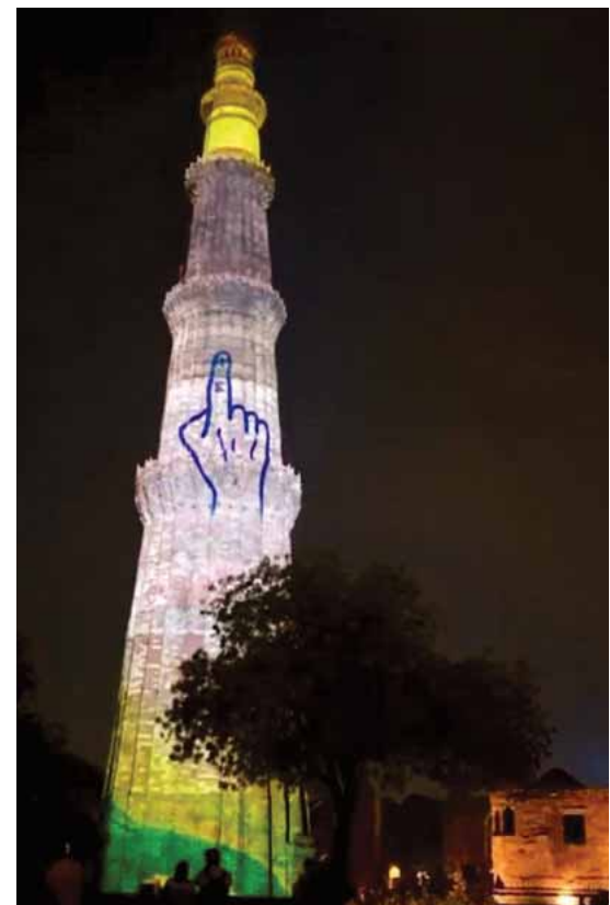
Qutub Minar lights up in spirit of Jashn-e-matdan to celebrate Lok Sabha polls