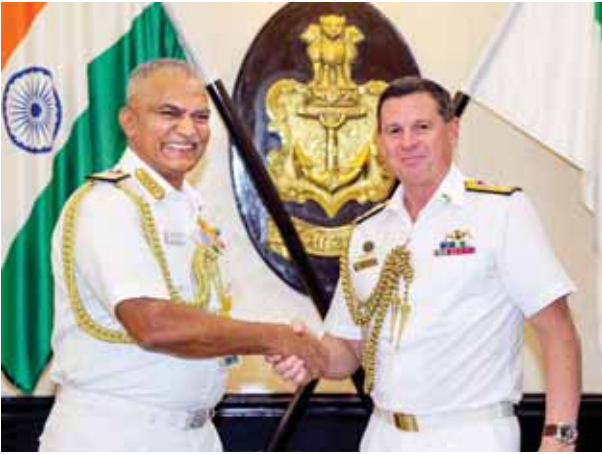
Chief of Naval Staff Admiral R. Hari Kumar with Chief of the Royal Australian Navy Vice Admiral Mark Hammond during a meeting, in New Delhi

India and Australia on Wednesday here reviewed the entire spectrum of their bilateral maritime ties during talks between Navy Chief Admiral R Hari Kumar and his Australian counterpart Vice Admiral Mark Hammond. He is on a visit to India from April 2-6. Giving details of parleys between the two chiefs, Navy officials said discussions focused on avenues to strengthen bilateral maritime cooperation, including increased operational engagements, training exchanges, and information sharing. India and Australia share commonality of perspective on several contemporary maritime security issues in the Indo-Pacific and have been working together closely in several bilateral and multilateral fora such