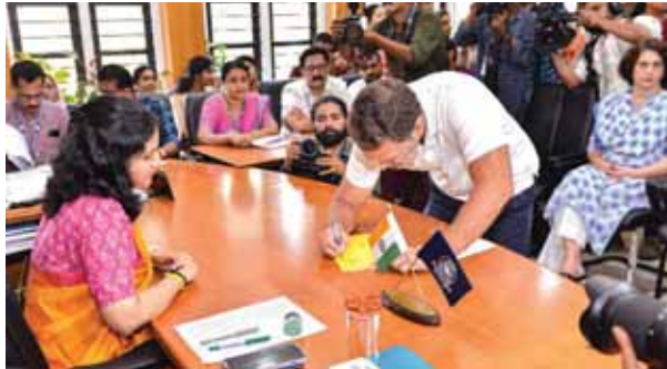
Congress candidate Rahul Gandhi files his nomination papers for the upcoming Lok Sabha elections, in Wayanad district, on Wednesday

their benefits. “If they are not getting the benefits, tell them about Modi’s guarantee of ensuring benefits to them. “Our target is to add 370 votes per booth compared to previous elections, with focus on women and first-time voters,” he said. Modi asked the BJP workers to focus on youth voters, particularly first-time voters, and make them aware of the corruption and other misdeeds of the previous Governments. Referring to the construction of the Ram temple in Ayodhya, he said now Ramlalla is seated in the temple, Article 370 has been abolished and law against triple talaq is in place. “He said the law against triple talaq has given security to Muslim families. Earlier, elderly persons in families remained worried that after marriage their daughters might return home due to triple talaq,” he said, adding, “when intentions are clear, good results come”. This time voters are saying “Phir ek baar Modi sarkar” (Modi Government once again), the Prime Minister said. During the programme, the PM spoke to booth heads of Etah, Agra, Hathras and Bareilly and directed them to involve party supporters as campaigners to achieve the target.