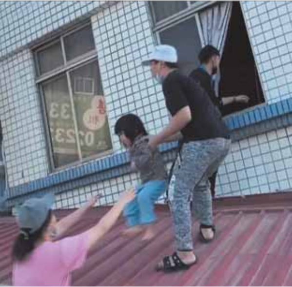
In this image taken from a video footage run by TVBS, residents rescue a child from a partially collapsed building in Hualien, eastern Taiwan on Wednesday

The strongest earthquake in a quarter-century rocked Taiwan during the morning rush hour Wednesday, killing nine people, trapping dozens in quarries and sending some residents scrambling out the windows of damaged buildings. A tsunami warning was triggered but later lifted. The quake, which also injured hundreds, was centred off the coast of rural, mountainous Hualien County, where some buildings leaned at severe angles, their ground floors crushed. Just over 150 kilometres away in the capital of Taipei, tiles fell from older buildings, and schools evacuated their students to sports fields, equipping them with yellow safety helmets. Some children covered themselves with textbooks to guard against falling objects as aftershocks continued. Television images showed neighbours and rescue workers lifting residents, including a toddler, through windows and