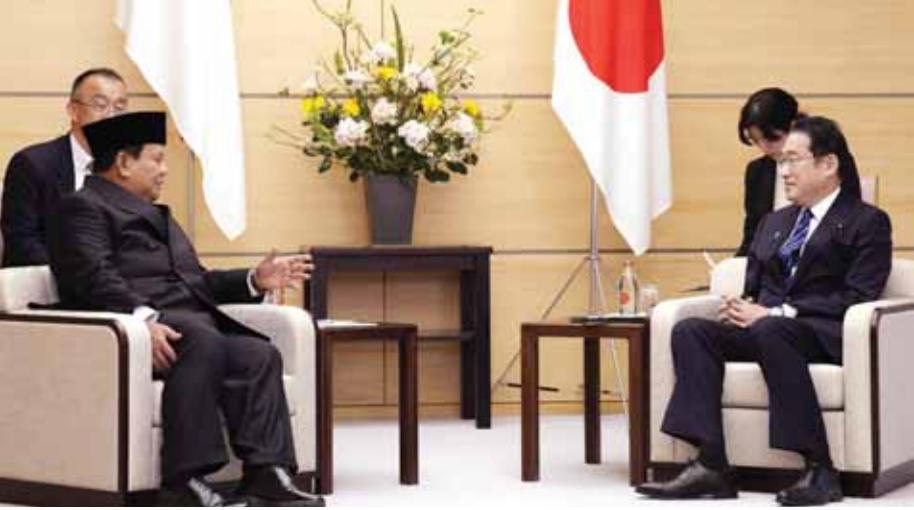
Indonesian President-elect and current Defense Minister Prabowo Subianto, left, and Japan's Prime Minister Fumio Kishida, right, meet at the prime minister's office Wednesday, in Tokyo.

Indonesian President-elect Prabowo Subianto said he wants to “further strengthen” relations with Japan as he met with Japanese Prime Minister Fumio Kishida on Wednesday on the heels of a visit to China. Subianto, who's currently defence minister, told Kishida that the two countries are longtime friends who have built a cooperative relationship, and that he hoped to further strengthen the relationship. Japan has been seeking closer ties with Southeast Asian countries, especially in maritime security and defence, in the face of China's increasingly assertive military presence. Subianto, who will succeed Joko Widodo in October, chose Beijing for his first official overseas trip after his February election victory in a bid to emphasise steady ties with China amid rising tensions in the South China Sea, where China and the Philippines have had repeated high-seas confrontations. In