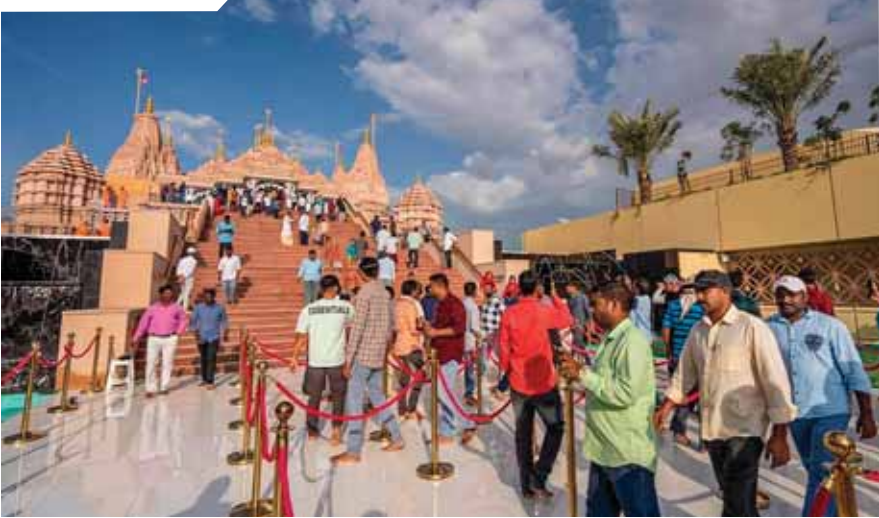
Devotees at BAPS Hindu Mandir, in Abu Dhabi