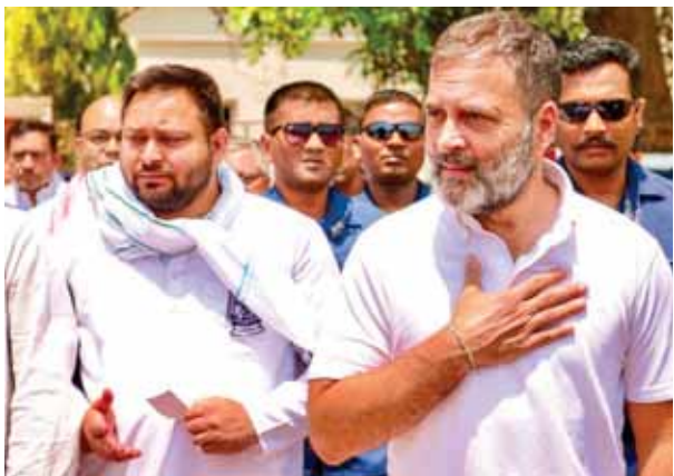
Bhagalpur: Congress leader Rahul Gandhi and RJD leader Tejashwi Yadav during an election campaign rally ahead of Lok Sabha polls, in Bhagalpur

"The enactment of these laws by Parliament is a clear indication that India is changing and on the move, and needs new legal instruments to deal with the current challenges," the CJI said.