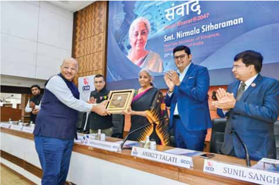
Union Finance Minister Nirmala Sitharaman during an interaction with Gujarat Chamber of Commerce & Industry (GCC) members, in Ahmedabad

approach has helped especially after China plus one started being a concern for many industry experts, she said policies have been tailored in such a way so as to make India an attractive destination for manufacturing and for services. Speaking about inflation, she said it never crossed the tolerance band, except for one month, under the Narendra Modi government, whereas before that (pre-2014) the economy was in a bad shape and inflation was in double digits. “At that time (pre 2014) nobody had any expectations from the country. After much hard work, we have emerged as the world’s fifth largest economy and are confidently saying we will be third in the next two to two-and-half years,” the Union minister said. On employment, Sitharaman said there was lack of complete data from both the formal and informal