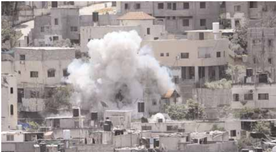
Smoke rises from an explosion during an Israeli military raid in the Nur Shams refugee camp, near the West Bank town of Tulkarem, on Saturday, April 20, 2024