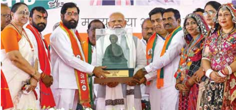
Nanded: Prime Minister Narendra Modi with Maharashtra Chief Minister Eknath Shinde during a rally for Lok Sabha polls, in Nanded, on Saturday

Modi said that the infighting was on within the Opposition INDIA bloc over the 25 per cent seats. "Come June 4, the INDI alliance leaders will tear the clothes and hair of one another. Do you want to waste your votes on these leaders? That's why you should vote for the NDA. Voting for NDA is