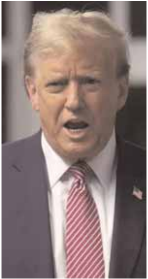
Former President Donald Trump speaks with the media following proceedings in his trial, at Manhattan Criminal Court in New York on Friday

The man, who police said had travelled from Florida to New York in the last few days, hadn't breached any security checkpoints to get into the park. The park outside the courthouse has been a gathering spot for protesters, journalists and gawkers throughout Trump's trial, which began with jury selection Monday. Through Friday, the streets and sidewalks in the area around the courthouse were generally wide open and crowds have been small and largely orderly. Authorities said