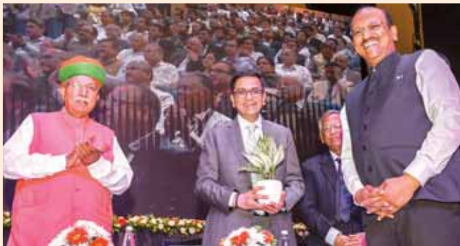
Chief Justice of India D.Y. Chandrachud and Union Minister of Law & Justice Arjun Ram Meghwal during the inauguration of a conference on 'India's New Criminal Justice System - A Progressive Step' organised by the Ministry of Law and Justice, at the Ambedkar International Centre, in New Delhi, on Saturday

"The voter turnout in Bihar is low because the Opposition here is in a state of atrophy. Although the NDA is going to do well everywhere, at least it has some competition in, say, West Bengal, which is a reason why voters there turned up in large numbers yesterday," he told reporters.