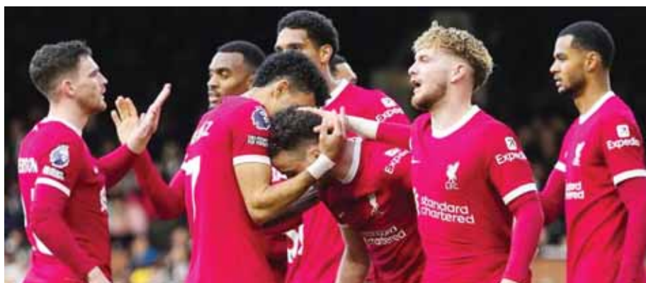
striking ability. First, he received the ball centrally and he delivered a first-time side-footed pass in behind Fulham full-back Antonee Robinson before Diaz's low cross to Jota was struck wide of the right-hand post. Then, after Joao Palhinha brought down Jota on the counterattack, Alexander-Arnold stood over the set-

as Liverpool joined Arsenal on 74 points - one more than defending champion Manchester City, which has a game in hand. Fulham academy graduate Harvey Elliott, who swapped London for Merseyside in 2019, was galvanized by jeers from the home fans as he helped his side create the first chance of the match. The attacking midfielder player instinctively picked out Alexander-Arnold, whose cross could not be directed in by Luis Diaz's glancing header as the ball narrowly missed the inside of the post. Alexander-Arnold then showed off his elite ball-