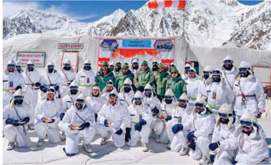
where soldiers have to battle frostbite and high winds.