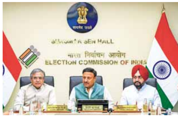
Chief Election Commissioner Rajiv Kumar with Election Commissioners Gyanesh Kumar and Sukhbir Singh Sandhu addresses the media in New Delhi on Monday

Amid concerns over rising temperature given the forecast of above normal maximum temperatures and heatwaves in certain parts of the country, the Election Commission on Monday decided to set up a task force comprising officials from concerned agencies that will review the impact of heatwave and humidity, five days before each polling phase for any concerning developments and mitigatory measures, if necessary.