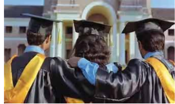
and management studies while IIM-Bangalore and IIM-Calcutta were among the top 50.

The QS World University Rankings by Subject were announced earlier this month in which IIM-Ahmedabad figured among the top 25 institutions globally for business