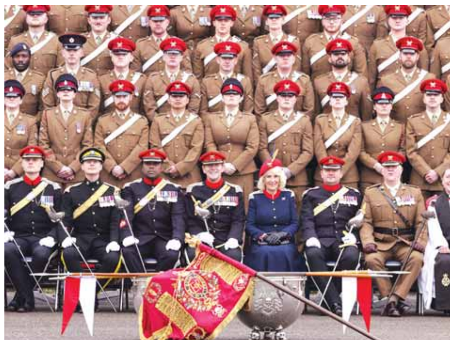
Britain's Queen Camilla poses for a group photograph with The Royal Lancers, in Caterick, England. Queen Camilla undertakes her first visit to the Regiment since being appointed as their Colonel-in-Chief.

that for more than seven years hindered its ability to compete in targeted search ads. An FTC investigation into whether that violated the Anti-Monopoly Law led Google to drop the restrictions. Google said in an emailed statement that it has cooperated fully with the commission's probe, and stressed the commission has not found it had outright violated anti-monopoly laws. It promised to carry out the commission's directives to offer "valuable" search functions to Japanese users and advertisers. Line Yahoo declined comment. Google will be under review for the next three years, to ensure it carries out needed changes, the commission said.