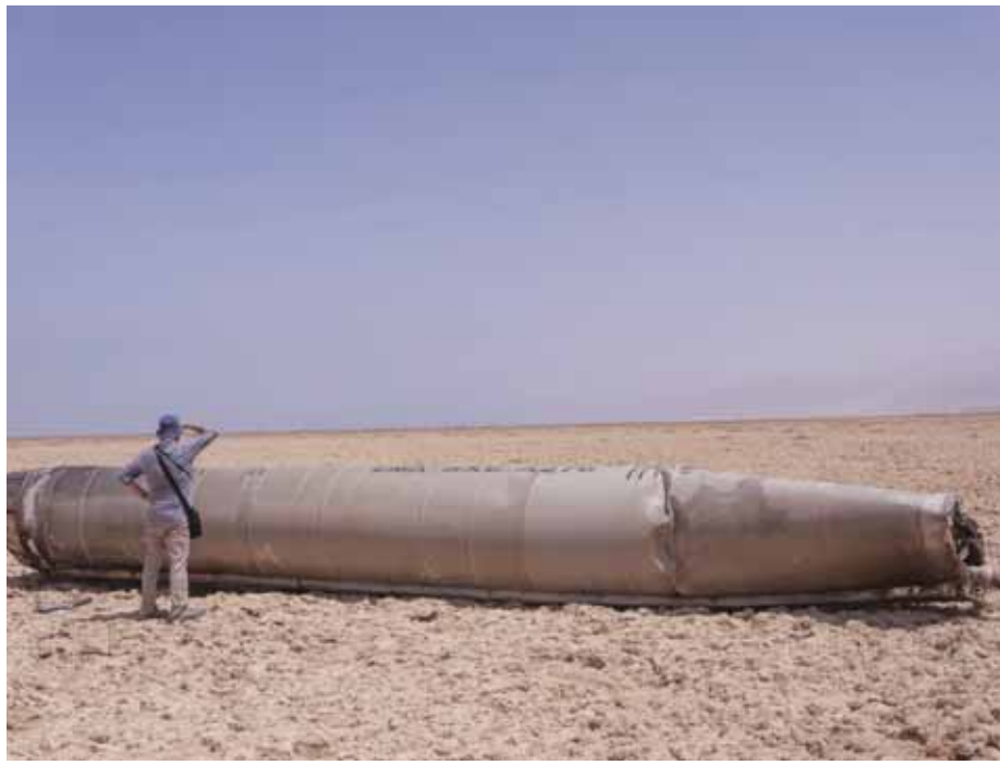
A photojournalist looks at part of the intercepted ballistic missile that fell near the Dead Sea in Israel, Sunday. The suspected Israeli killing of Iranian generals at an Iranian diplomatic compound in Syria on April 1 prompted Iran's retaliatory barrage last weekend of more than 300 missiles and drones that the U.S., Israel and regional and international partners helped bat down without significant damage in Israel. And then came Friday's apparent Israel.

Israel's Military Intelligence chief Major General Aharon Haliva resigned on Monday, taking responsibility for his unit's failures during the unprecedented October 7 Hamas attacks on the Jewish state. Haliva is the first General of the Israeli army's general staff to leave his position due to the failures that led to the massive attack by the Palestinian militant organisation Hamas and the subsequent war in Gaza. In his resignation letter written in Hebrew, Haliva said, "The Intelligence Division did not live up to the task we were entrusted with. Throughout my duties, I knew that alongside authority comes heavy responsibility." The General said he would like to "take responsibility" for what happened on October 7 and promised to do his best to complete as many of the war's goals as possible. Haliva also called for the establishment of a state investigative committee, "that can probe and find out in a thorough, in-depth, comprehensive and precise manner all the fac-