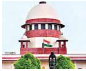
the first two phases.

Special courts for trial of criminal cases related to Members of Parliament and Members of Legislative Assembly decided more than 2,000 cases in 2023, the Supreme Court has been informed.