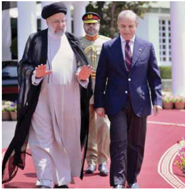
In this photo released by Prime Minister Office, Iranian President Ebrahim Raisi, left, walks with Pakistan's Prime Minister Shehbaz Sharif during a welcome ceremony in the prime minister house in Islamabad, on Pakistan

Pakistan and Iran on Monday agreed on joint efforts to eradicate terrorism as Prime Minister Shehbaz Sharif held talks with Iranian President Ebrahim Raisi and discussed ways to promote bilateral ties at political, economic, trade and cultural levels, months after the two neighbours carried out tit-for-tat air strikes against alleged terrorist hideouts on rival lands. Raisi, the first head of state of any country to visit Pakistan after the February 8 general elections, was welcomed by Sharif at the Prime Minister House where the Iranian leader inspected the Guard of Honour. During their talks, President Raisi and Prime Minister Sharif agreed on joint efforts to eradicate terrorism, state-run Radio Pakistan reported. It added that the two leaders also held discussions to increase trade and communication links between their countries.