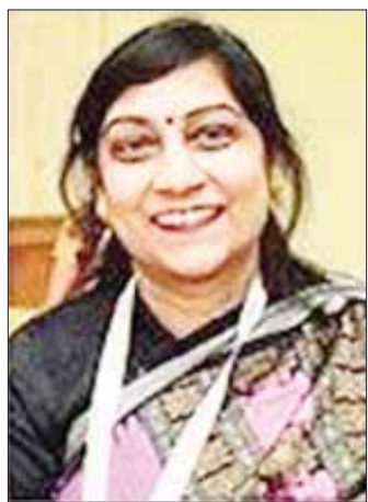
Embarking on the journey of a Global Iconic Fellow is akin to stepping into a realm where your achievements are not just cel-

In the tapestry of professional accolades, there exists a thread so luminous that it not only binds the narrative of excellence but also embroiders its bearer's journey with the gold of global recognition. This thread is the Global Iconic Fellow, a distinction which is conferred for those whose contributions light up the sky of their domains, guiding others towards greatness.