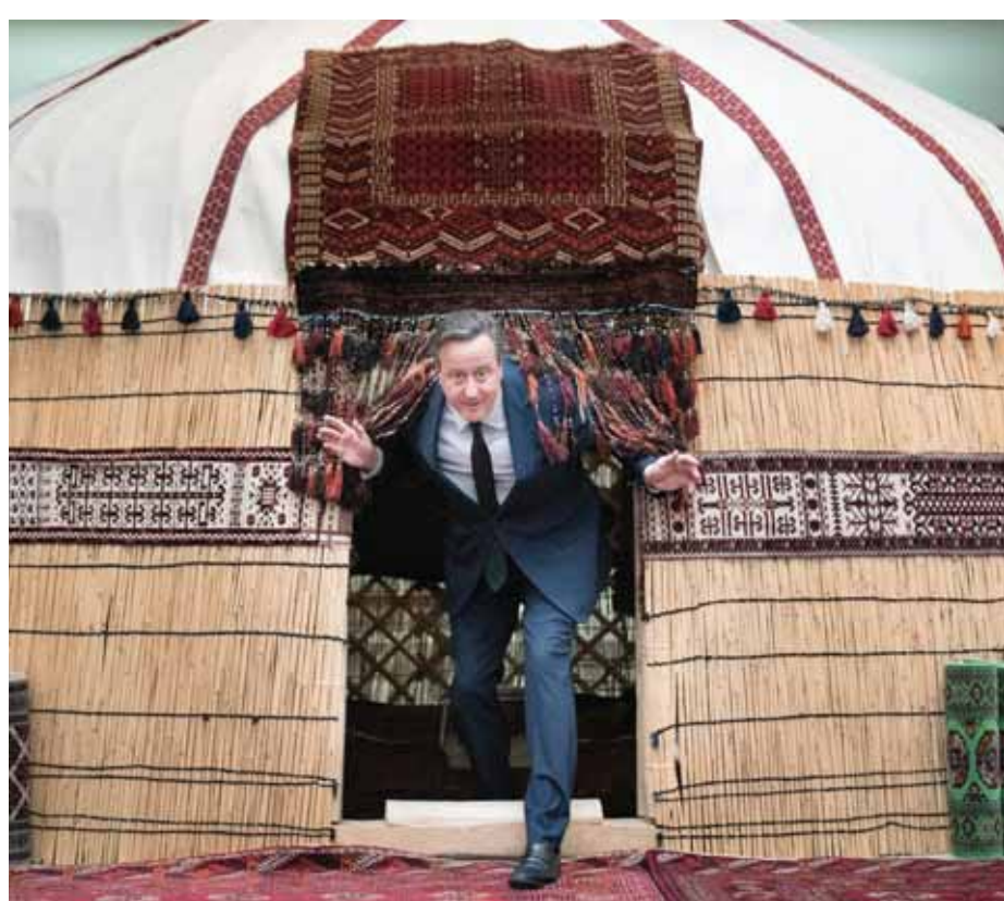
Foreign Secretary Lord David Cameron visits the National Carpet Museum in Ashgabat in Turkmenistan during his five day visit to Central Asia, on Wednesday.