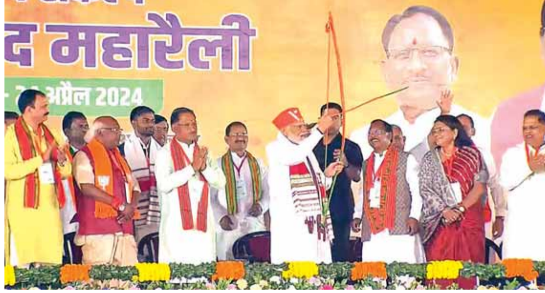
Prime Minister Narendra Modi during a public meeting for the Lok Sabha elections, in Surguja district, Chhattisgarh, on Wednesday

Yet another 'foul' play by a Congress leader gave an opportunity to Prime Minister Narendra Modi and the BJP to mount attack on the grand old party over the ongoing controversial remarks related to wealth and tax. This time its Sam Pitroda and the BJP-led by PM seized on his remarks on inheritance tax saying "zindagi ke saath bhi, zindagi ke baad bhi" as the Opposition party's mantra to "loot" people. As Pitroda's comments provided fresh fodder to the BJP, its leaders latched onto them to target the Congress ahead of the second phase of Lok Sabha elections on Friday.