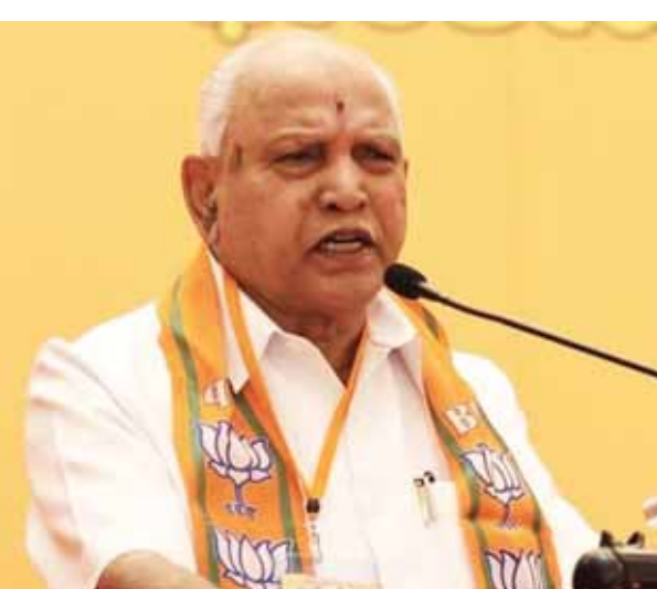
TUMAKURU (KARNATAKA)