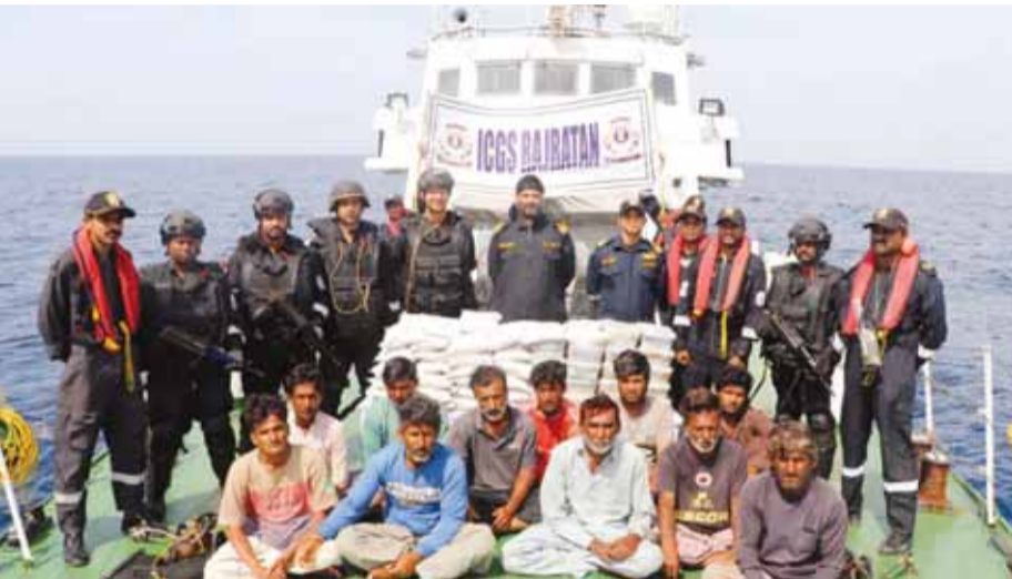
Indian Coast Guard (ICG) personnel with 14 crew members of a Pakistani boat after apprehending them from Indian waters. ICG also seized narcotics from the boat