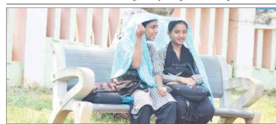
Two girls take shelter at a park in Bhubaneswar in the midst of scorching heat on Sunday.