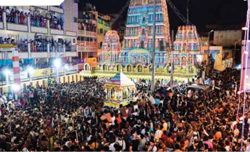
'Veerakumars' gather to participate in the the Karaga festival at Sri Dharmarajana Swamy Temple, in Bengaluru