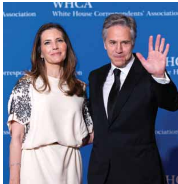
Secretary of State Antony Blinken and his wife, Evan Ryan, pose for photographers as they arrive at the annual White House Correspondents' Association Dinner in Washington on Saturday.

"Shame on you!" protesters draped in the traditional