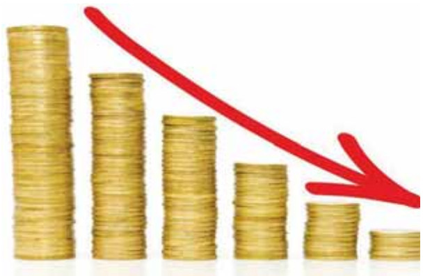
monitored by CRISIL, only 12 are expected to have clocked an improvement in revenue growth both sequentially and on-year for the quarter." Consumer discretionary

India Inc is likely to log 4-6 per cent revenue growth in the January-March quarter of 2023-24, marking the slowest quarterly growth since recovery from the Covid-19 pandemic which began in September 2021, said a Crisil report. The report is based on an analysis of 350 companies which exclude financial services and oil and gas sectors firms. The moderation follows stronger growth in previous years, the report said, adding "among the 47 sectors