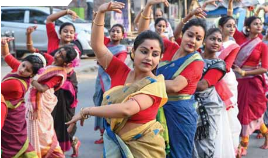
Members of a dance group perform on a road on International Dance Day, in Nadia