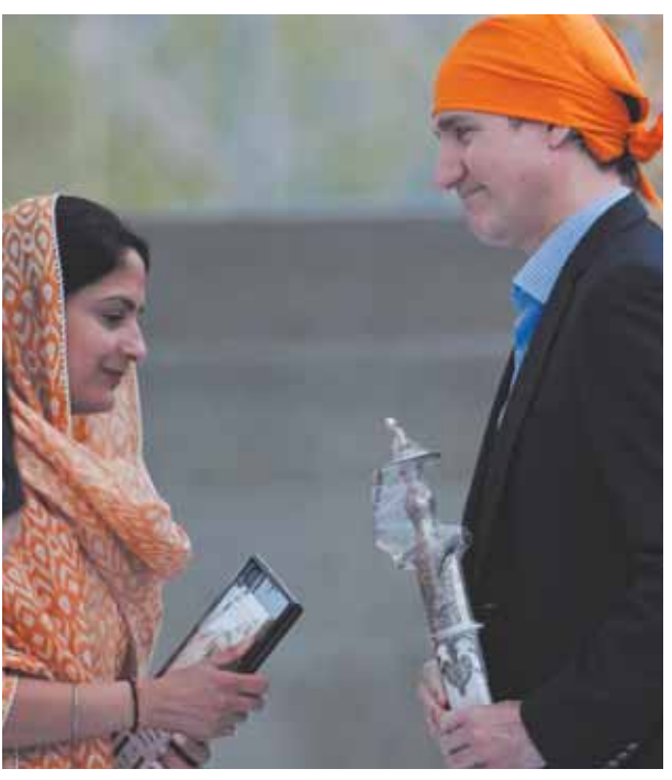
Canadian Prime Minister Justin Trudeau, right, reacts after receiving a ceremonial talwar as a special gift from the Ontario Sikhs and Gurudwara Council after speaking during Khalsa day celebrations at City Hall in Toronto, Sunday.

Authority issued an alert warning motorists to brace for heavy traffic and debris that blocked the roads around Naivasha and Narok, west of the capital, Nairobi. The wider East African region is experiencing flooding due to the heavy rains, and 155 people have reportedly died in Tanzania while more than 200,000 people affected in neighbouring Burundi.