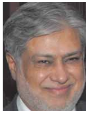
However, according to a Geo News report, the appointment of a four-time finance minister as foreign minister suggested a ramped-up role for economics in the nation's diplomacy as the cash-strapped country tries to secure another International Monetary Fund (IMF) Deal and shore up external financing from foreign capitals.

the "rarely filled" slot of deputy prime minister has raised many questions, the report said. The main talking point is that PML-N supremo Nawaz Sharif wants to have his "confidant" in a key position in the federal cabinet to "compensate him for the loss of the finance portfolio", it said.