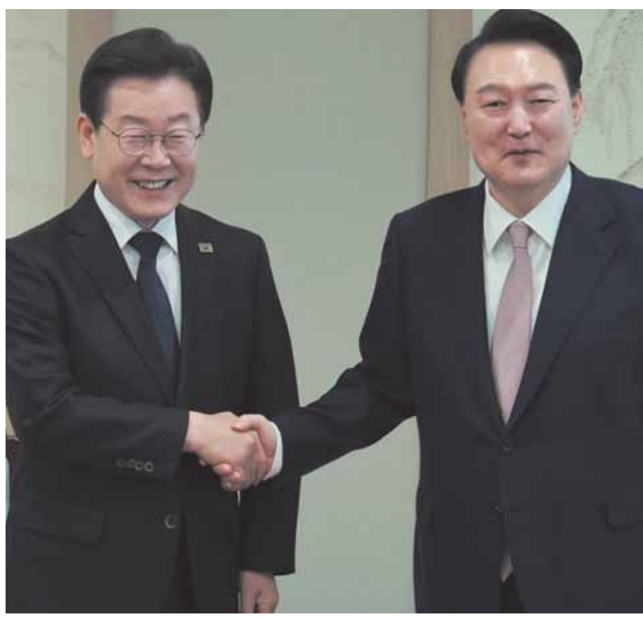
South Korean President Yoon Suk Yeol, right, shakes hands with main opposition Democratic Party leader Lee Jae-myung during a meeting at the presidential office in Seoul South Korea, Monday.

E mboldened by his party's recent election win, South Korea's opposition leader pressured President Yoon Suk Yeol to accept special investigations into allegations involving top officials and his wife, as they met Monday for talks on bipartisan cooperation.