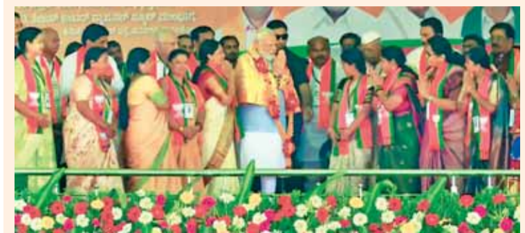
Prime Minister Narendra Modi being felicitated during a public meeting for Lok Sabha elections, in Bagalkote, Karnataka, on Monday.