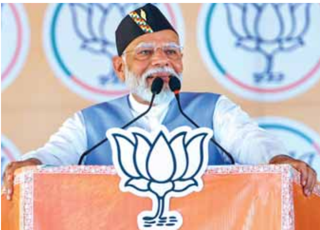
Prime Minister Narendra Modi addresses a public rally ahead of upcoming Lok Sabha elections in Udham Singh Nagar district in Uttarakhand on Tuesday

family shehzada (prince) has threatened there will be fire if Modi gets another term in office. Staying out of power has made them so desperate that they are now talking about setting the country afire. Would you let them do it? Is this the kind of language used in a democracy? Wouldn’t you punish them?” Modi said. At an INDIA Bloc rally in Delhi’s Ramlila Maidan on Sunday, Rahul Gandhi had said if the BJP wins the election through “match-fixing” and changes the Constitution, then the country would be on “fire” and would not survive. “The Congress, with its Emergency-mindset, no longer has faith in democracy. Therefore, it is busy instigating