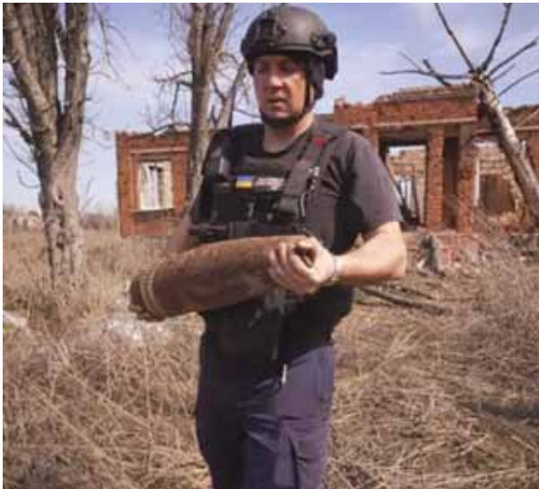
A Ukrainian Emergency Situation sapper carries an unexploded shell after using a mine-clearing machine to clear the site of explosives after battles with Russian troops, near Balaklia, Kharkiv region, Ukraine on Monday.

Ukrainian drones attacked industrial facilities in the province of Tatarstan, Russian authorities said Tuesday, in what would be Kyiv's deepest strike inside Russian territory since the war began more than two years ago. Seven people were injured in the attack on facilities near the cities of Yelabuga and Nizhnekamsk, located some 1,200 kilometers (745 miles) east of Ukraine, Russian regional authorities said. The strike damaged a hostel for students and workers in a free economic zone where a factory manufacturing Iranian-designed drones is reportedly located, other media reports said. Tatarstan is known for its high level of industrialization. Tatarstan officials said the attack didn't disrupt industrial production, while Nizhnekamsk's mayor said the attempt to strike a refinery was thwarted by air defenses. Kyiv officials normally neither