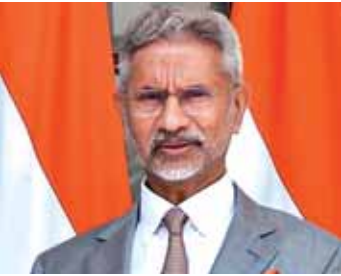
External Affairs Minister S Jaishankar

Ministry of External Affairs (MEA) on Tuesday rejected attempts by China to rename places in Arunachal Pradesh and asserted that assigning “invented names” will not alter the reality that the State “is, has been, and will always be” an integral and inalienable part of India. Responding to questions at a Press conference, External Affairs Minister S Jaishankar on Monday had said, “If today I change the name of your house, will it become mine? Arunachal Pradesh was, is and will always be a State of India. Changing names does not have an effect.”