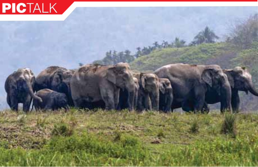
A herd of wild Asiatic elephants seen on the outskirts of Guwahati