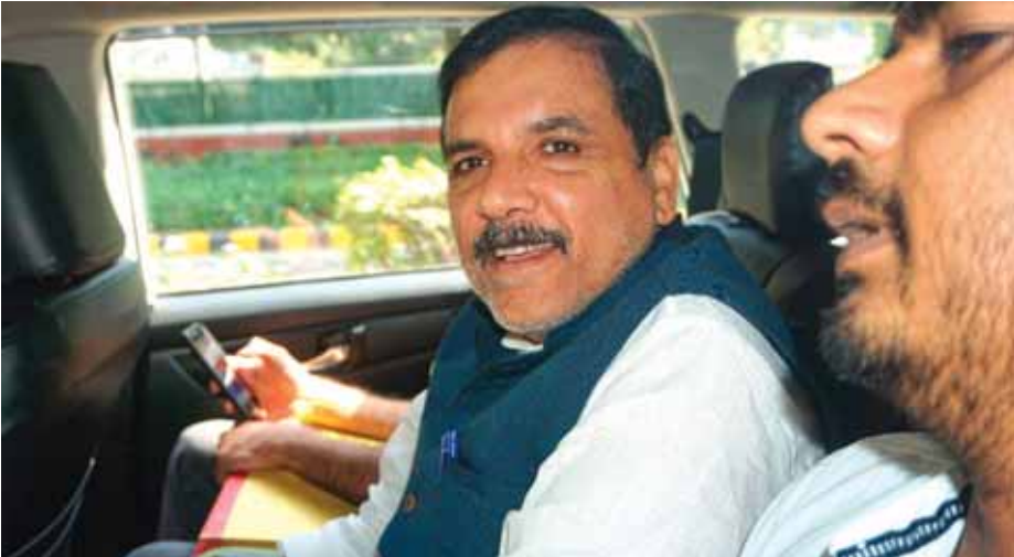
In this file photo, AAP MP Sanjay Singh being taken to the Rouse Avenue Court by the Enforcement Directorate officials in connection with the Delhi excise policy case in New Delhi. Singh was on Tuesday granted bail in the case by the SC

The top court decision has brought a big relief to the Aam Aadmi Party (AAP) in midst of Lok Sabha poll campaigning as two of its top leaders — national convener and Delhi Chief Minister Arvind Kejriwal and former Deputy Chief Minister Manish Sisodia — are in jail in connection with the case. The bench comprising Justices Sanjiv Khanna, Dipankar Datta and PB Varale passed the order to grant him bail, who has been in jail for six months, observing that no money has been recovered from his possession and there is no trace of it, while orally commenting that Singh would be entitled to indulge in