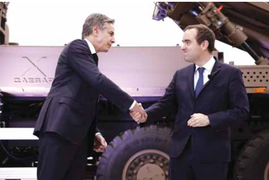
U.S. Secretary of State Antony Blinken, left, and French Defence Minister Sébastien Lecornu shake hands as they attend the French Support for Ukraine Public Diplomacy Event at the Nexter Systems headquarters in Versailles, near Paris, France, on Tuesday.

Ukrainian President Volodymyr Zelenskyy on Tuesday urged delegates at a conference on justice and compensation in Ukraine to continue efforts to tackle impunity for war crimes in order to "provide real strength to our common security — security from aggressions and terror?" Ministers and officials from dozens of countries met in the Netherlands to discuss how to bring justice to victims of Russia's invasion of Ukraine, as the war sparked by Russia's invasion drags on in its third devastating year. The International Criminal Court has issued arrest warrants for Russian President Vladimir Putin and the country's commissioner for children's rights charging them with personal responsibility for the abductions of children from Ukraine. The court also has issued warrants for two senior Russian military officers for alleged responsibility for attacks on critical infrastructure in Ukraine. "Let the real peace be restored faster. And let everyone who destroys peace be truly afraid