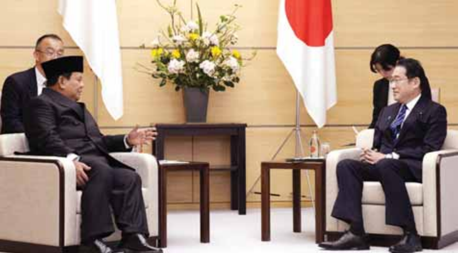
Indonesian President-elect and current Defense Minister Prabowo Subianto, left, and Japan's Prime Minister Fumio Kishida, right, meet at the prime minister's office Wednesday, in Tokyo.

Indonesian President-elect Prabowo Subianto said he wants to “further strengthen” relations with Japan as he met with Japanese Prime Minister Fumio Kishida on Wednesday on the heels of a visit to China. Subianto, who's currently defence minister, told Kishida that the two countries are longtime friends who have built a cooperative relationship, and that he hoped to further strengthen the relationship. Japan has been seeking closer ties with Southeast Asian countries, especially in maritime security and defence, in the face of China's increasingly assertive military presence.