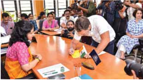
Congress candidate Rahul Gandhi files his nomination papers for the upcoming Lok Sabha elections, in Wayanad district, on Wednesday

Government schemes and their benefits. “If they are not getting the benefits, tell them about Modi's guarantee of ensuring benefits to them. “Our target is to add 370 votes per booth compared to previous elections, with focus on women and first-time voters,” he said. Modi asked the BJP workers to focus on youth voters, particularly first-time voters, and make them aware of the corruption and other misdeeds of the previous Governments. Referring to the construction of the Ram temple in Ayodhya, he said now Ramlalla is seated in the temple, Article 370 has been abolished and law against triple talaq is in place. “He said the law against triple talaq has given security to Muslim families. Earlier, elderly persons in families remained worried that after marriage their daughters might return home due to triple talaq,” he said, adding, “when intentions are clear, good results come”. This time voters are saying “Phir ek baar Modi sarkar” (Modi Government once again), the Prime Minister said. During the programme, the PM spoke to booth heads of Etah, Agra, Hathras and Bareilly and directed them to involve party supporters as campaigners to achieve the target.