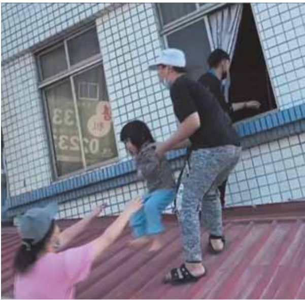
In this image taken from a video footage run by TVBS, residents rescue a child from a partially collapsed building in Hualien, eastern Taiwan on Wednesday

The strongest earthquake in a quarter-century rocked Taiwan during the morning rush hour Wednesday, killing nine people, trapping dozens in quarries and sending some residents scrambling out the windows of damaged buildings. A tsunami warning was triggered but later lifted. The quake, which also injured hundreds, was centred off the coast of rural, mountainous Hualien County, where some buildings leaned at severe angles, their ground floors crushed. Just over 150 kilometres away in the capital of Taipei, tiles fell from older buildings, and schools evacuated their students to sports fields, equipping them with yellow safety helmets. Some children covered themselves with textbooks to guard against falling objects as aftershocks continued. Television images showed neighbours and rescue workers lifting residents, including a toddler, through windows and