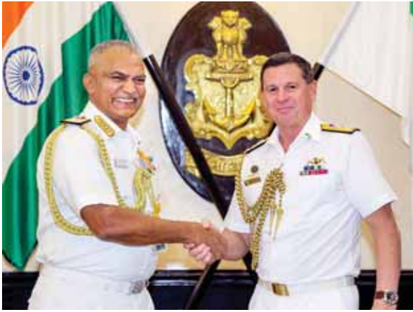
Chief of Naval Staff Admiral R. Hari Kumar with Chief of the Royal Australian Navy Vice Admiral Mark Hammond during a meeting, in New Delhi

India and Australia on Wednesday here reviewed the entire spectrum of their bilateral maritime ties during talks between Navy Chief Admiral R Hari Kumar and his Australian counterpart Vice Admiral Mark Hammond. He is on a visit to India from April 2-6. Giving details of parleys between the two chiefs, Navy officials said discussions focused on avenues to strengthen bilateral maritime cooperation, including increased operational engagements, training exchanges, and information sharing. India and Australia share commonality of perspective on several contemporary maritime security issues in the Indo-Pacific and have been working together closely in several bilateral and multilateral fora such