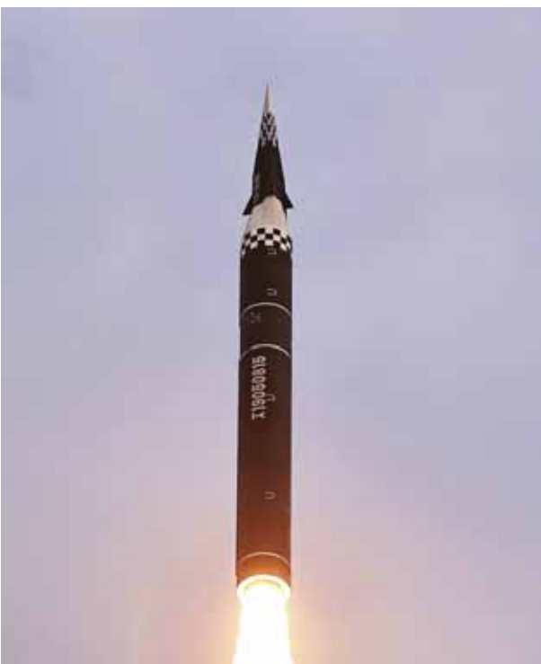
This photo provided by the North Korean government shows the test-fire of what they call an intermediate-range ballistic missile on the outskirts of Pyongyang, North Korea Tuesday.