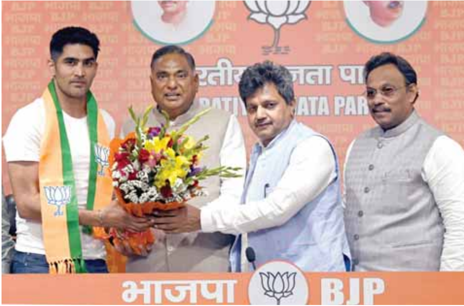
Boxer and former Congress leader Vijender Singh being greeted by BJP leader Ramvir Singh Bidhuri as he joins the party ahead of LS polls at BJP HQ in New Delhi on Wednesday

2008 and 2009 and joined professional boxing in 2015. Vijender said he would work for the welfare of the people. Tawde said it was a matter of great joy that Vijender, who has brought glory to the country, has joined the BJP family. "Under the leadership of Prime Minister Narendra Modi, our government has taken many meaningful steps for the welfare of youth and sportspersons in the last 10 years due to which Vijender ji has joined us," he said, adding it would add strength to the resolve of making 'viksit Bharat (developed India). "The BJP will certainly utilise his (Singh's) strength in Delhi, Haryana, Rajasthan, Uttar Pradesh and all other regions. I am confident that the BJP will succeed in achieving its target more firmly with his joining the party," he said.