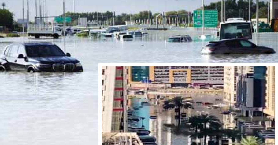
Vehicles sit abandoned in floodwater covering a major road in Dubai, United Arab Emirates, on Wednesday. Heavy thunderstorms lashed the United Arab Emirates on Tuesday, dumping over a year and a half's worth of rain on the desert city-State of Dubai in the span of hours as it flooded out portions of major highways and its international airport

Heavy thunderstorms lashed the United Arab Emirates on Tuesday, dumping over a year and a half's worth of rain on the desert city-State of Dubai in the span of hours as it flooded out portions of major highways and its international airport. Meanwhile, the death toll in separate heavy flooding in neighbouring Oman rose to 18 with others still missing as the sultanate prepared for the storm. The rains began late Monday, soaking the sands and roadways of Dubai with some 20 millimetres (0.79 inches) of rain, according to meteorological data collected at Dubai International Airport. The storms intensified around 9 am local Tuesday and continued throughout the day, dumping more rain and hail onto the overwhelmed city.