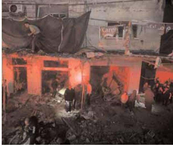
Palestinians search for survivors after an Israeli airstrike on a residential building of the abo al Hanood family after an Israeli airstrike in Rafah refugee camp, southern Gaza Strip, Wednesday.

British Foreign Secretary David Cameron said Wednesday that Israel "is making a decision to act" in response to Iran's missile and drone attack over the weekend, while Iran warned that even the "finest" invasion of its territory would bring a "massive and harsh" response. Israel has vowed to respond to Iran's unprecedented attack without saying when or how, leaving the region bracing for further escalation after months of unrest linked to the ongoing war in Gaza. Israel's closest allies, including the United States and the United Kingdom — which helped it repel the Iranian attack — are trying to limit any further escalation. Iran's President Ebrahim Raisi meanwhile warned Israel against any retaliation as he addressed an annual army parade, which had been relocated to a barracks from its usual route and was not carried live on state TV — possibly because of fears that it could be targeted.