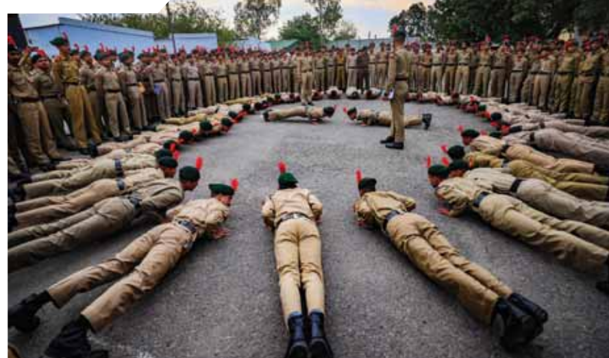
National Cadet Corps perform a drill during their 10-day summer season camp at Nagrota, in Jammu