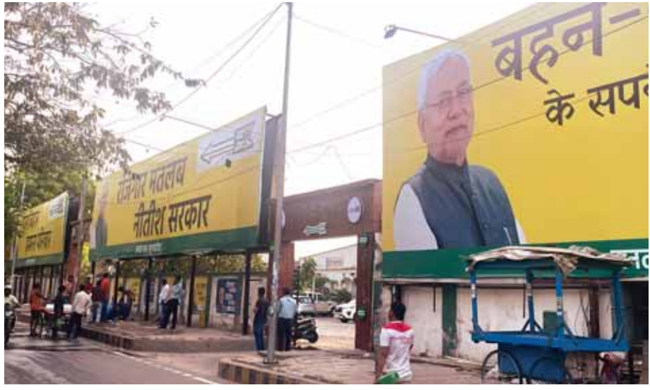
Usually a hub of political activity during elections, this is the scene outside the Janata Dal (U) head office in Patna on Wednesday

across the world are facing difficulty in explaining his frequently changing sides. "Nitish Kumar rode over Lalu Raj and people