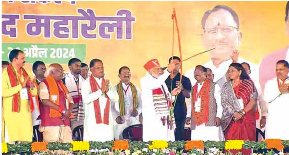
Prime Minister Narendra Modi during a public meeting for the Lok Sabha elections, in Surguja district, Chhattisgarh, on Wednesday

In his poll rallies, Modi framed Pitroda's comments in his wider onslaught against the Congress, asserting that they have exposed its hidden agenda and that the party has become so removed from the country's social and family values that it wants to legally rob people of their assets and lifelong savings they want to bequeath to their children. Pitroda had spoken about inheritance tax in the US while delving into the issue of