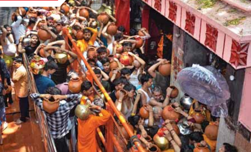
Devotees carrying holy water from Ganga river wait in queues to perform 'puja' at Vindhyachal Dham, in Mirzapur