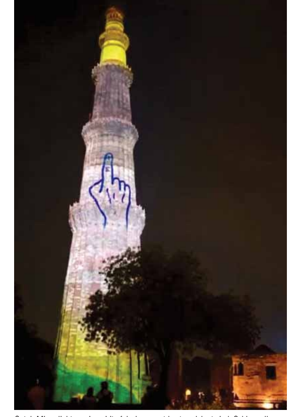
Qutub Minar lights up in spirit of Jashn-e-matdan to celebrate Lok Sabha polls