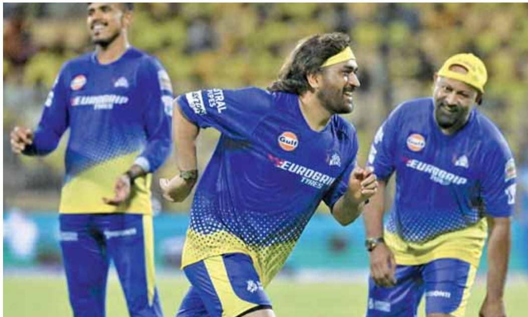
did not help them either. A high-flying SRH, on the other hand, were brought to the ground by RCB when they suffered only their third defeat of the season at home by 35 runs on Thursday.