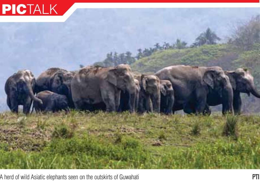
A herd of wild Asiatic elephants seen on the outskirts of Guwahati

The popular perception is that the election was a farce and Imran remains popular though behind bars. He was ousted from office two years back when he fell out of favour with the Pakistan army, which holds significant influence as the kingmaker in the country. Imran campaigned for his party in the general elections but was put behind bars just before the elections and remained there throughout the election while Pakistan Muslim League (N) won the elections and Shehbaz Sharif was elected as the prime minister of the country. The popular perception is that it is the Pakistan Tehreek-e-Insaf of Imran Khan has a large support base and Imran remains a popular leader. With the court verdict now going in his favour Imran may take on the ruling party more aggressively. While Imran Khan's supporters see it as a vindication of his leadership and a blow to his political adversaries, PML(N) is likely to intensify its efforts to dig deeper into Imran's follies. Moreover, the role of the military in Pakistani politics continues to be a subject of speculation and concern. Amidst these challenges, Pakistan faces an uncertain future. A lot needs to be done to ensure good governance and accountability in the country. As Pakistan navigates through these turbulent times, the need for strong and principled leadership has never been more pressing.