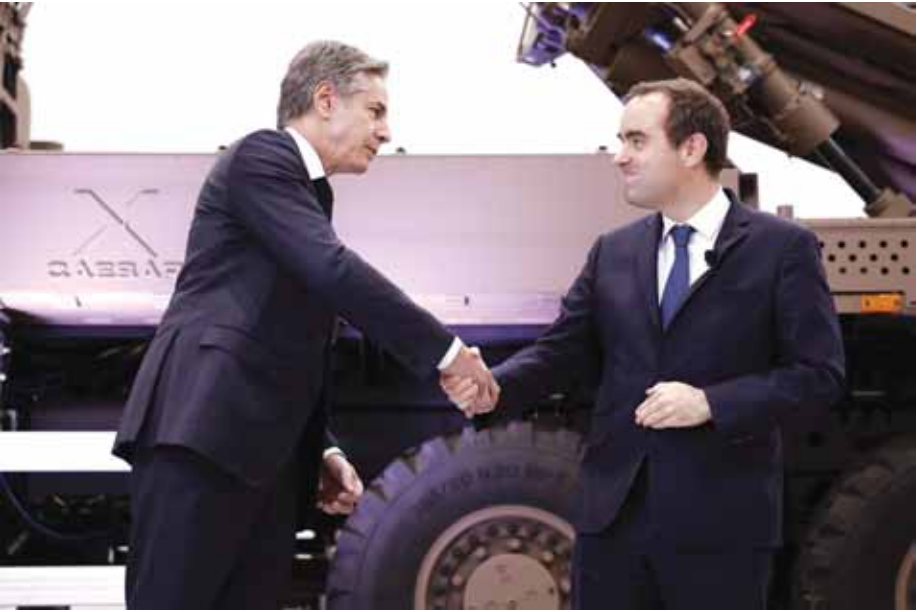
U.S. Secretary of State Antony Blinken, left, and French Defence Minister Sébastien Lecornu shake hands as they attend the French Support for Ukraine Public Diplomacy Event at the Nexter Systems headquarters in Versailles, near Paris, France, on Tuesday.

Ukrainian President Volodymyr Zelenskyy on Tuesday urged delegates at a conference on justice and compensation in Ukraine to continue efforts to tackle impunity for war crimes in order to "provide real strength to our common security — security from aggressions and terror?" Ministers and officials from dozens of countries met in the Netherlands to discuss how to bring justice to victims of Russia's invasion of Ukraine, as the war sparked by Russia's invasion drags on in its third devastating year. The International Criminal Court has issued arrest warrants for Russian President Vladimir Putin and the country's commissioner for children's rights charging them with personal responsibility for the abductions of children from Ukraine. The court also has issued warrants for two senior Russian military officers for alleged responsibility for attacks on critical infrastructure in Ukraine. "Let the real peace be restored faster. And let everyone who destroys peace be truly afraid