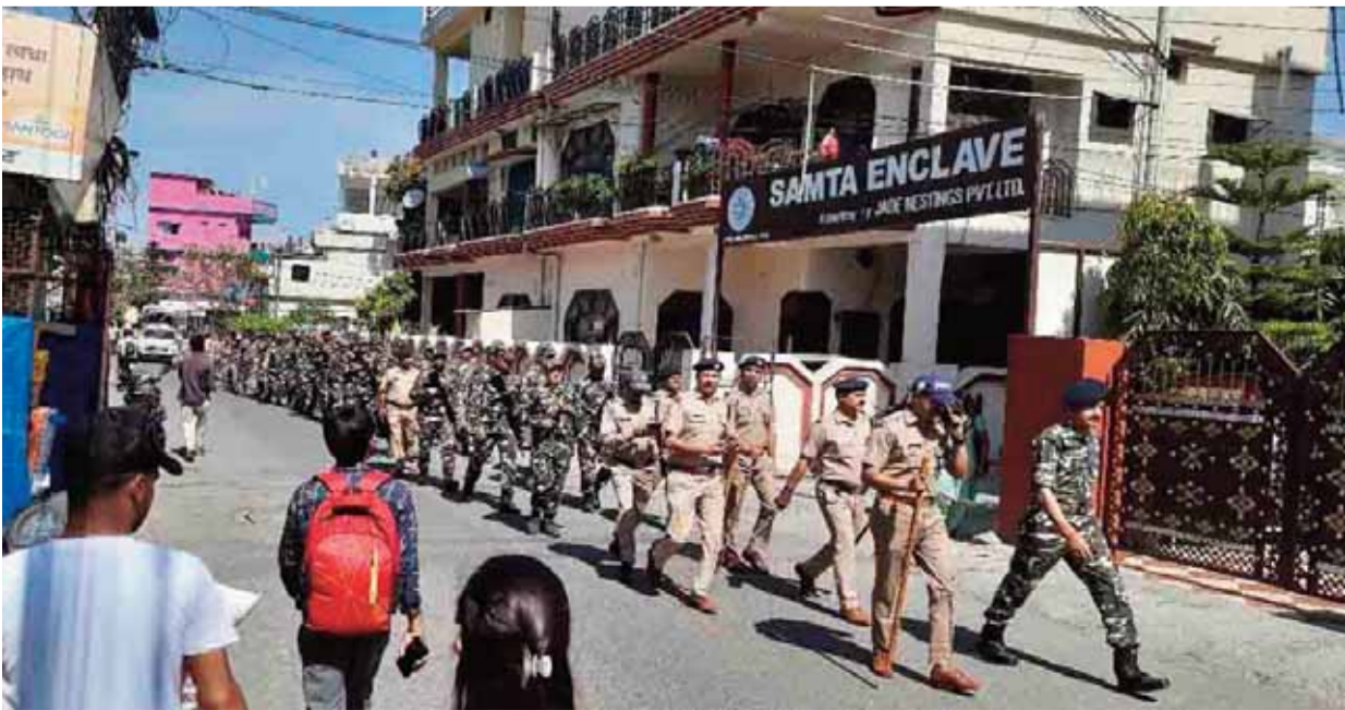
Police and paramilitary personnel take out a flag march in Dehradun on Tuesday in view of the ensuing Lok Sabha election