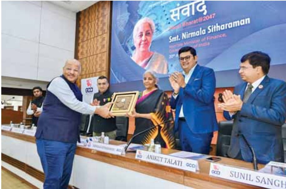
Union Finance Minister Nirmala Sitharaman during an interaction with Gujarat Chamber of Commerce & Industry (GCC) members, in Ahmedabad

approach has helped especially after China plus one started being a concern for many industry experts, she said policies have been tailored in such a way so as to make India an attractive destination for manufacturing and for services. Speaking about inflation, she said it never crossed the tolerance band, except for one month, under the Narendra Modi government, whereas before that (pre-2014) the economy was in a bad shape and inflation was in double digits. “At that time (pre 2014) nobody had any expectations from the country. After much hard work, we have emerged as the world’s fifth largest economy and are confidently saying we will be third in the next two to two-and-half years,” the Union minister said. On employment, Sitharaman said there was lack of complete data from both the formal and informal