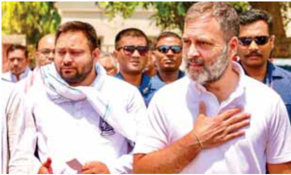
Bhagalpur: Congress leader Rahul Gandhi and RJD leader Tejashwi Yadav during an election campaign rally ahead of Lok Sabha polls, in Bhagalpur

"Our choice is BJP due to Modi (PM Narendra Modi) but the candidate here is from the JDU. We have grievances against Nitish Kumar and have decided to boycott