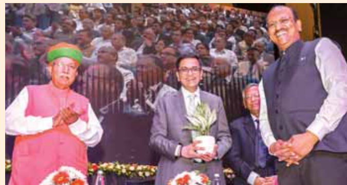
Chief Justice of India D.Y. Chandrachud and Union Minister of Law & Justice Arjun Ram Meghwal during the inauguration of a conference on 'India's New Criminal Justice System - A Progressive Step' organised by the Ministry of Law and Justice, at the Ambedkar International Centre, in New Delhi, on Saturday

"The voter turnout in Bihar is low because the Opposition here is in a state of atrophy. Although the NDA is going to do well everywhere, at least it has some competition in, say, West Bengal, which is a reason why voters there turned up in large numbers yesterday," he told reporters.