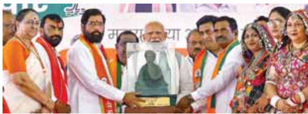
Nanded: Prime Minister Narendra Modi with Maharashtra Chief Minister Eknath Shinde during a rally for Lok Sabha polls, in Nanded, on Saturday

Addressing an election rally at Nanded in Marathwada region, Modi said: "Shehzada is in trouble in Wayanad. Shehzada and his toli (gang) are waiting for the poll to get over on April 26. After that, they will find a safe seat for him. They will put him up there as a candidate". Alluding to Kerala Chief Minister Pinarayi Vijayan's criticism of Rahul on Friday, Modi said: "INDI alliance leaders are speaking against one another.... The Kerala Chief Minister slammed Shehzada in such a manner yesterday that even I do not