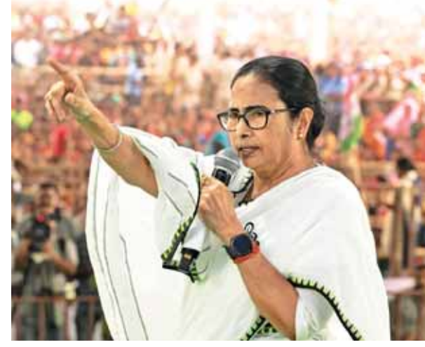
West Bengal Chief Minister Mamata Banerjee during an election campaign meeting for Lok Sabha polls, in North Dinajpur district.

In a major blow to the Trinamool Congress in the midst of general elections the Calcutta High Court on Monday ordered the cancellation of appointments of 25,753 teachers and non-teaching staff made through the recruitment process of State Level Selection Test-2016 (SLST) in West Bengal Government-sponsored and aided schools, declaring the selection process as "null and void". The court directed the "illegal recruits" to return their emoluments drawn in the past several years within four weeks. As the order came barely a couple of days after Bengal Opposition Leader Suwendu Adhikari presaged a "massive explosion that will shake the foundations of the TMC," Chief Minister Mamata Banerjee immediately called the court order "illegal" and vowed to move the Supreme Court for justice. "Now you can see the relationship between what he (Adhikari) said about a possible explosion and the order that has come today... this is an illegal order... I am not talking about the Judges but the order... we do not accept this order dictated by the BJP... We do not accept this order that will throw 26,000 people out of their jobs affecting 1.5 lakh or even more people directly... we will go to the higher court," Banerjee said at an election rally in North Dinajpur. Bengal SSC Chairman