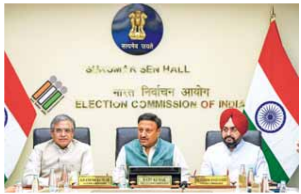
Chief Election Commissioner Rajiv Kumar with Election Commissioners Gyanesh Kumar and Sukhbir Singh Sandhu addresses the media in New Delhi on Monday.