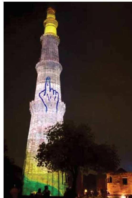
Qutub Minar lights up in spirit of Jashn-e-matdan to celebrate Lok Sabha polls