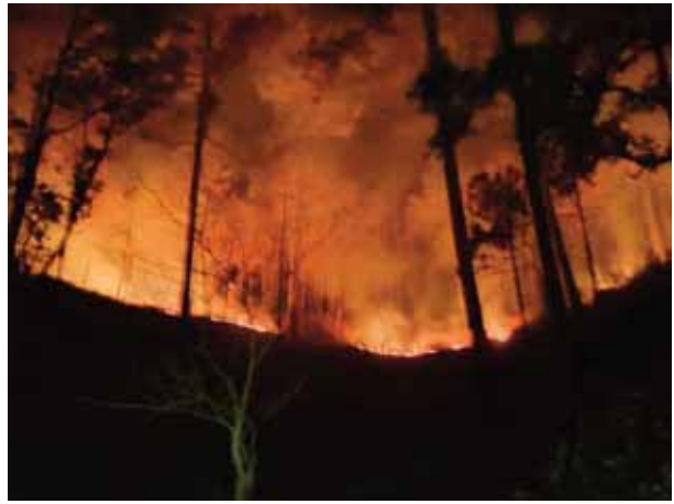
Bhimtal lake and use it to douse fires in the forests in the area. Locals said that the forest

Even as parts of the State witnessed light rain along with thunderstorms and hail, forest fires continued to rage in Nainital district on Saturday. The authorities roped in a helicopter of the Indian Air Force to lift water from the