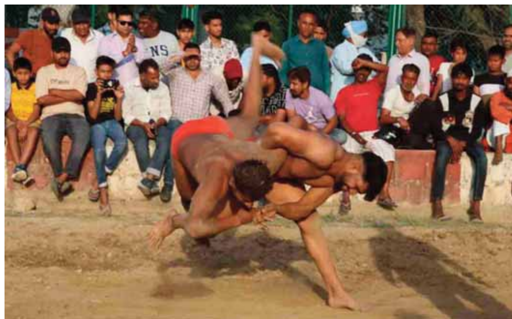
Wrestlers in action during a Dangal organised on the Parade Ground in Dehradun on Sunday