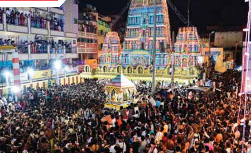
Veerakumars' gather to participate in the the Karaga festival at Sri Dharmarajana Swamy Temple, in Bengaluru