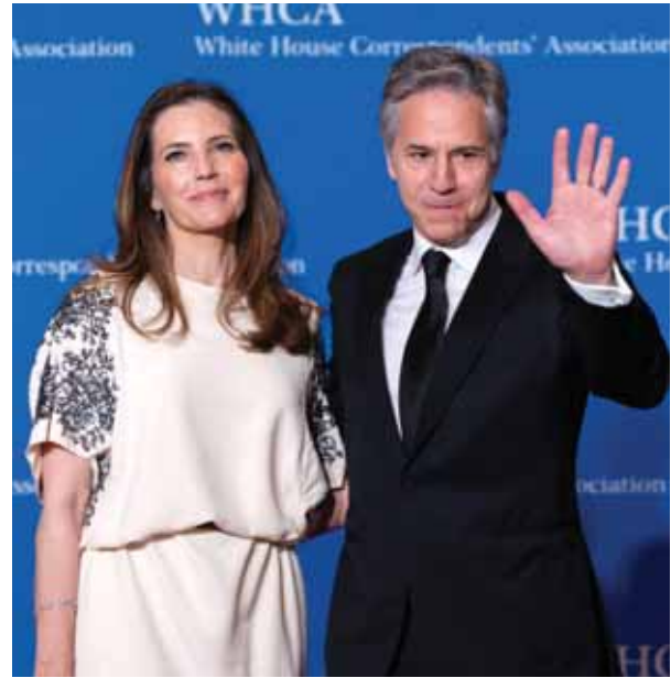
Secretary of State Antony Blinken and his wife, Evan Ryan, pose for photographers as they arrive at the annual White House Correspondents' Association Dinner in Washington on Saturday.

"Shame on you!" protesters draped in the traditional