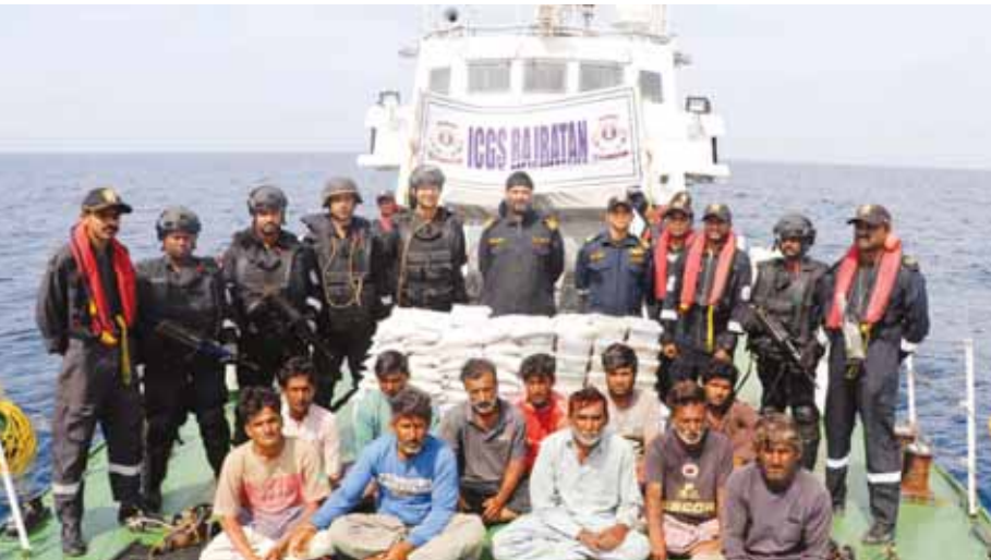
Indian Coast Guard (ICG) personnel with 14 crew members of a Pakistani boat after apprehending them from Indian waters. ICG also seized narcotics from the boat. (PTI)