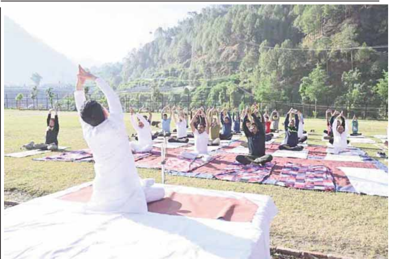
Uttarkashi police personnel participate in a Yoga camp organised at the police line in Gyansu on Sunday

Dhela rescue centre where she is being monitored by the senior veterinary officer. According to the officials, the tigress is aged about two to three years. A DNA sample was collected from the tigress