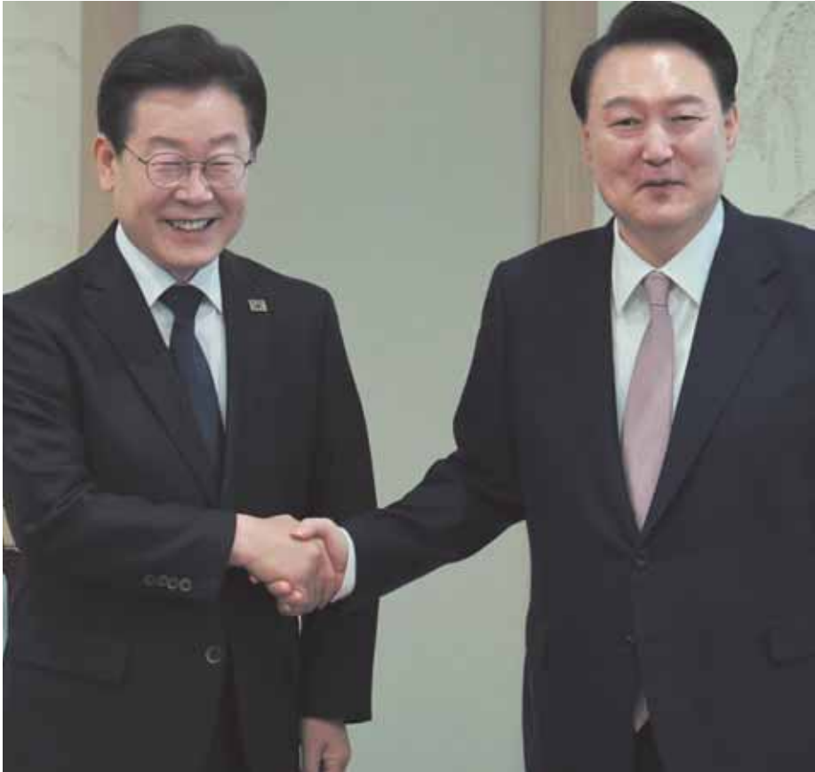
South Korean President Yoon Suk Yeol, right, shakes hands with main opposition Democratic Party leader Lee Jae-myung during a meeting at the presidential office in Seoul South Korea, Monday

Emboldened by his party's recent election win, South Korea's opposition leader pressured President Yoon Suk Yeol to accept special investigations into allegations involving top officials and his wife, as they met Monday for talks on bipartisan cooperation. The meeting was their first since Yoon took office in 2022 after defeating Lee Jae-myung in the country's closest presidential election race. During their 2022 campaigns, Yoon, Lee and their supporters demonised each other and filed dozens of lawsuits against one another. Yoon proposed the meeting as he faces growing calls to cooperate with Lee's Democratic Party, whose victory in the April 10 parliamentary election allows it to extend its control of the single-chamber National Assembly until after Yoon's single five-year term ends in 2027.