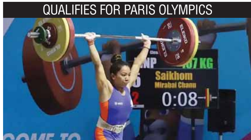
Games in September where she suffered a hip tendonitis injury, was not at her best, but was able to make five clean lifts. Her lifts in the snatch and clean and jerk sections were nowhere close to her personal best efforts. The 29-year-old has a personal best of 88kg in snatch while she had lifted the

Tokyo Olympics silver-medallist Mirabai Chanu all but qualified for the 2024 Paris Games after she finished third in the women's 49kg Group B event of the IWF World Cup here on Monday. Returning from a six-month injury lay off, Chanu lifted a total of 184kg (81kg+103kg) at the tournament, which is the final and a mandatory qualifier for the Paris Olympics. With the completion of her event, Chanu has fulfilled the criteria for the Paris Olympics, which is participating in two compulsory events and three other qualifiers. The 2017 world champion is currently ranked second in the women's 49kg Olympic Qualification Ranking (OQR) behind China's Jian Huihua. The official announcement for the qualification will come after the conclusion of the World Cup when the OQR will be updated. The top 10 lifters from each weight class will qualify for the Paris Olympics. Chanu, who last competed at the Asian