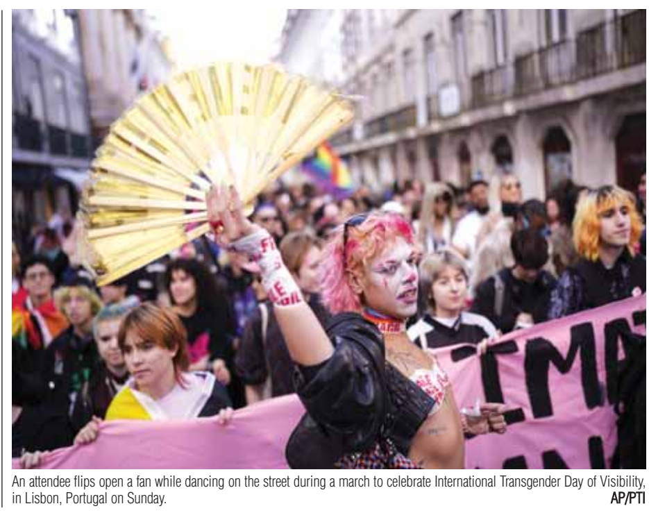
An attendee flips open a fan while dancing on the street during a march to celebrate International Transgender Day of Visibility, in Lisbon, Portugal on Sunday.

that he had hoped to reach an agreement on a nationwide cease-fire in Yemen by the Muslim holy month of Ramadan, which began early in March. He warned that Yemen could be propelled back into war, saying that "the longer the escalatory environment (in the region) continues, the more challenging Yemen's mediation space will become." The war between the Houthis and pro-government forces backed by a coalition of Gulf Arab states has raged since 2014, when the Houthis swept down from the mountains, seized much of northern Yemen and the country's capital, Sanaa, and forced the internationally recognized government to flee into exile to Saudi Arabia.