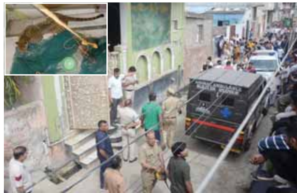
Forest Department personnel capture a leopard which entered a house in Wazirabad on Monday