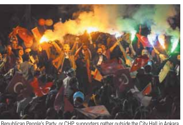
Republican People's Party, or CHP, supporters gather outside the City Hall in Ankara, Sunday.

The Turkish opposition made huge gains in local elections, outperforming President Recep Tayyip Erdogan's ruling party and adding to municipalities gained five years ago. Many wonder on Monday if it's a turning point for the country reeling from economic hardship. The main opposition, the centre-left Republican People's Party, or CHP, kept hold of Istanbul and the capital Ankara by wide margins but also added wins in conservative provinces such as Adiyaman in the south. The party won in 35 of Turkey's 81 provinces — including the country's five most populous cities — while Erdogan's Islamic-oriented Justice and Development Party, or AKP, took 24. Crucially, the CHP took 37.7 per cent of the nationwide vote with nearly all the ballots counted. The AKP secured 35.5 per cent. The surprise results came just 10 months after the opposition was left divided and demoralized following a defeat in last year's presidential and parliamentary elections. "It's a huge turning point," Seda Demiralp, a political science professor at Isik University in Istanbul, said. "The CHP is no longer the opposition party in local government now... (Erdogan) is clearly aware that throughout Turkey voters sent a clear message, even in conservative cities. It's unbelievable, it's a huge deal. It's not just about local government, it's about