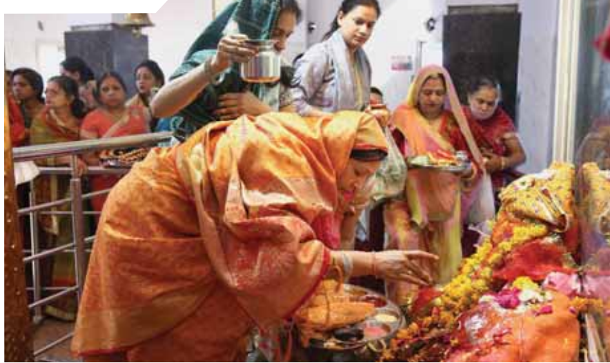
Devotees offer prayers and perform rituals on the occasion of 'Sheetala Saptami', in Bhopal