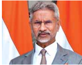
External Affairs Minister S Jaishankar

Ministry of External Affairs (MEA) on Tuesday rejected attempts by China to rename places in Arunachal Pradesh and asserted that assigning "invented names" will not alter the reality that the State "is, has been, and will always be" an integral and inalienable part of India. Responding to questions at a Press conference, External Affairs Minister S Jaishankar on Monday had said, "If today I change the name of your house, will it become mine? Arunachal Pradesh was, is and will always be a State of India. Changing names does not have an effect.