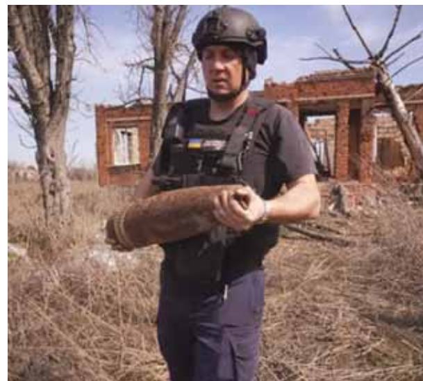
A Ukrainian Emergency Situation sapper carries an unexploded shell after using a mine-clearing machine to clear the site of explosives after battles with Russian troops, near Balaklia, Kharkiv region, Ukraine on Monday.

Ukrainian drones attacked industrial facilities in the province of Tatarstan, Russian authorities said Tuesday, in what would be Kyiv's deepest strike inside Russian territory since the war began more than two years ago. Seven people were injured in the attack on facilities near the cities of Yelabuga and Nizhnekamsk, located some 1,200 kilometers (745 miles) east of Ukraine, Russian regional authorities said. The strike damaged a hostel for students and workers in a free economic zone where a factory manufacturing Iranian-designed drones is reportedly located, other media reports said. Tatarstan is known for its high level of industrialization. Tatarstan officials said the attack didn't disrupt industrial production, while Nizhnekamsk's mayor said the attempt to strike a refinery was thwarted by air defenses. Kyiv officials normally neither