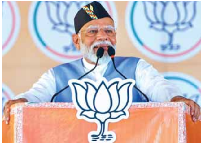
Prime Minister Narendra Modi addresses a public rally ahead of upcoming Lok Sabha elections in Udham Singh Nagar district in Uttarakhand on Tuesday

family shehzada (prince) has threatened there will be fire if Modi gets another term in office. Staying out of power has made them so desperate that they are now talking about setting the country afire. Would you let them do it? Is this the kind of language used in a democracy? Wouldn't you punish them?" Modi said. At an INDIA Bloc rally in Delhi's Ramlila Maidan on Sunday, Rahul Gandhi had said if the BJP wins the election through "match-fixing" and changes the Constitution, then the country would be on "fire" and would not survive. "The Congress, with its Emergency-mindset, no longer has faith in democracy. Therefore, it is busy instigating