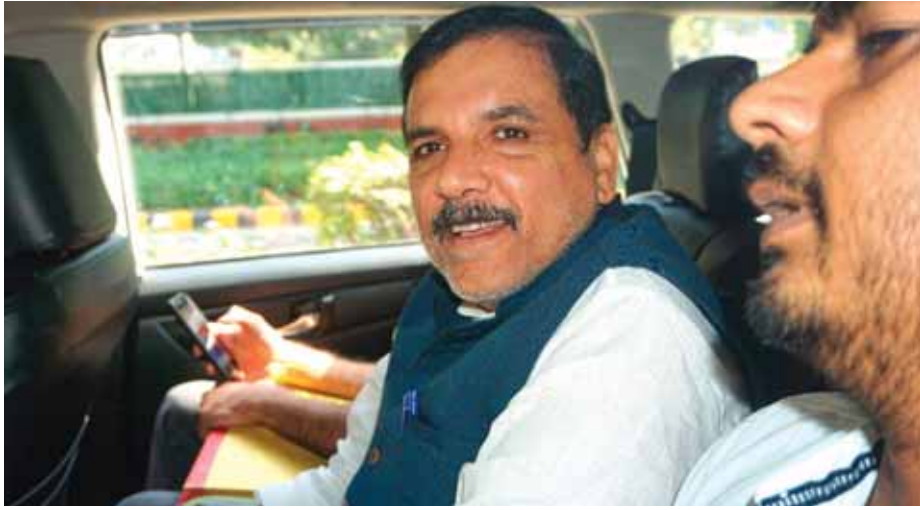
In this file photo, AAP MP Sanjay Singh being taken to the Rouse Avenue Court by the Enforcement Directorate officials in connection with the Delhi excise policy case in New Delhi. Singh was on Tuesday granted bail in the case by the SC

In a relief to AAP leader and Rajya Sabha MP Sanjay Singh, the Supreme Court on Tuesday granted bail to him in the money laundering case related to the Delhi liquor policy case after the Enforcement Directorate conceded that it has no objections.