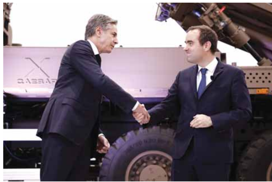
U.S. Secretary of State Antony Blinken, left, and French Defence Minister Sebastien Lecornu shake hands as they attend the French Support for Ukraine Public Diplomacy Event at the Nexter Systems headquarters in Versailles, near Paris, France, on Tuesday.

Ukrainian President Volodymyr Zelenskyy on Tuesday urged delegates at a conference on justice and compensation in Ukraine to continue efforts to tackle impunity for war crimes in order to "provide real strength to our common security — security from aggressions and terror?" Ministers and officials from dozens of countries met in the Netherlands to discuss how to bring justice to victims of Russia's invasion of Ukraine, as the war sparked by Russia's invasion drags on in its third devastating year. The International Criminal Court has issued arrest warrants for Russian President Vladimir Putin and the country's commissioner for children's rights charging them with personal responsibility for the abductions of children from Ukraine. The court also has issued warrants for two senior Russian military officers for alleged responsibility for attacks on critical infrastructure in Ukraine. "Let the real peace be restored faster. And let everyone who destroys peace be truly afraid