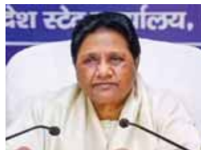
Mayawati speaking at a podium.

Uttar Pradesh, often regarded as the heartland of Indian politics, is witnessing a seismic shift in its electoral dynamics as Mayawati, the formidable leader of the Bahujan Samaj Party (BSP), makes a bold declaration of contesting the upcoming elections independently. This move, which defies traditional alliance strategies, has sent shockwaves through the state's political arena, significantly altering the calculus for all major players. In a departure from the prevalent trend of strategic alliances, Mayawati's resolute stance to go solo in the elections has upended the political equations in Uttar Pradesh. With the BSP firmly asserting its autonomy, the landscape that was once characterized by coalition politics is now undergoing a profound transformation. Despite overtures from the Congress for an alliance, Mayawati's unequivocal decision to field candidates independently has disrupted the opposition's plans to consolidate against the ruling Bharatiya Janata Party (BJP). The proposed I.N.D.I. alliance, which aimed to bring together