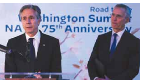
NATO Secretary General Jens Stoltenberg, right, and US Secretary of State Antony Blinken address the audience during a ceremony marking the 75th anniversary of the signing of the North Atlantic Treaty, in Brussels, on Wednesday.

few words meant so much to so many people. So much security. So much prosperity, and so much peace." Outside Brussels on Wednesday evening, US Secretary of State Antony Blinken had paid tribute "to the millions of soldiers, sailors, and aviators whose courage and willingness to put their lives on the line have given weight to our sacred commitment to defend one another." Blinken said that even as foreign ministers mark more than seven decades of peace, "that security — together with the Alliance's core principles of democracy, liberty, and the rule of law — is once again being threatened by those who believe that might makes right... and who seek to redraw borders by force." Ukraine's foreign minister, Dmytro Kuleba, also attended on Thursday. His message was more direct. "Only today, 20 Shahed drones