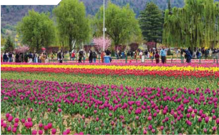
Tulips in bloom at Tulip Garden at the foothills of Zabarwan mountains, in Srinagar