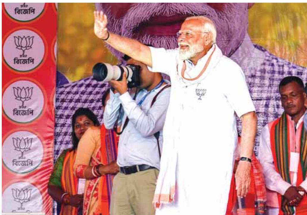
Prime Minister Narendra Modi waves to supporters during an election campaign rally ahead of the upcoming Lok Sabha polls in Cooch Behar district on Thursday

Attacking the TMC for unleashing a reign of terror in Bengal where the women were at the receiving end and of which Sandeshkhali was a striking example, the Prime Minister with an apparent eye on the women voters said, "India saw with horror what happened with the women and poor at Sandeshkhali ... the TMC tried its level best to shield and protect the culprits of Sandeshkhali ... but it is my guarantee that they will never get away with whatever they have done ... they will have to spend