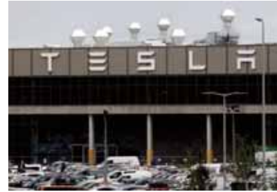
"We have been studying and tracking Tesla's planned investment initiatives in