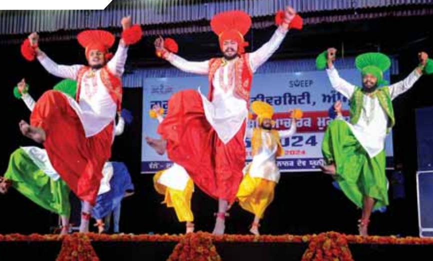
Students perform 'Bhangra' during a folk dance competition at Guru Nanak Dev University, in Amritsar