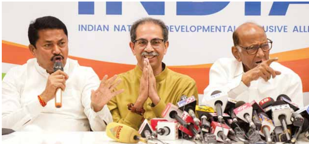
Shiv Sena (UBT) chief Uddhav Thackeray, Maharashtra Congress president Nana Patole and NCP (SP) chief Sharad Pawar during a Maha Vikas Aghadi (MVA) Press conference, in Mumbai, on Tuesday

After weeks of negotiations that involved exaggerated claims, aggressive posturing, climb-downs and compromises, the Opposition Maha Vikas Aghadi (MVA) on Tuesday announced the seat-sharing arrangement reached among its three constituents — Shiv Sena (UBT), Congress and NCP (Sharad Pawar — for all the 48 Lok Sabha constituencies in the State. Under the seat-sharing arrangement, the Shiv Sena (UBT) has walked away with the lion's share of 21 Lok Sabha seats, the Congress has been allotted 17 seats and the Sharad Pawar-led NCP has settled down for the remaining 10 seats. Being the pivot of the Opposition front in the State, the Congress has made maximum sacrifices, by giving up the seats of Sangli and Bhiwandi seats to the Shiv Sena (UBT) and the NCP (SP), respectively. At a joint Press conference held at 'Shivalaya', the Shiv Sena (UBT) office in south Mumbai, NCP (SP) chief Sharad Pawar, Shiv Sena (UBT) leader Uddhav Thackeray and State Congress president Nana Patole unveiled the seat-sharing arrangement hammered out by them for the Lok Sabha polls to be held in the state in five phases from April 19 to May 20.