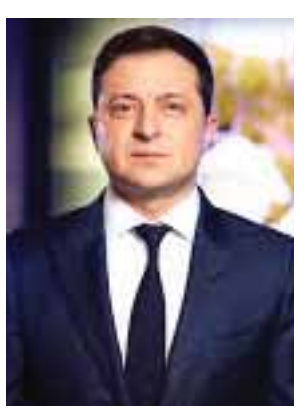
bat. Authorities said a separate bill on demobilisation and rotation would be prepared in the coming months. But the delay caused public outrage among Ukrainians whose relatives have been fighting without breaks for two years. Exhausted soldiers have no means of taking a break from front-line work because of the current scale and intensity of the war.

Kyiv (AP): Ukrainian President Volodymyr Zelenskyy signed a controversial law Tuesday, days after it was passed by parliament, potentially helping Kyiv to boost conscription to replenish depleted forces to fend off Russia's continued aggression. The mobilisation law, published on Ukraine's Parliamentary website, is expected to take effect in a month and make it easier to identify every draft-eligible man in the country.