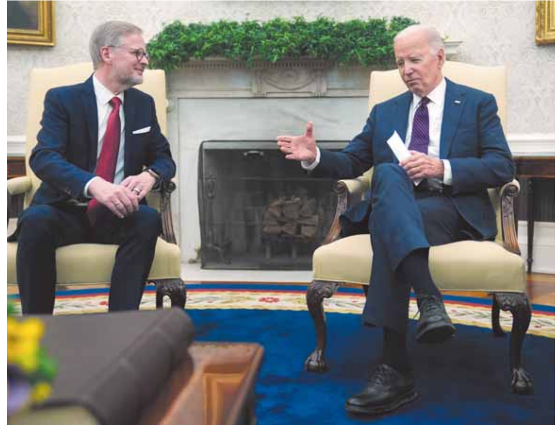
President Joe Biden, right, meets with Prime Minister Petr Fiala of the Czech Republic in the Oval Office at the White House, Monday.

The long-term health impacts of vaping are unknown, and the nicotine contained within them can be highly addictive, it warned. According to official figures, responsible for around 80,000 deaths annually, smoking is the UK's single biggest preventable killer and costs the NHS and economy an estimated GBP 17 billion a year — more than the GBP 10 billion annual revenue from tobacco taxation.