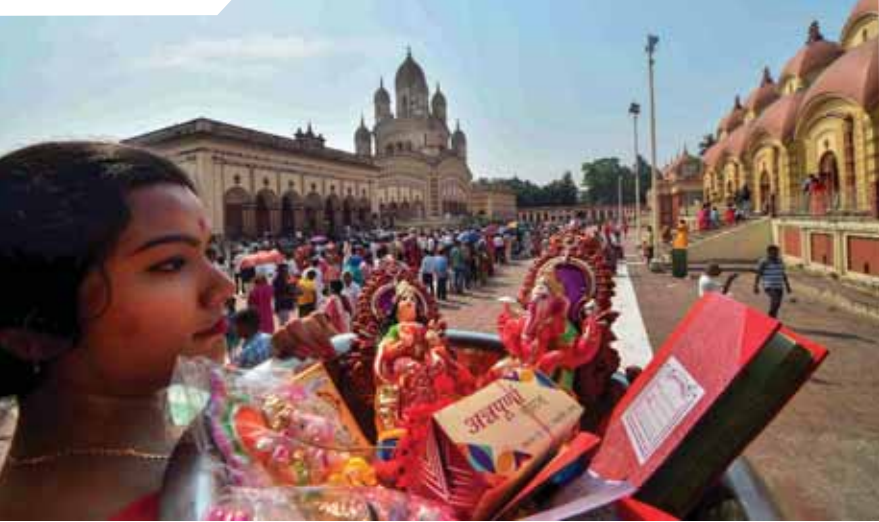
Devotees stand in a queue to offer prayers at Dakshineswar Kali Temple on Bengali New Year, in Kolkata.