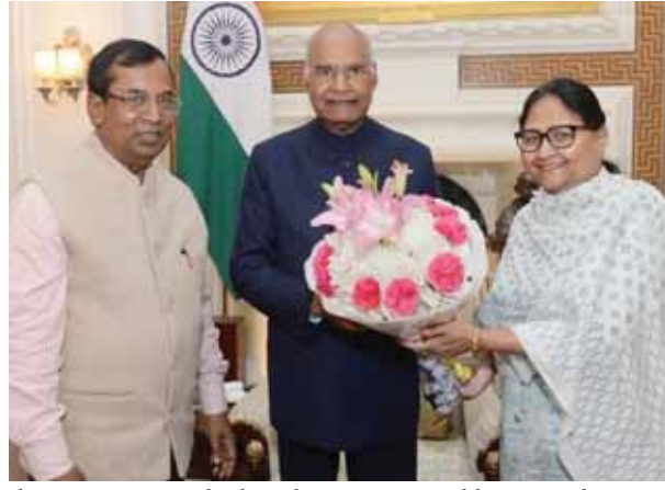
The seat. In 2019, he beat his nearest rival by a staggering margin of 3.20 lakh votes. Bhosale is the 17th holder of the title of Chhatrapati which was founded by the Maratha

parliamentary constituency, which is part of the South 24 Parganas district, is 2,221,470. Among these, 49.07% live in villages and 50.93% are urban dwellers. The proportion of Scheduled Castes and Scheduled Tribes among them is 20.63% and 0.18% respectively. There are seven Assembly seats under Diamond Harbour, including Falta, Satgachhia, Bishnupur, Maheshtala, Budge Budge, Metiabruz and Diamond Harbour. It is among the keenly watched match-ups with the BJP's Das squaring off against the incumbent TMC MP Abhishek Banerjee. In both the 2014 and 2019 Lok Sabha elections, Banerjee won with huge vote margins, proving his popularity and influence in