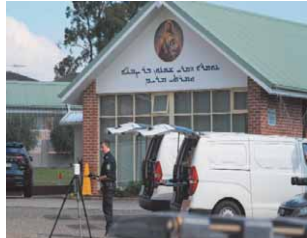
A police forensic officer works at a crime scene at the Christ the Good Shepherd Church in suburban Wakeley in western Sydney, Australia on Tuesday.

Video of the attack spread quickly on social media and an angry mob converged on the