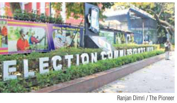
Ranjan Dimri / The Pioneer